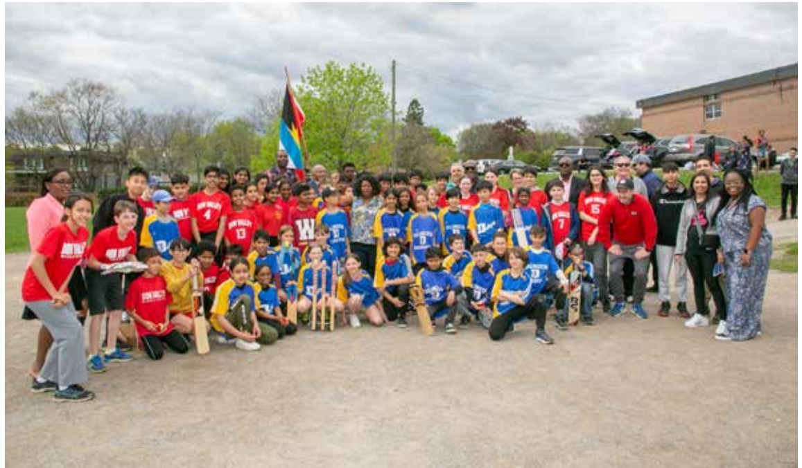
Cricketing greats Sir Vivian Richards, Sir Richie Richardson, Sir Andy Roberts, and Sir Curtly Ambrose raise the flag of Antigua and Barbuda in a photo with the Dallington, Woodbine, and Don Valley school cricket teams.

The Knights’ visit came at an exciting time for the future of cricket in Canada, as a growing South Asian and Afro-Caribbean diaspora continues to bolster the sport into becoming the country’s fastest-growing sport. Additionally, 2024 marks Canada’s first time to play in the ICC Men’s