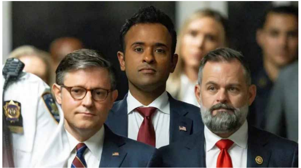
Speaker Mike Johnson (left), former presidential candidate Vivek Ramaswamy (centre) and Congressman Cory Mills at the trial on Tuesday.

Mr Johnson called the trial a "sham" and a "dis-