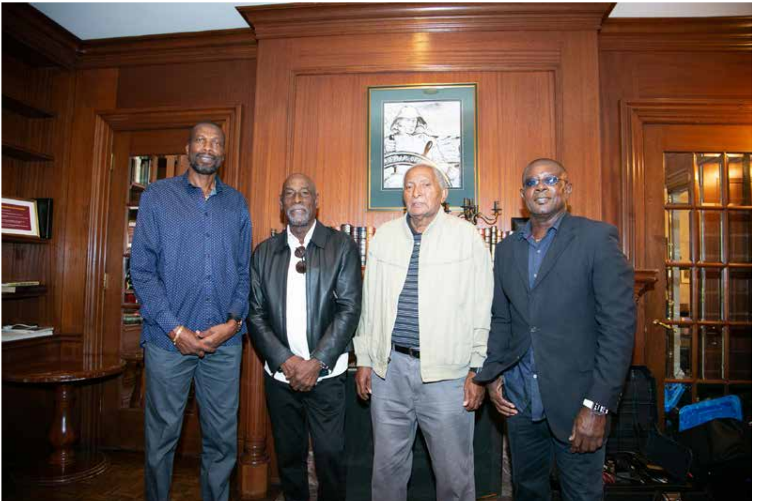
Sir Curtly Ambrose, Sir Vivian Richards, Sir Anderson Roberts and Sir Richard Richardson at Toronto's Albany Club on Saturday. They are officially heading home after a landmark series of public appearances throughout the Greater Toronto Area. Story on page 10.