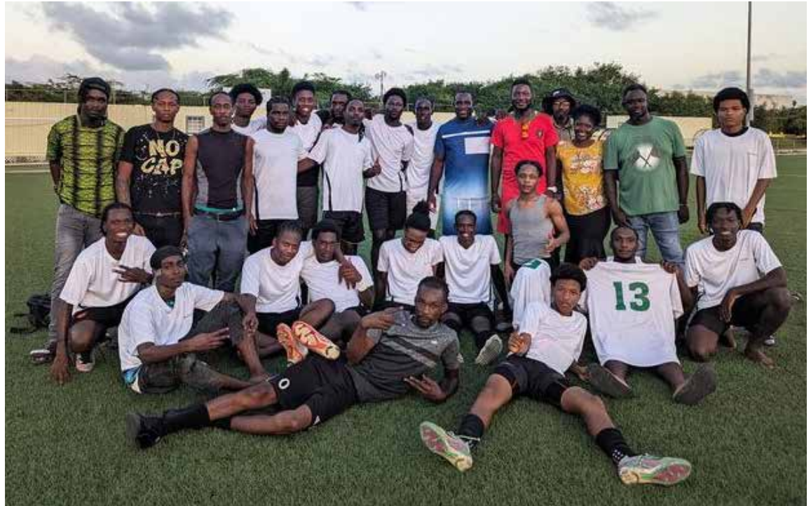
Players and supporters of the Freeman's Village Scorpions football team after beating Bethesda to win the Second Division title at the ABFA Technical Center on Monday, May 13, 2024.

Their 18th win in 21 matches carries the Freeman's Village Scorpions to an unassailable 54 points with one match remaining.