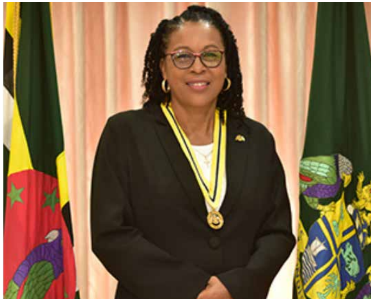
President of Dominica, Sylvanie Burton.

killed and injured in Haiti due to gang violence significantly increased in 2023 – 4,451 killed and 1,668 injured. The number of victims skyrocketed in the first three months of this year, estimated at 1,554 killed and 826 injured.