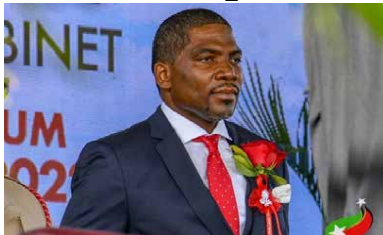
St Kitts and Nevis Prime Minister Dr. Terrance Drew

Prime Minister Drew expressed, "We anticipate that SIDS4 will allow for a necessary "coming together" of leaders and stakeholders to