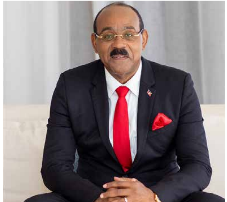
Prime Minister Gaston Browne

The prime minister observed that the benefits of the expanding economy are being felt throughout the society with more people being employed with more disposable income. He also announced that the new Roy-alton Chic hotel at Halcyon