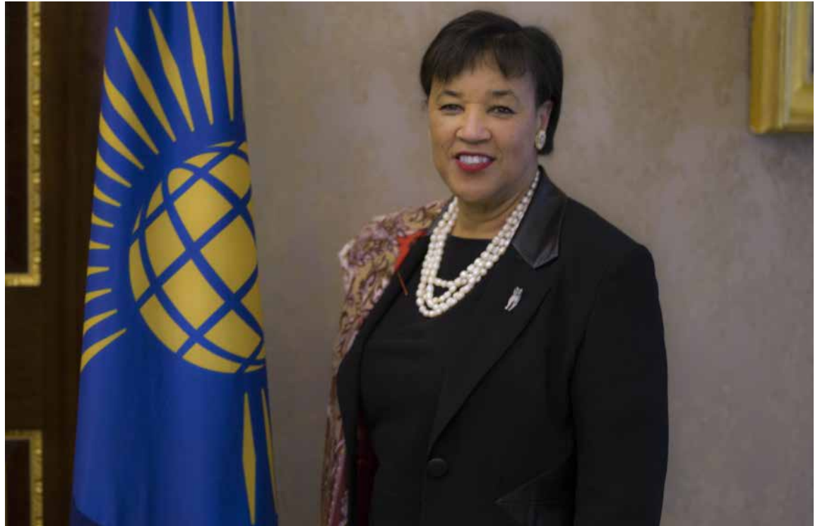
Baroness Patricia Scotland.

lic of Venezuela shall refrain from taking any action which would modify the situation that currently prevails in the territory in dispute, whereby the Co-operative Republic of Guyana administers and exercises control over that area."