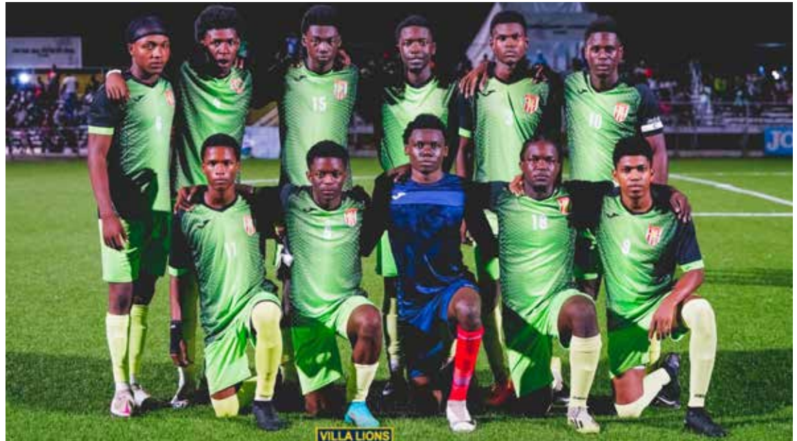
Players of the Villa Lions football team.

Pigotts Bullets advance to 20 points after winning their fifth game in 15 matches, while Swetes remain on eight points after losing for the 11th time in 15 games.