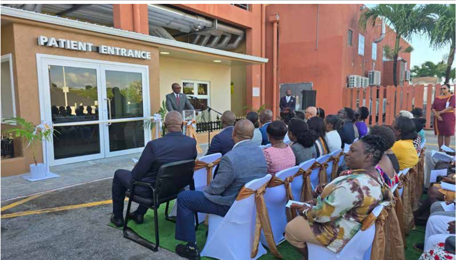
Health Minister, Sir Molwyn Joseph at the podium at the opening ceremony of the new expansion of the Emergency Room at the Sir Lester Bird Medical Centre on Sunday. Story on page 4.