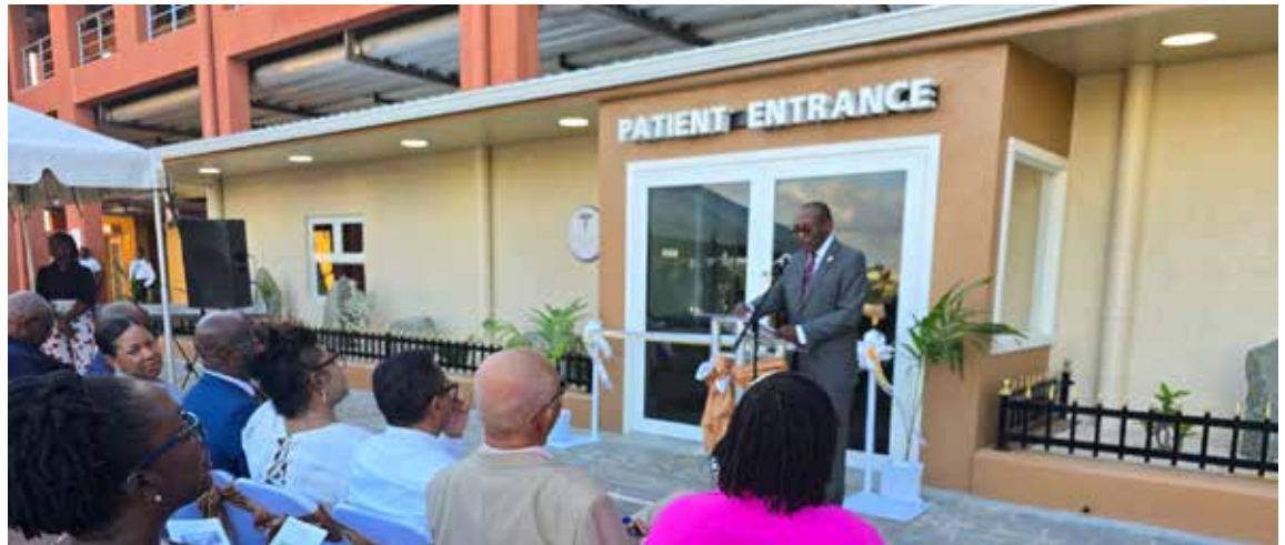
Sir Molwyn Joseph calling out workers who deliver poor service at SLBMC

The minister has been visiting the hospital daily over the past several months and he reported that he has observed first-hand, the poor service, a source of much complaints from the public about the institution. He noted that while the majority of people will speak of their experiences at the institution in