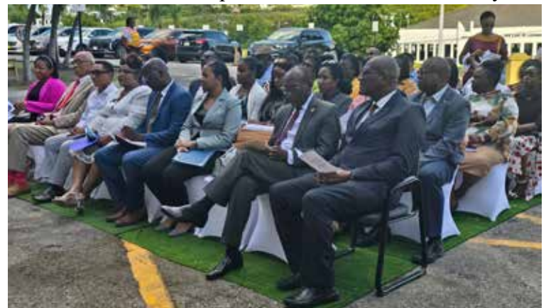
Opening of the expansion of the Emergency Room at SLBMC

The deadline for submission of an expression of interest is Monday April 22, 2024, by 3pm via email or physical copy delivered to the Office of the Governor General.