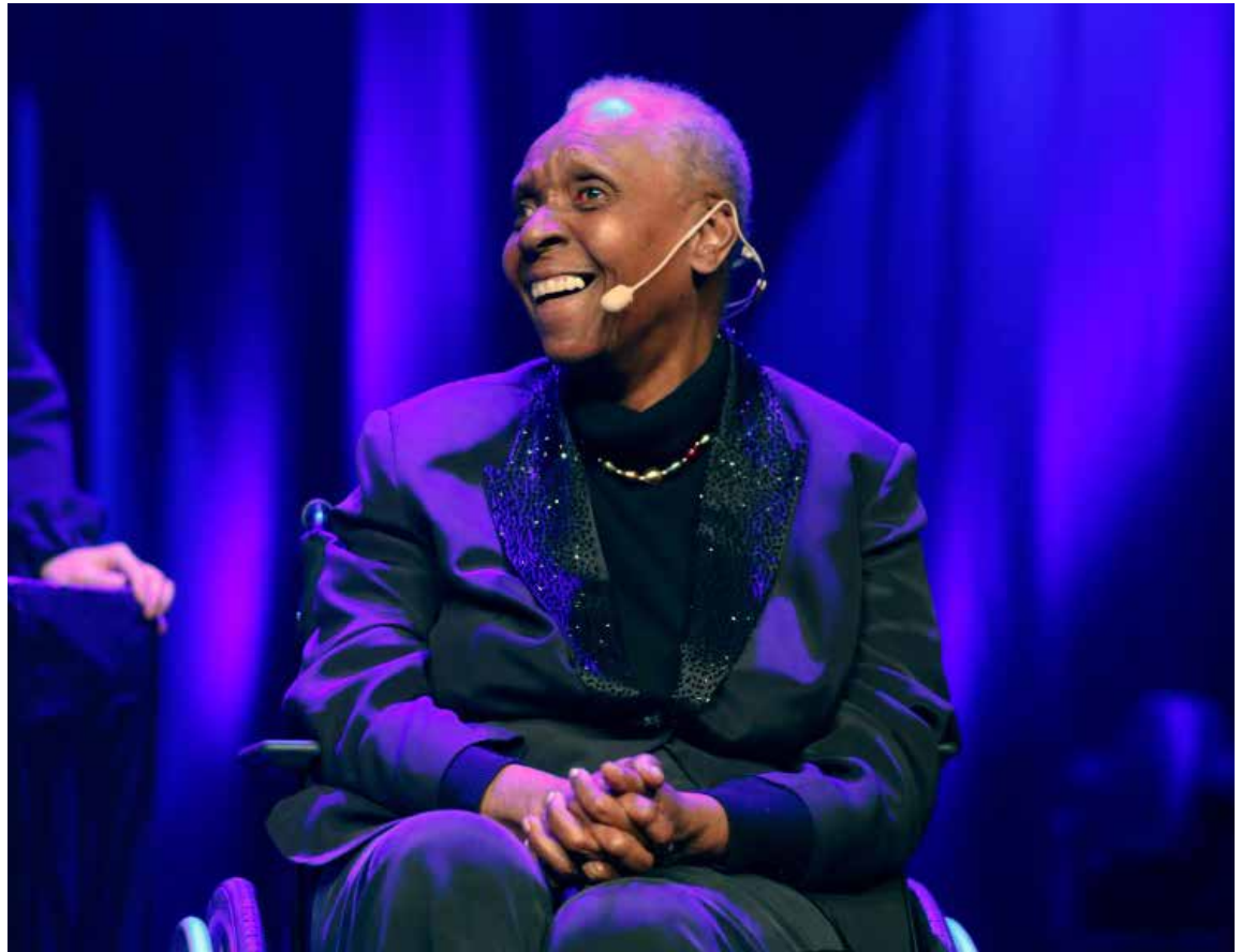
French writer Maryse Condé reacts after being awarded the New Academy's Literature Prize at a ceremony in Stockholm, Sweden, on December 9, 2018.

Condé, who lived in Luberon, France in recent years, was often called the "grande dame" of Caribbean literature. Influenced by Frantz Fanon, Aimé Césaire and other critics of colonialism, she was a world traveler who probed the conflicts between and within Western culture, African culture and Caribbean culture, and the tensions between the desire