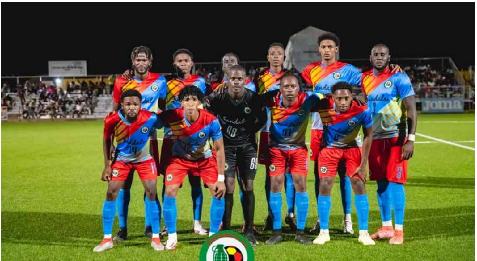
Players of the Sandals and Inet Jennings Grenades