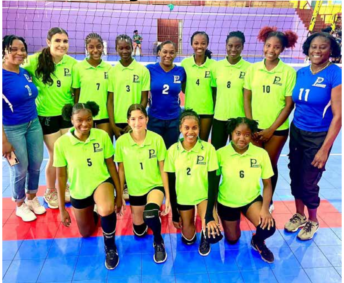
The Paragons 2 female volleyball team.

Stoneville eased their way to a 3-0 win against High Flyerz 1 in approximately one hour and 10 minutes. Stoneville won