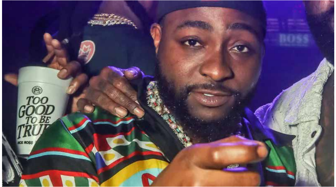
Davido recently performed to packed audiences at the Timeless Concert in Kampala and Raha Fest in Nairobi.

who had just performed to packed audiences at the Timeless Concert in Kampala and Raha Fest in Nairobi, said it led to him receiving a barrage of calls.