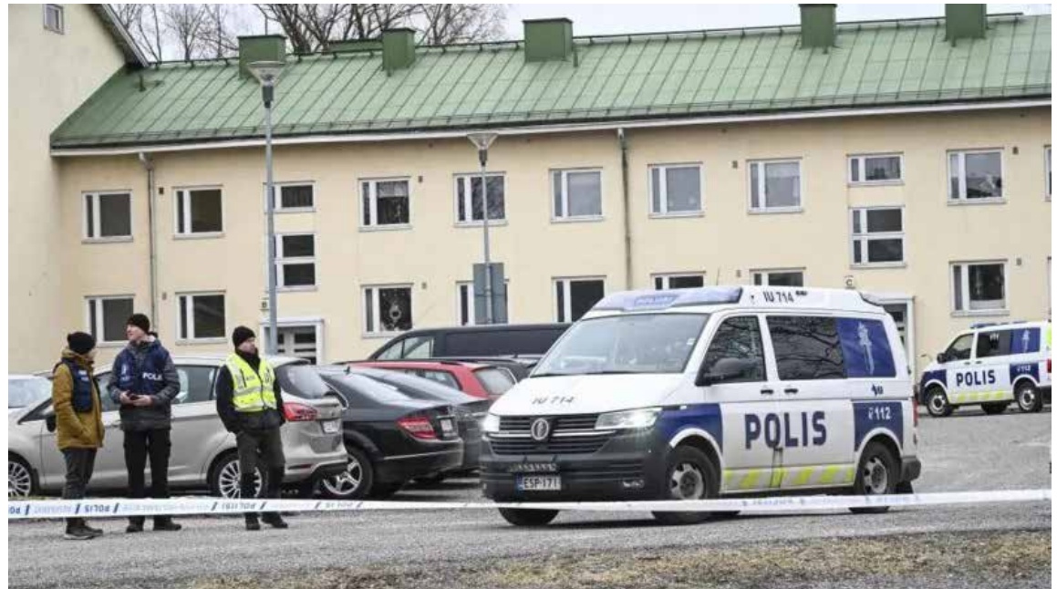
The suspect fled the school as police arrived and was eventually caught in a district of northern Helsinki.

The suspect ran off as soon as police arrived and was eventually detained “in a calm manner” in the northern Siltamaki district of Helsinki at 09:58. A video taken from a passing car shows the suspect being pinned down beside a road