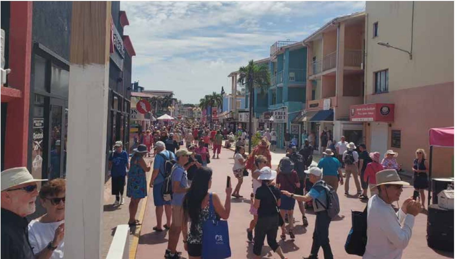
Cruise passengers converge on the Heritage Quay shopping centre.