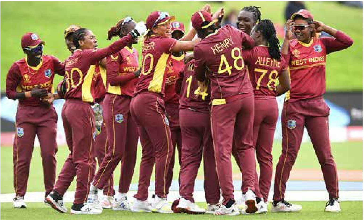
Players of the West Indies women's team. (File photo)