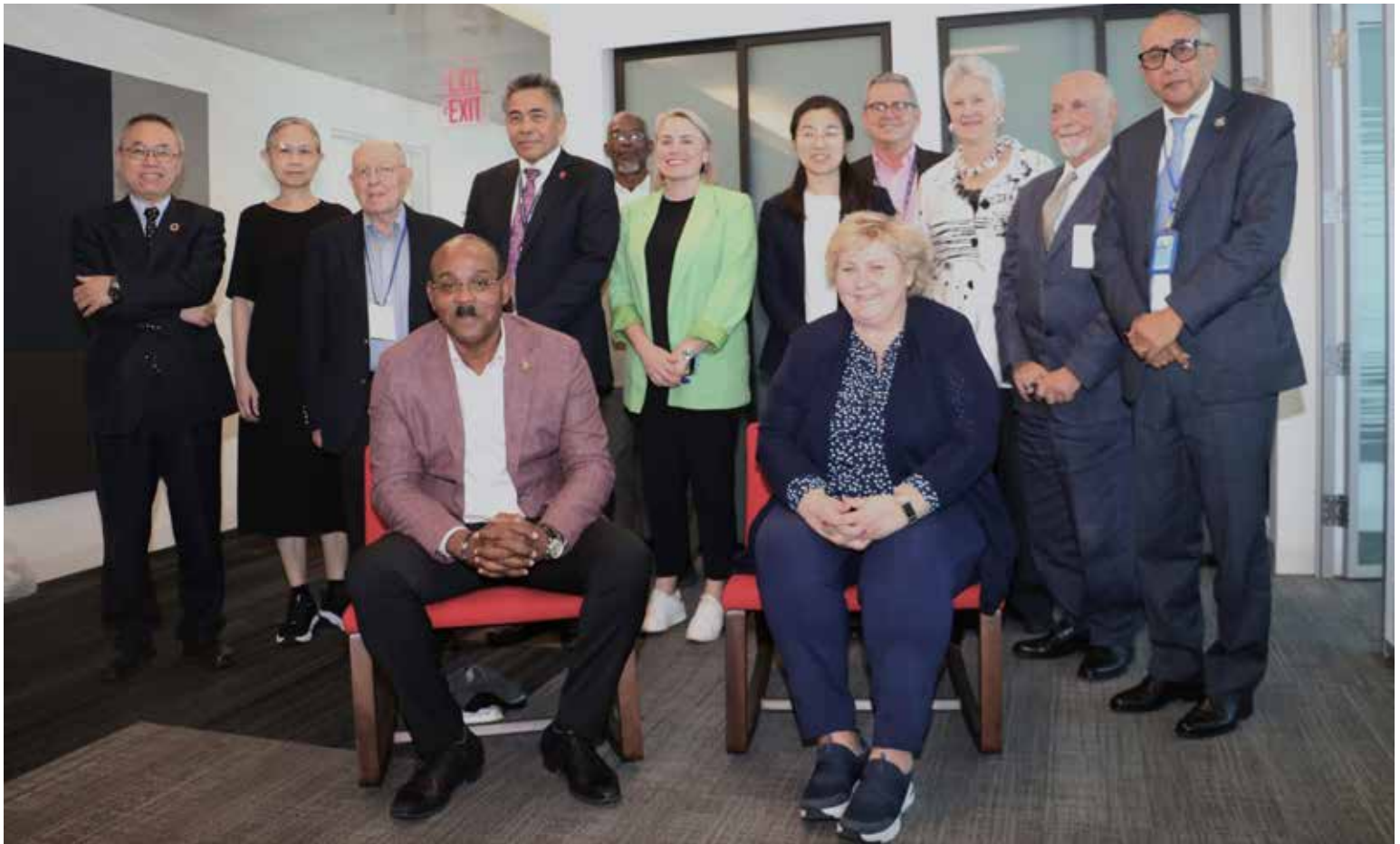
Prime Minister Gaston Browne, Former PM of Norway Erna Solberg and members of the High Level Panel.