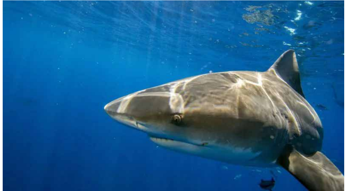
Bull sharks are most often found in shallow waters along tropical coastlines (file image).