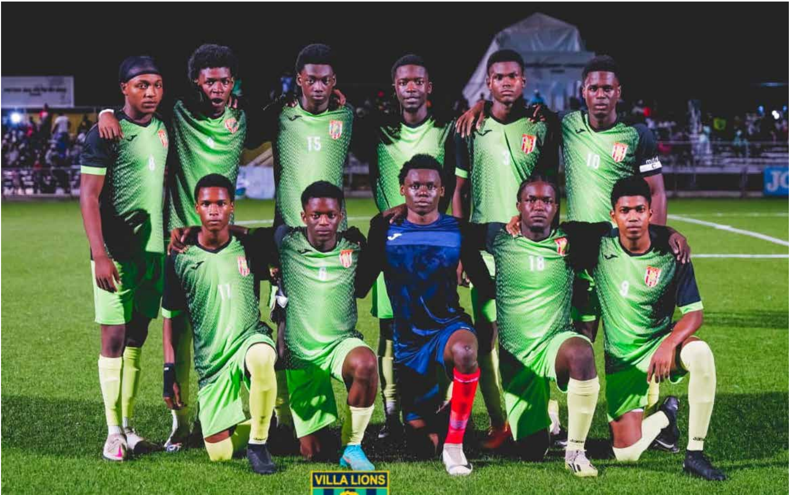
Players of the Villa Lions team. (File photo)