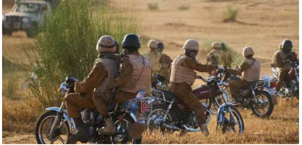
A military convoy with over 100 soldiers descended on the villages, survivors said (file photo).

groups before opening fire on them," the report added, citing witness and survivor accounts.