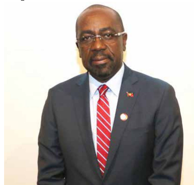
Agricultural Minister, E.P Chet Greene

As part of its plans, Greene said the government wants to encourage all farmers to register in order for them to access the package of incentives specially tai-