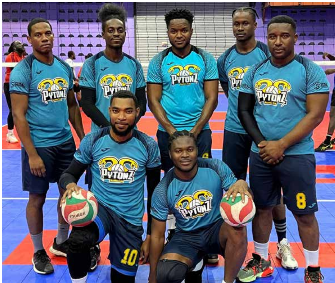
The Pytonz men's volleyball team

Stoneville took an hour and 11 minutes to wrap up their 25-18, 25-16, and 25-22 victory against the