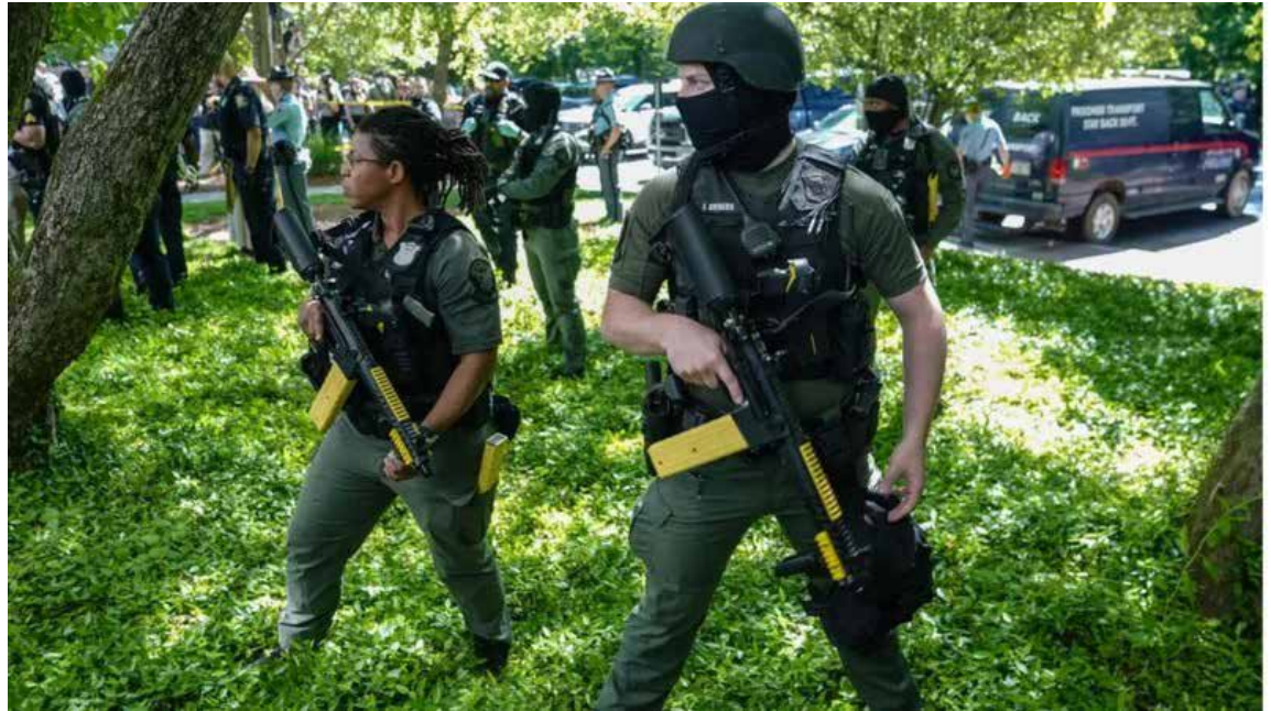
Atlanta police used chemicals to disperse the protesters but deny reports that they fired rubber bullets.

Atlanta Police said that they used chemical irritants but denied reports that they fired rubber bullets against