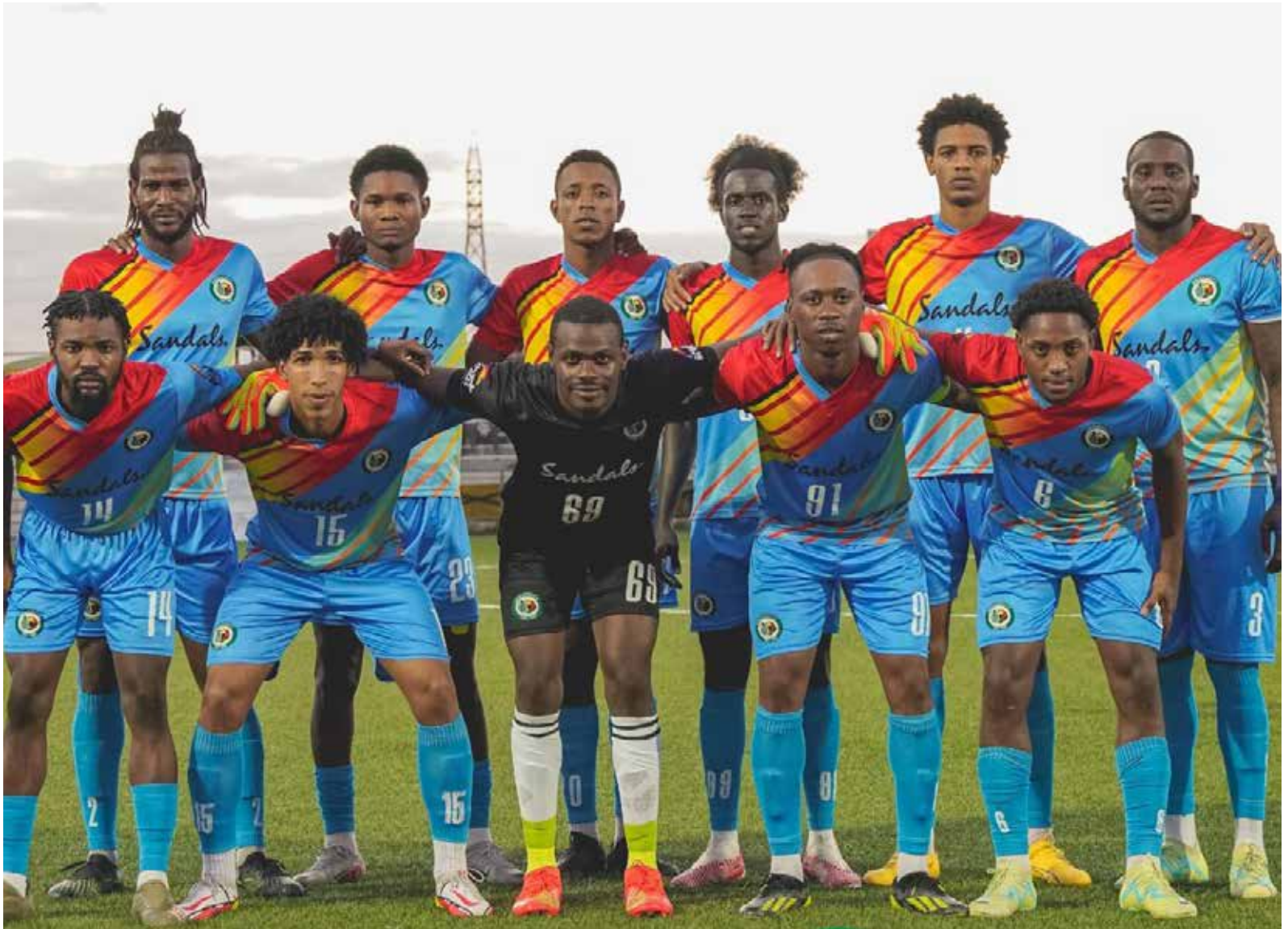
Players of the Jennings Grenades football team. The Grenades will retain their Premier Division League title with a victory against the Villa Lions in their penultimate match of the season on Saturday.

Ottos Rangers and Willikies Warriors fought to a 1-1 draw in a rescheduled second round encounter in the Antigua and Barbuda Football Association's (ABFA) Premier Division League on Wednesday.