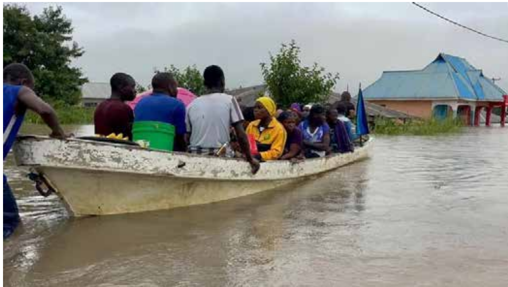
Many thousands have had to leave their homes, such as these people in the Coastal region earlier this month.

has ordered the army to help with rescue operations, as heavy rains pounded large parts of the country, including the capital, Nairobi, where homes in some slum areas have been swept away, along with furniture and other goods.