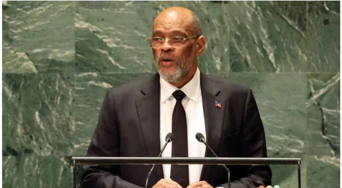
Haitian Prime Minister Ariel Henry, officially resigned from his role on Thursday.

They have capitalised on the power vacuum left by the prime minister's exit and expanded their control