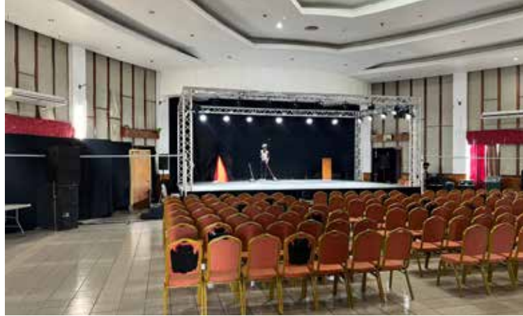
The interior of the Performing hall of the Multi-Purpose Cultural Centre has been transformed for the National Secondary Schools Theatre Festival.

The venue for the festival is the Multi-Purpose Cultural Centre where the interior has been trans-