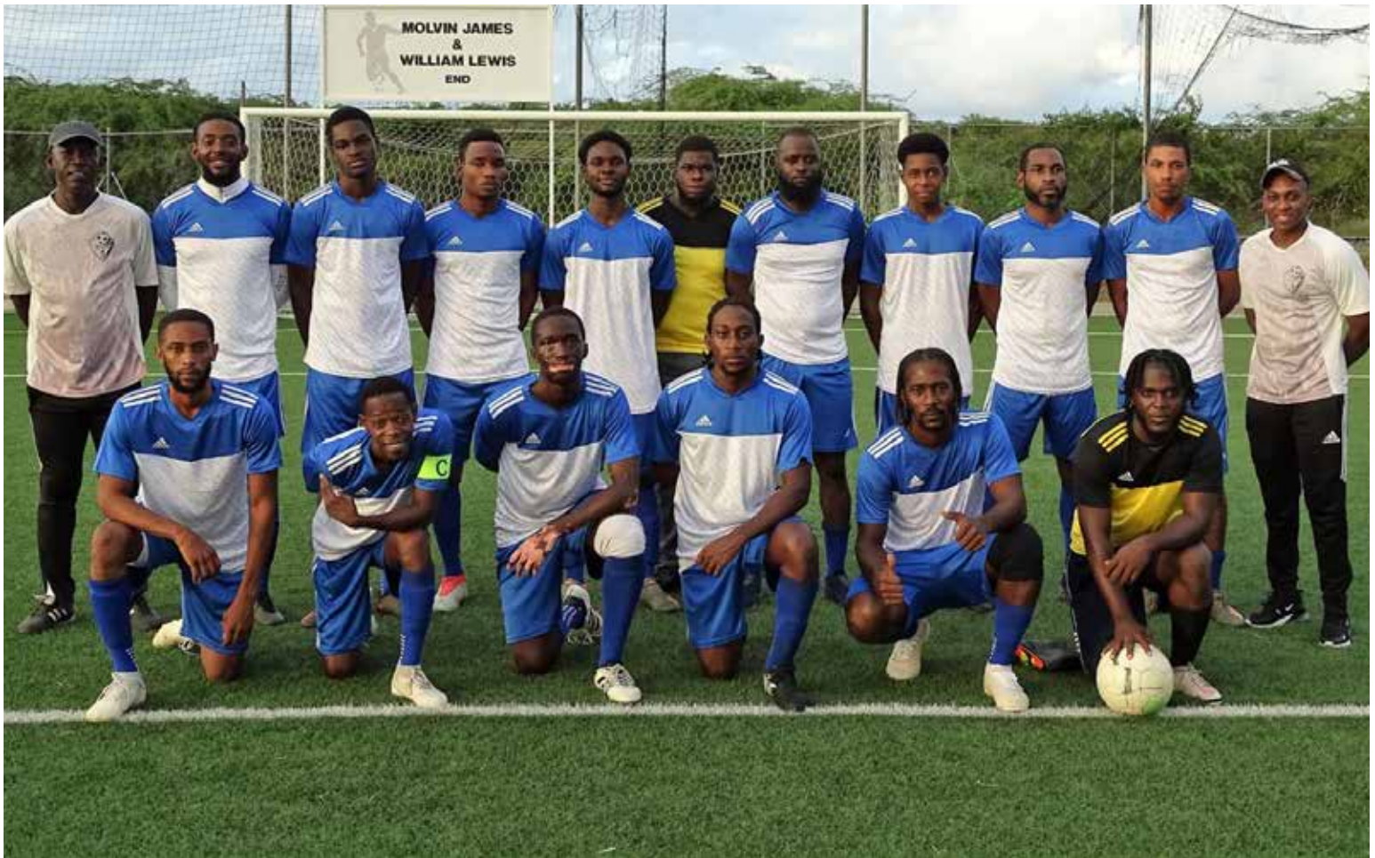
Players of the Sea View Farm football team