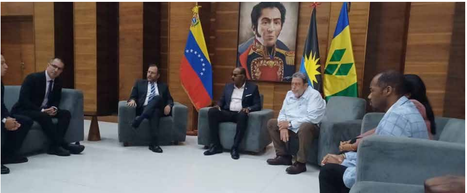
PM Gaston Browne joined other ALBA heads at a meeting in Caracas