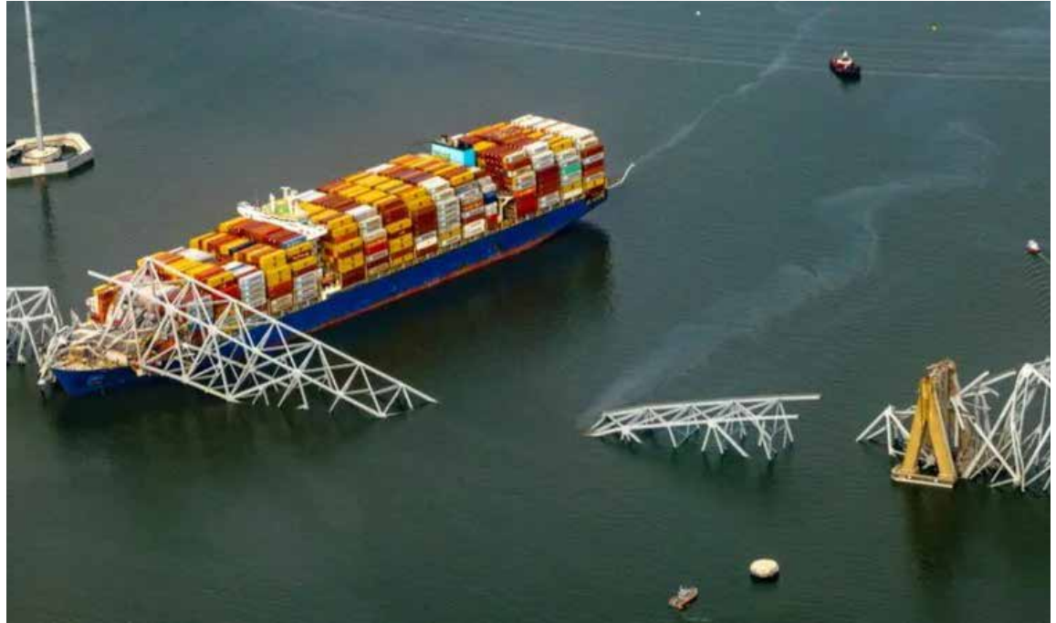
The Dali was a 'clearly unseaworthy' ship with 'an incompetent crew', the city of Baltimore argued in a lawsuit filed Monday.

maritime law, the pair of companies estimated their liability for the vessel and the cargo's value at $43.6m (£35m).