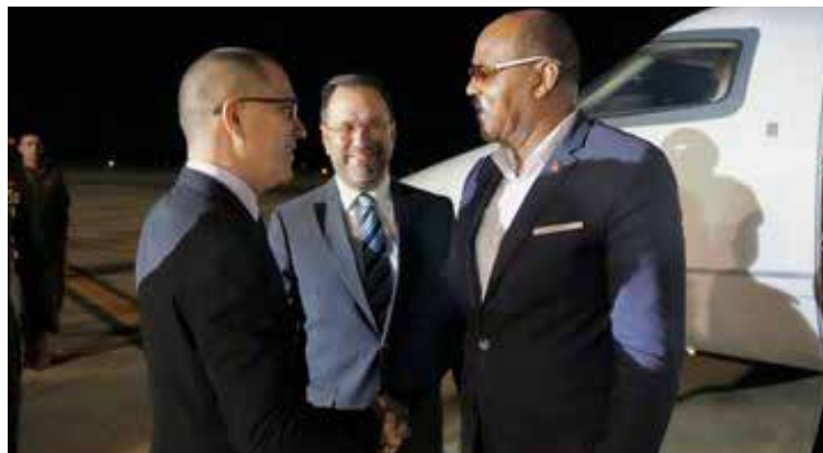
PM Browne arrives in Venezuela

da leader as well as his counterparts from the sub-region were greeted at the airport with a special welcome on