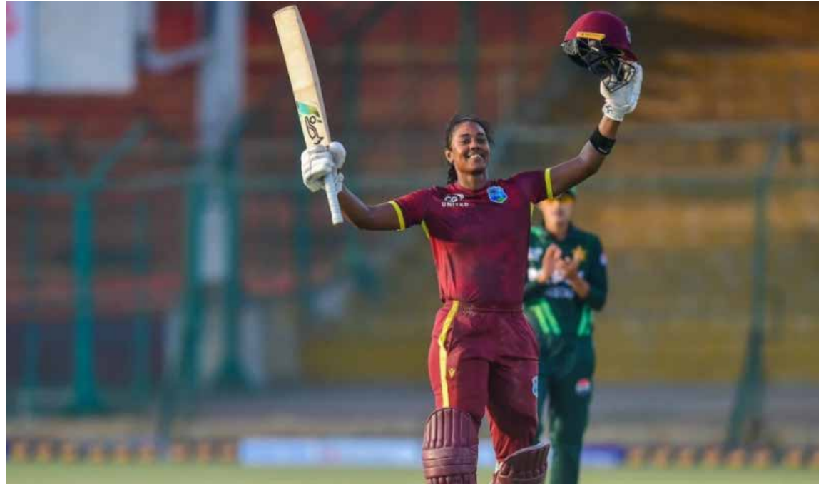
West Indies Women captain Hayley Matthews celebrates after reaching her century during the third One-Day International against Pakistan in Karachi on Tuesday, April 23, 2024.

Matthews' knock means she ends the three-match series with an impressive 325 runs. Nashra Sandhu took three for 54 to lead the bowling for the hosts, while Fatima Sana took two for 67 in support.