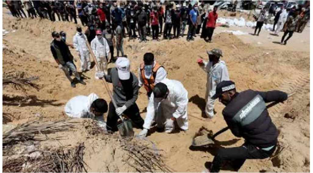
Palestinian workers are exhuming bodies at Nasser hospital with shovels because they have no heavy machinery.

The war began when Hamas gunmen carried out an unprecedented cross-border attack on southern Israel on 7 October, killing about 1,200 people - mostly civilians - and taking 253