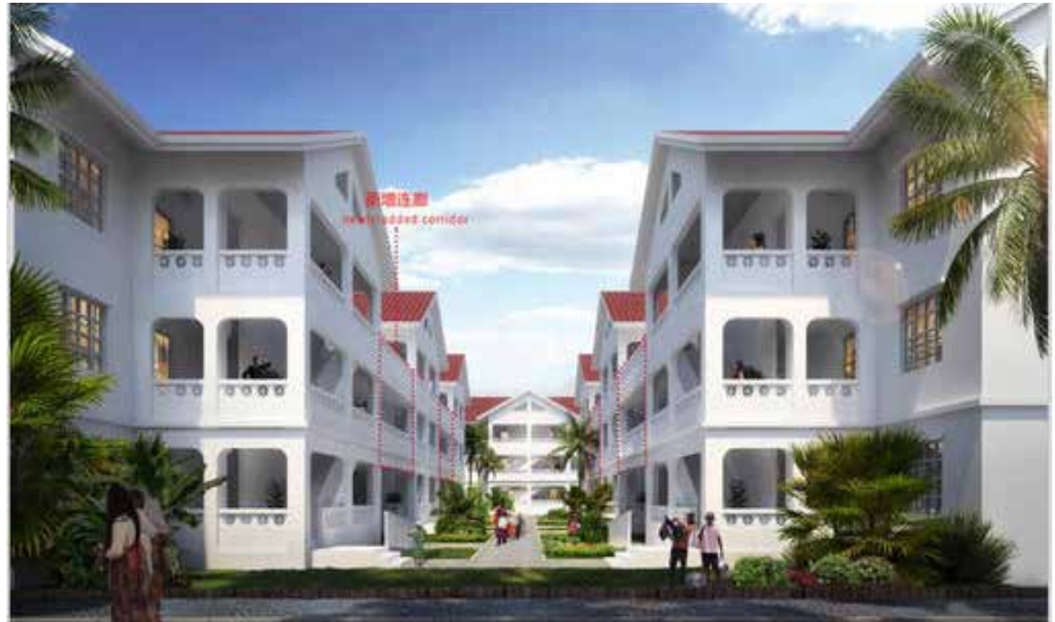
Artist rendition of the housing development planned for Booby Alley

The start of the project was initially delayed by the COVID-19 pandemic, but was further delayed due to issues where some residents had refused to be relocated to enable the demolition or removal of