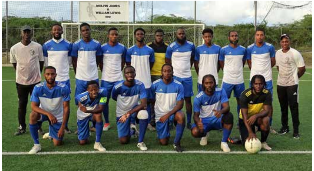
Players of the Sea View Farm football team. (File photo)

Soccer Academy moved into fifth place after winning by default against the bottom team, the JSC Progressors, who failed to show up for their encounter at the ABFA Technical Center.