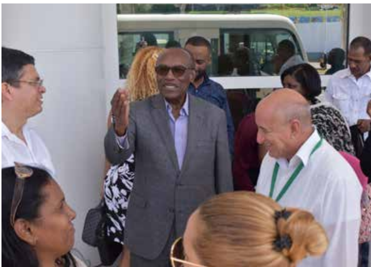
Sir Molwyn leads welcoming party at the airport