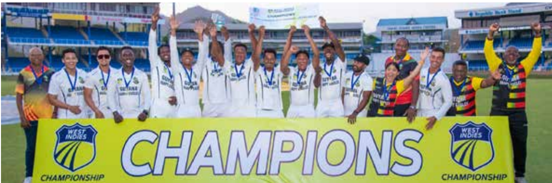
The Guyana Harpy Eagles captured the 2024 Cricket West Indies Four-Day Championship in Trinidad on Saturday, April 20, 2024.