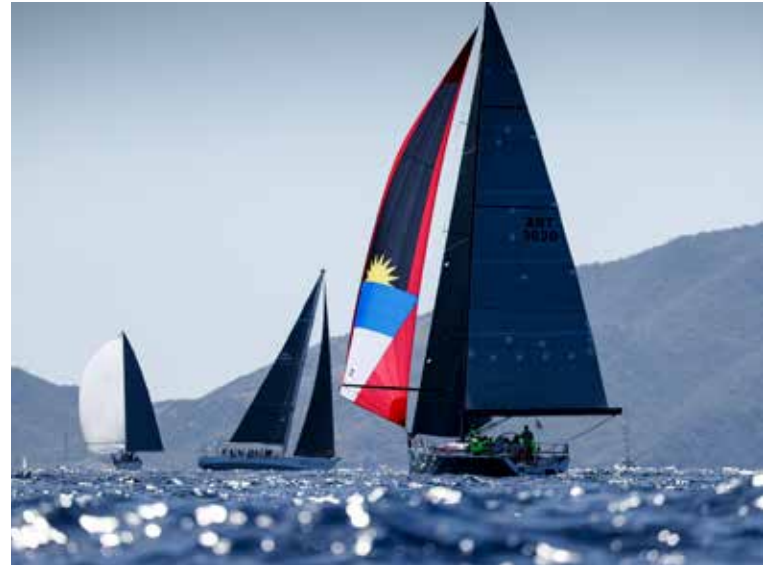
Antigua Sailing Week starts on Saturday 27 April

There are some fancy dress-up theme nights planned as well - Pirate