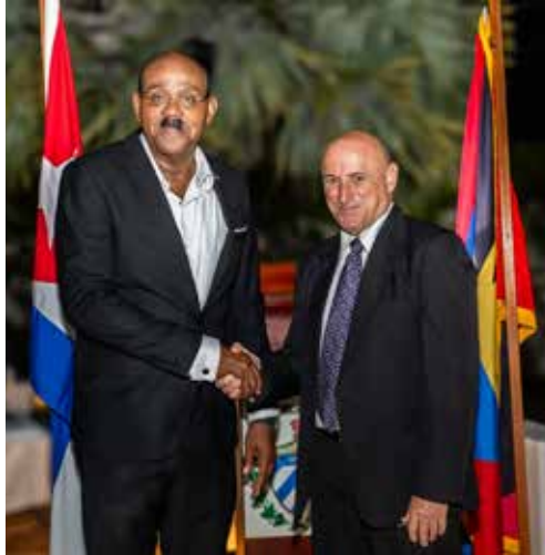
Prime Minister Gaston Browne, left, shakes hands with Cuban Ambassador, Sergio Manuel Matinez Gonzalez ban generosity because they continue to give from the little that they have,” he remarked.

“Cuba has been quite benevolent and it is a country that has done a significant amount of global good for a number of countries despite its own problems, despite its own limited resources, and we are always very supportive and very appreciative of Cu-