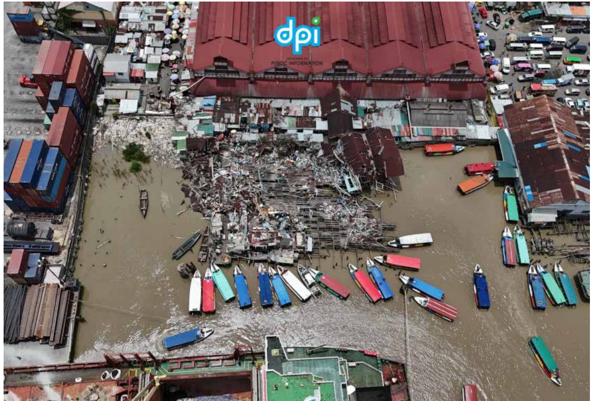
An aerial view of the collapsed section of the Stabroek Market.

Meanwhile, Minister of Local Government and Regional Development, Sonia Parag, said the roof collapse came as no surprise her as