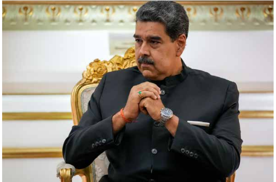
Venezuelan President Nicolás Maduro attends a meeting at Miraflores presidential palace in Caracas, Venezuela, February 20, 2024.

While Maduro went on to schedule an election for July and invite international observers to monitor voting, his inner circle has used the ruling party's total control over Venezuela's institutions to undermine the agreement. Actions include blocking his main rival, ex lawmaker Maria Corina Machado, from registering her candidacy or that of a designated alternative. Numerous gov-