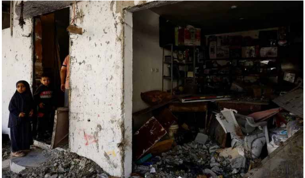
Israeli air strikes were reported across the Gaza Strip on Wednesday, including in the southern town of Rafah.

Meanwhile, the Israeli military said 14 Israeli soldiers had been injured, six of them severely, by anti-tank