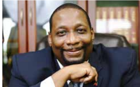
Ambassador Clarence E Pilgrim

The current UNSC structure reflects the power dynamics of a post-World War II world, with five permanent members wielding veto power: the United States, China, Russia, France, and the United Kingdom. While these nations undoubtedly played pivotal roles in shaping the global order of the 20th century, the geopolitical landscape has evolved dramatically since then. Emerging economies such as Brazil, India, South Africa, and others now command significant influence on the world stage, yet find them-