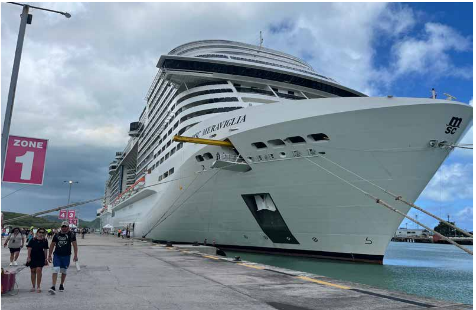
A late season inaugural call by Meraviglia of MSC Cruises brought over forty-two hundred passengers to Antigua on Sunday. Story on page 4.