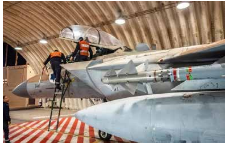
Israeli and US aircraft and air defence systems shot down 99% of the drones launched by Iran.

Both Mr Kirby and the official said that the US would continue to defend