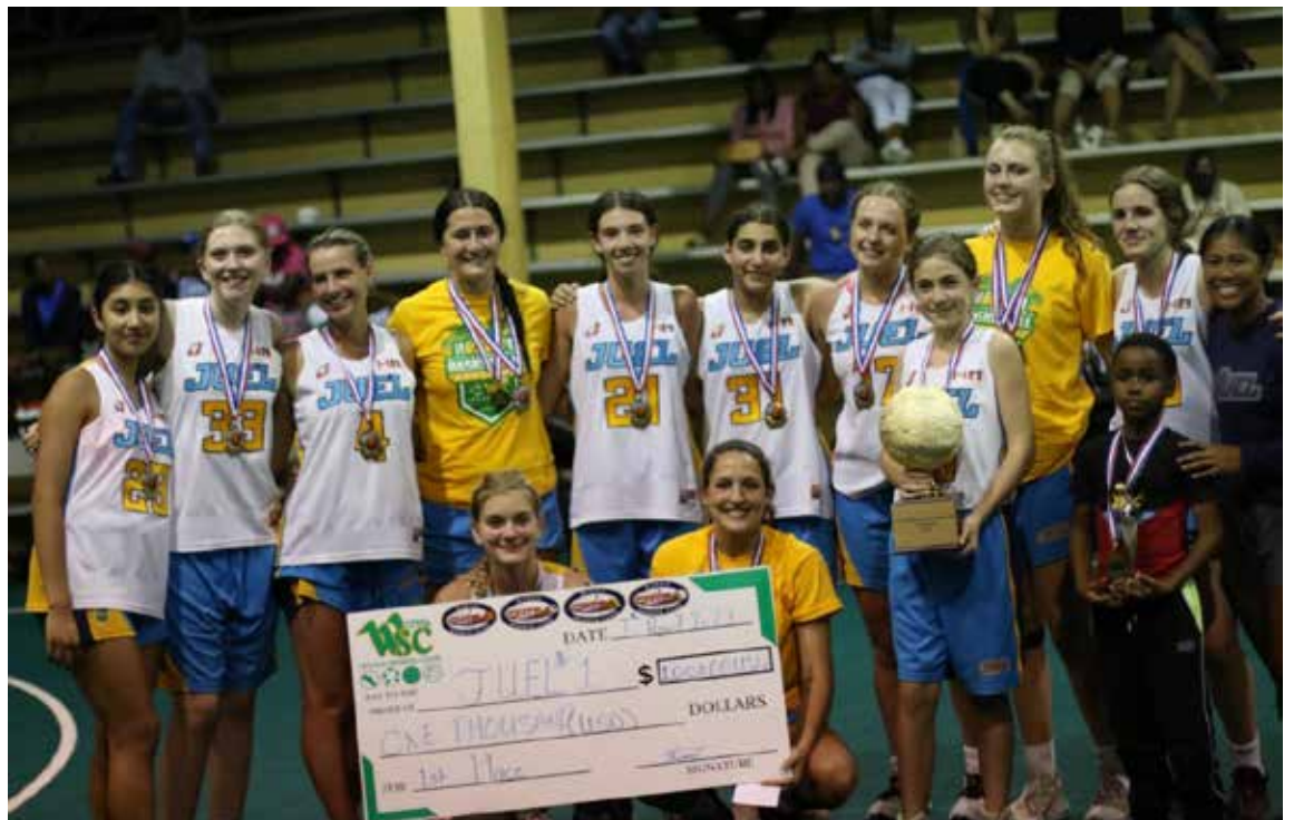
Players of Juel 1 of Canada are all smiles after capturing the title of the 17th Gillian Brazier Basketball Shoot-Out in 2023. (File photo)

The event will commence with an opening ceremony at the JSC Sports