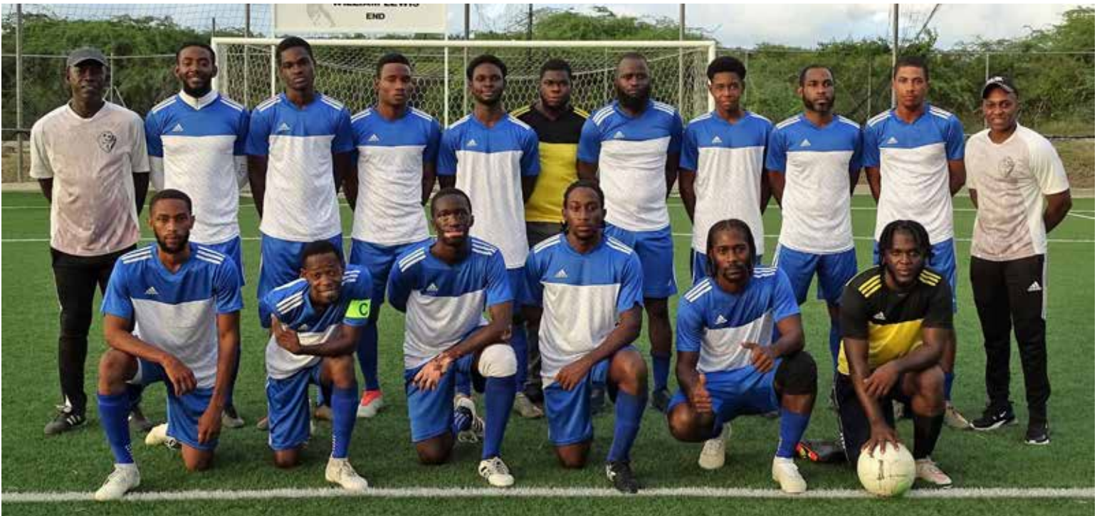
Players of the Sea View Farm football team. (File photo)