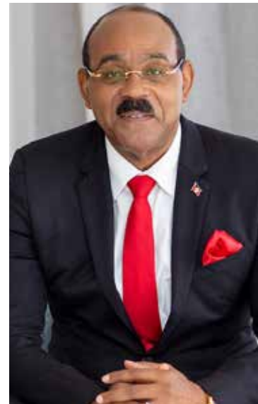
Prime Minister Gaston Browne

Sir Gerald cautions the opposition bench to limit their questions to the areas over which the prime minister has direct responsibility such as the general operations of the government and its departments.