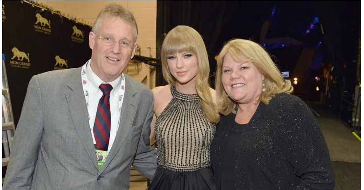
Taylor Swift with her parents in 2013.

A video published by Australian media shows the singer, who is concealed be-