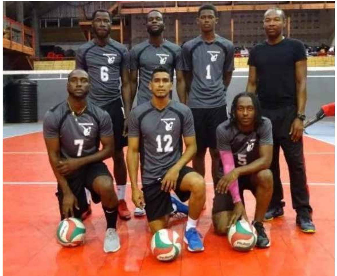
Stoneville men's volleyball team. (ABAVA)

All Saints Secondary School captured fourth place. All Saints Secondary defeated Ottos Comprehensive School 2-1 in the playoff for fourth place,