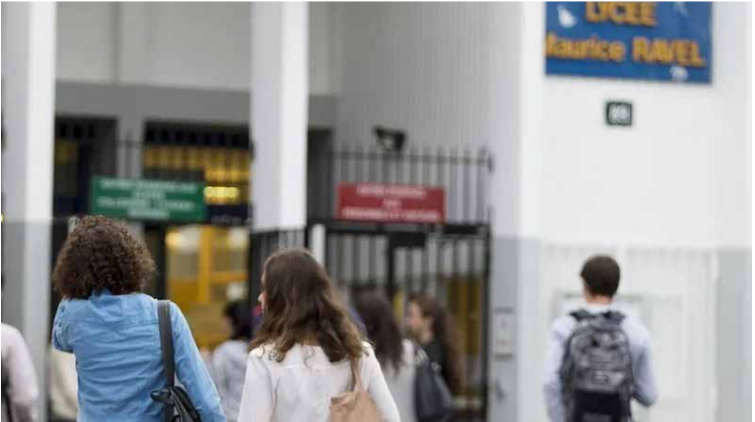
The headteacher of the Maurice Ravel Lycée thanked his colleagues for their support (file pic of school).