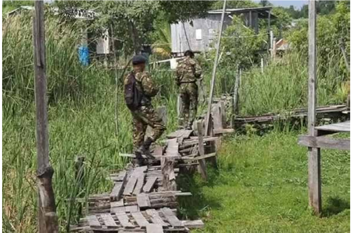
State of Emergency declared in certain parts of Belize.

tions. They are given employment opportunity. So the truth is that the government and the police are trying but again, we all know that there are going to be those persons who will not want to live a peaceful life and may continue to live that violent lifestyle.