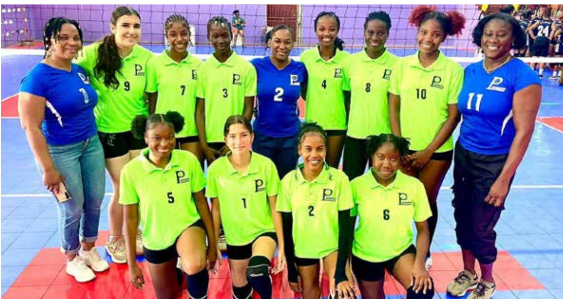
The Paragons 2 female volleyball team. (ABAVA)

The High Flyers 1 soared to victory with scores of 25-16, 25-16, and 25-17 in approximately one hour and seven minutes as the Invaders fell to defeat for the third time in as many games.