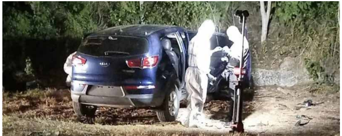
Forensic experts were on the scene.

been elected mayor of San Vicente for the opposition Citizens' Revolution party last year at the age of 26.