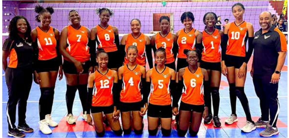
TOA Media and MKUU Tours Chargers Eagles.

The Paragons 2 launched their Division 2 campaign with a 3-0 win against Starz 2 Juniors, winning 25-11, 25-17, and 25-22 in the encounter, which lasted approximately one hour and 45 minutes.