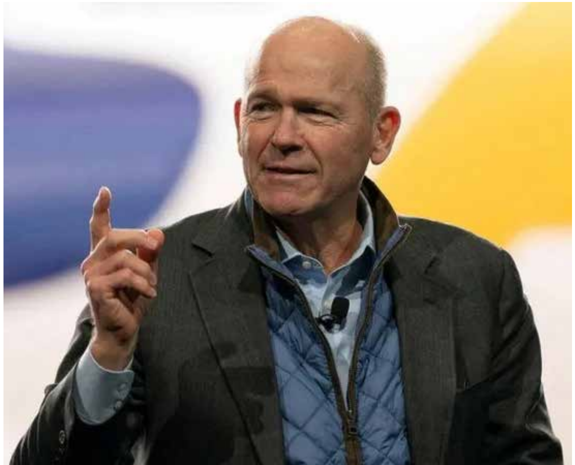
Boeing chief executive Dave Calhoun.

Mr Calhoun took on the chief executive role in early 2020 after the previous