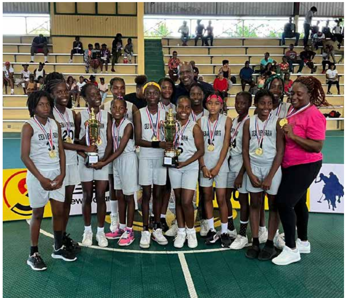
Sea View Farm Primary pose with their trophies after capturing the league and playoff titles in the Minigirls Primary Division.