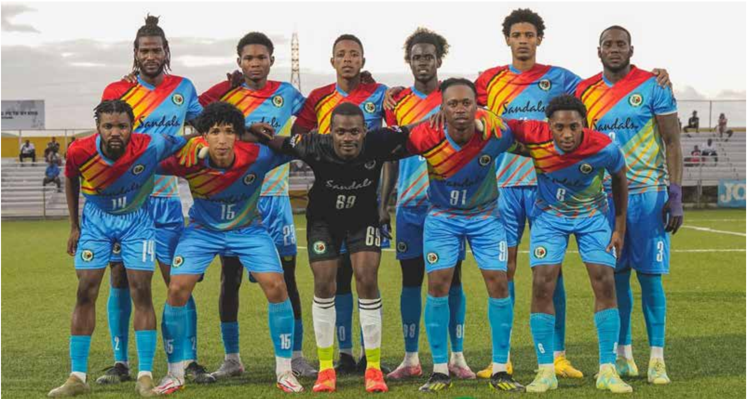
Players of the Sandals and Inet Jennings Grenades football team.