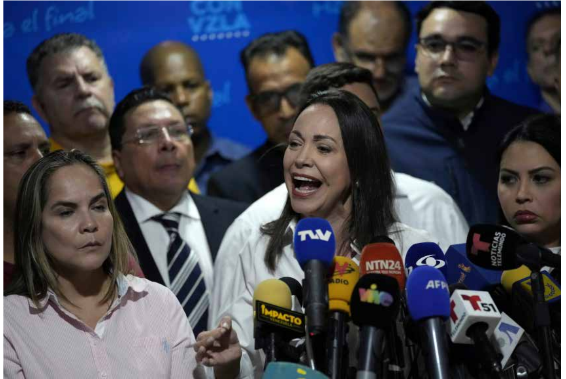
Opposition leader María Corina Machado speaks during a press conference regarding the arrest order for her campaign manager and eight other opposition members for alleged involvement in a conspiracy plot to destabilise the government, in Caracas, Venezuela, Wednesday, March 20, 2024.