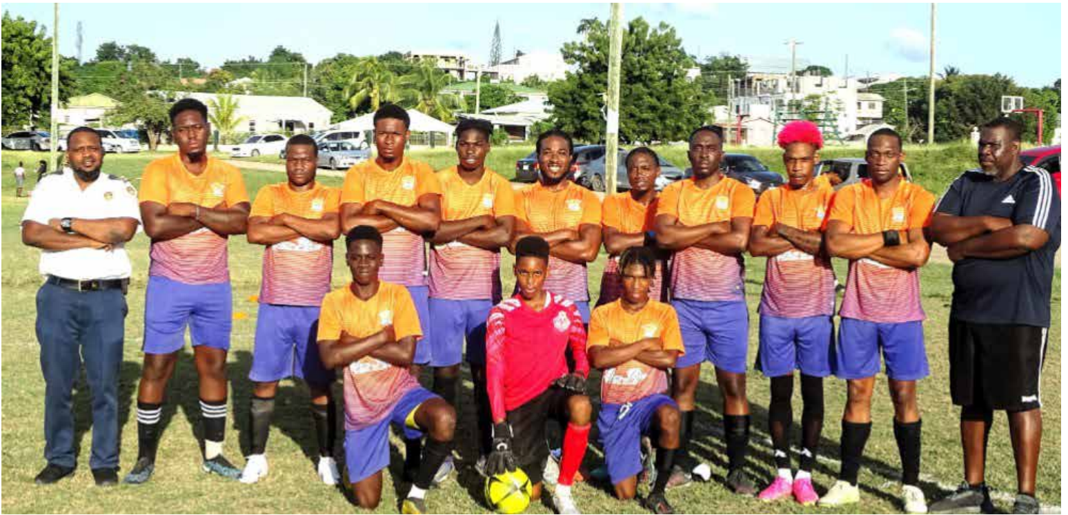
The FC Master Ballerz football team. (File photo)