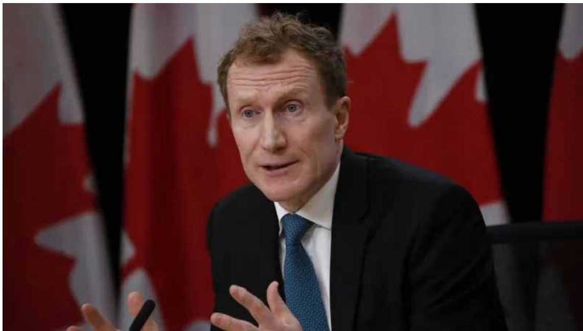
Canada's immigration minister Marc Miller.

In recent years, Mr Miller said Canada has seen a