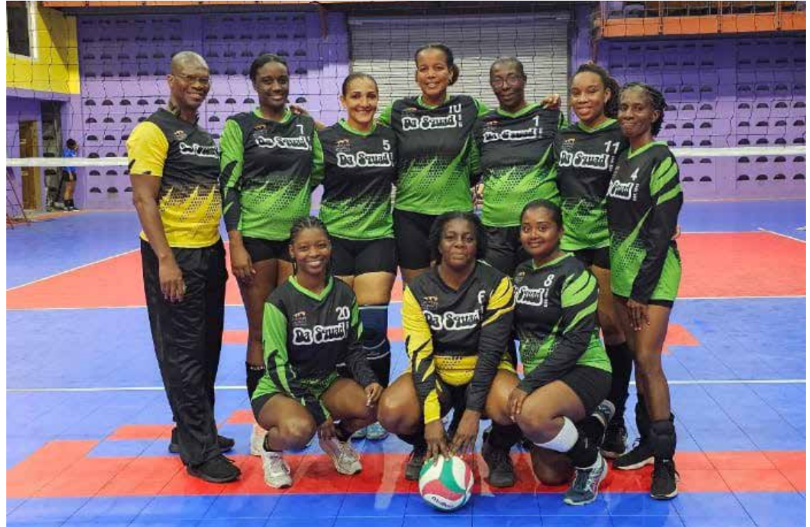
Reigning back-to-back champions, Caribbean Alliance Insurance (CAI) Da Squad day.

The Renegades made a winning start to their campaign in the men's Division 1 competition. The Renegades cruised to a 3-0 win against High Flyerz 2 in the second game on Wednesday.