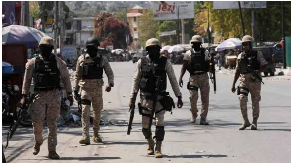
Police patrol a street in Port-au-Prince.