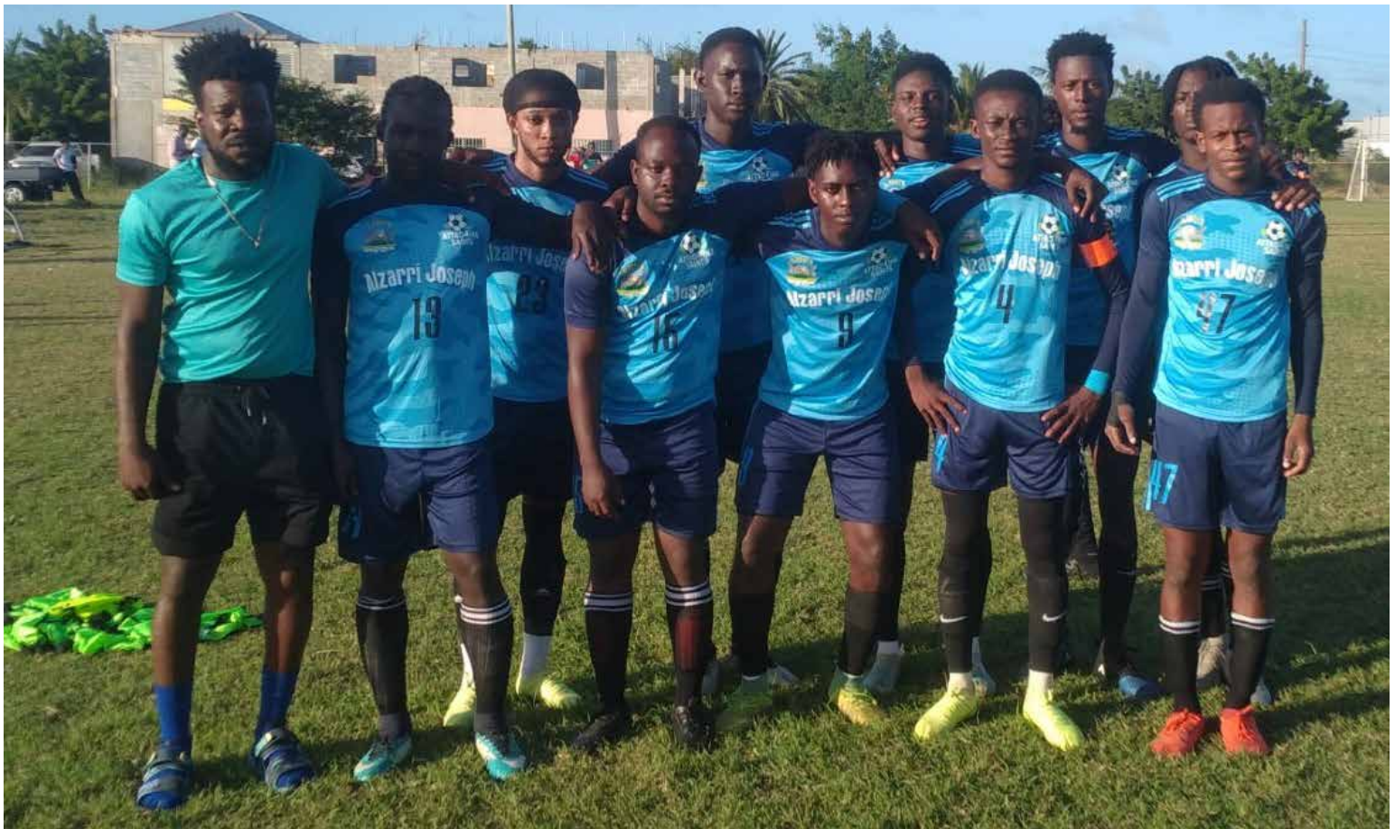
Players of the Attacking Saints football team. (File photo)