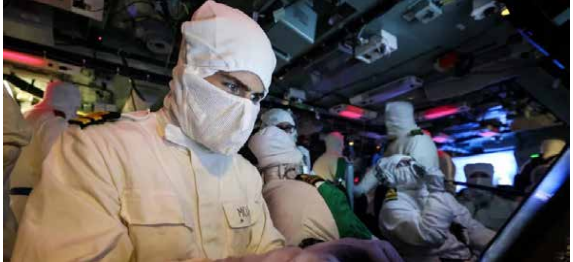
The Royal Navy frigate downed two drones launched by the Houthis in the latest incident in the Red Sea.

Since November, the Houthis have been attacking ships in the Red Sea and Gulf of Aden in what they say is a campaign of solidarity with Palestinians during Israel’s war in Gaza.