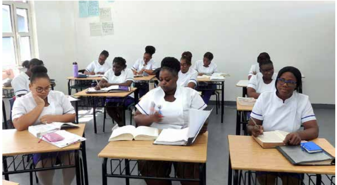
Students attending class at the School of Midwifery at its new home, UWI FIC

Eleven nurses from various healthcare sectors, including the Sir Lester Bird Medical Centre, Fiennes Institute, Clarevue Psychiatric Hospital, and Community Nursing Services, are currently enrolled in the pro-