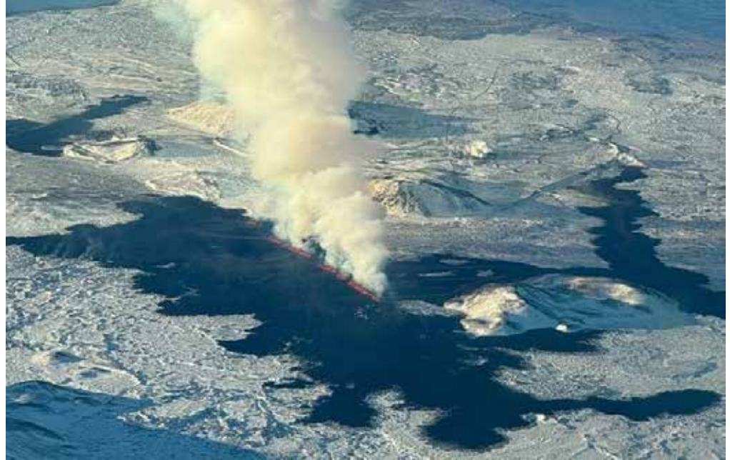
Smoke from the eruption could be seen from the capital, Reykjavik.

Volcanologist Dr Evgenia Ilyinskaya told the BBC that while the Svartsengi power station itself is protected to some extent by barriers that have been built around it, there are pipes providing hot water to a further 30,000 people across the peninsula