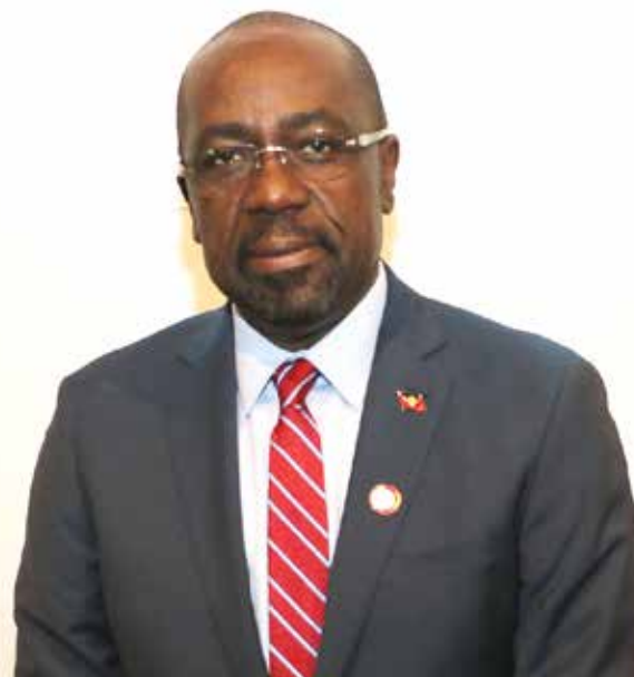
Foreign Affairs Minister, E.P Chet Greene

Both countries have enjoyed strong fraternal relations as they share a common heritage and history.