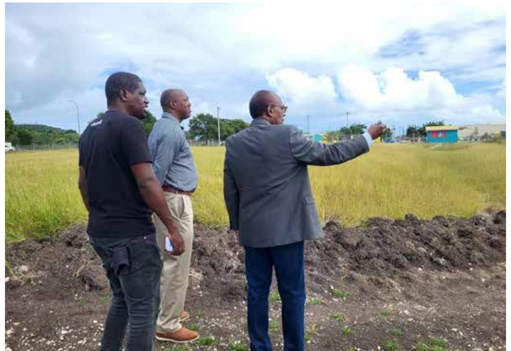
Road construction at the new Tomlinson's Cemetery

Ministries of Works and Health combined efforts to complete the new cemetery. traffic can traverse the area without 'any inconvenience'. On the issue of the cremato Sir Molwyn said this remains ar