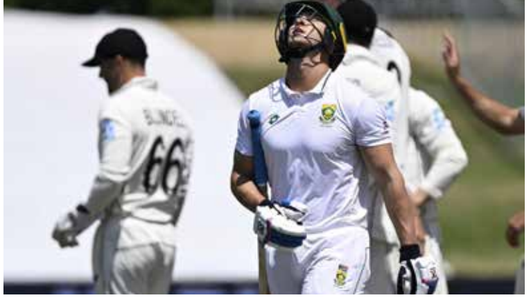
South Africa's Raynard van Tonder reacts after he was dismissed on day four of the first cricket Test between New Zealand and South Africa at Bay Oval, Mt Maunganui, New Zealand, Wednesday, Feb. 7, 2024.

They never looked like getting close to it, but showed some resistance before seamer Kyle Jamieson, who finished with four for 58, made key breakthroughs, and spinner Mitchell Santner, with three for 59, mopped up the tail to bowl out the South Africans cont'd on pg 19