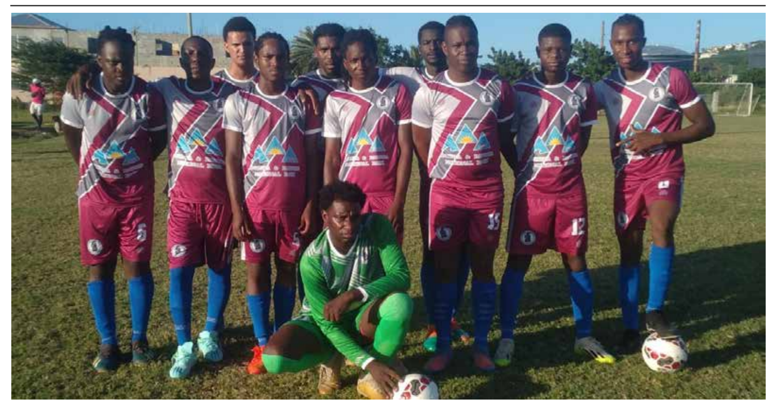
Players of the English Harbour football team. (File photo)