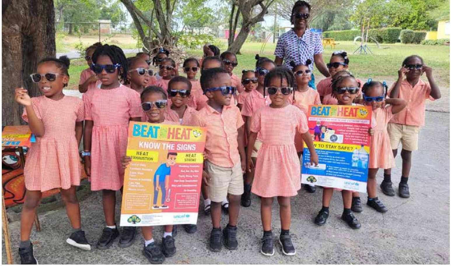
Students proudly show the posters as well as wear their sunshades

essential items that can help These items include refillchildren cope with the heat. cont'd on pg 7