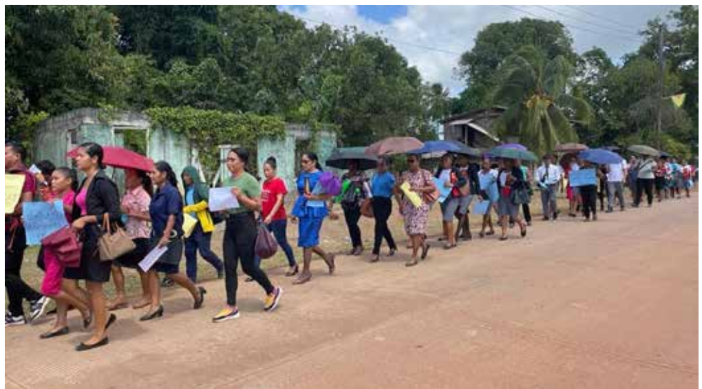
Teachers in Guyana participate in nationwide industrial action.

In its statement, the Ministry of Education said it was "appalled at the illegal locking of schools by head teachers and the barring of students