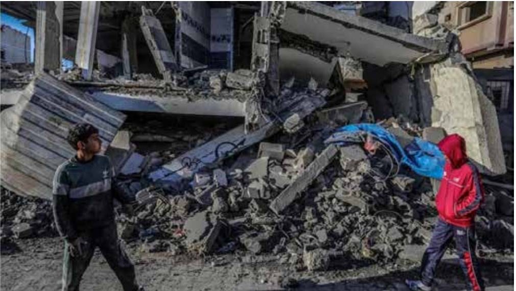
Aid agencies say the situation in Gaza is catastrophic and are among those calling for a new ceasefire.

Qatari Prime Minister Sheikh Mohammed Bin Abdulrahman al Thani