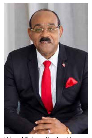
Prime Minister Gaston Browne al, there shall be no law-

"Let me speak on the issue of the law and lawlessness; one thing I can assure Devon Warner et emphasized.