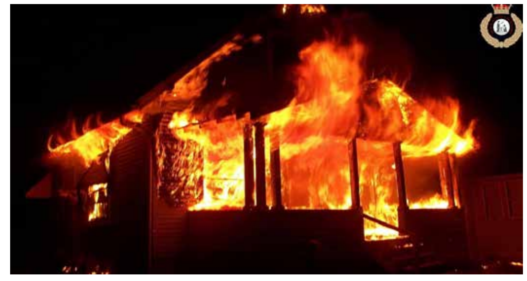
Scene of fire in Questelles, St Vincent on February 3, 2024. (Photo credit: Royal St Vincent and the Grenadines Police Force). and attempted to use buckets of water to put out the blaze but were unsuccessful. Officers from the Questelles Police Station responded and assisted in trying to extinguish the fire.

The Fire Department later arrived on the scene and extinguished the blaze. Both families have been relocated.