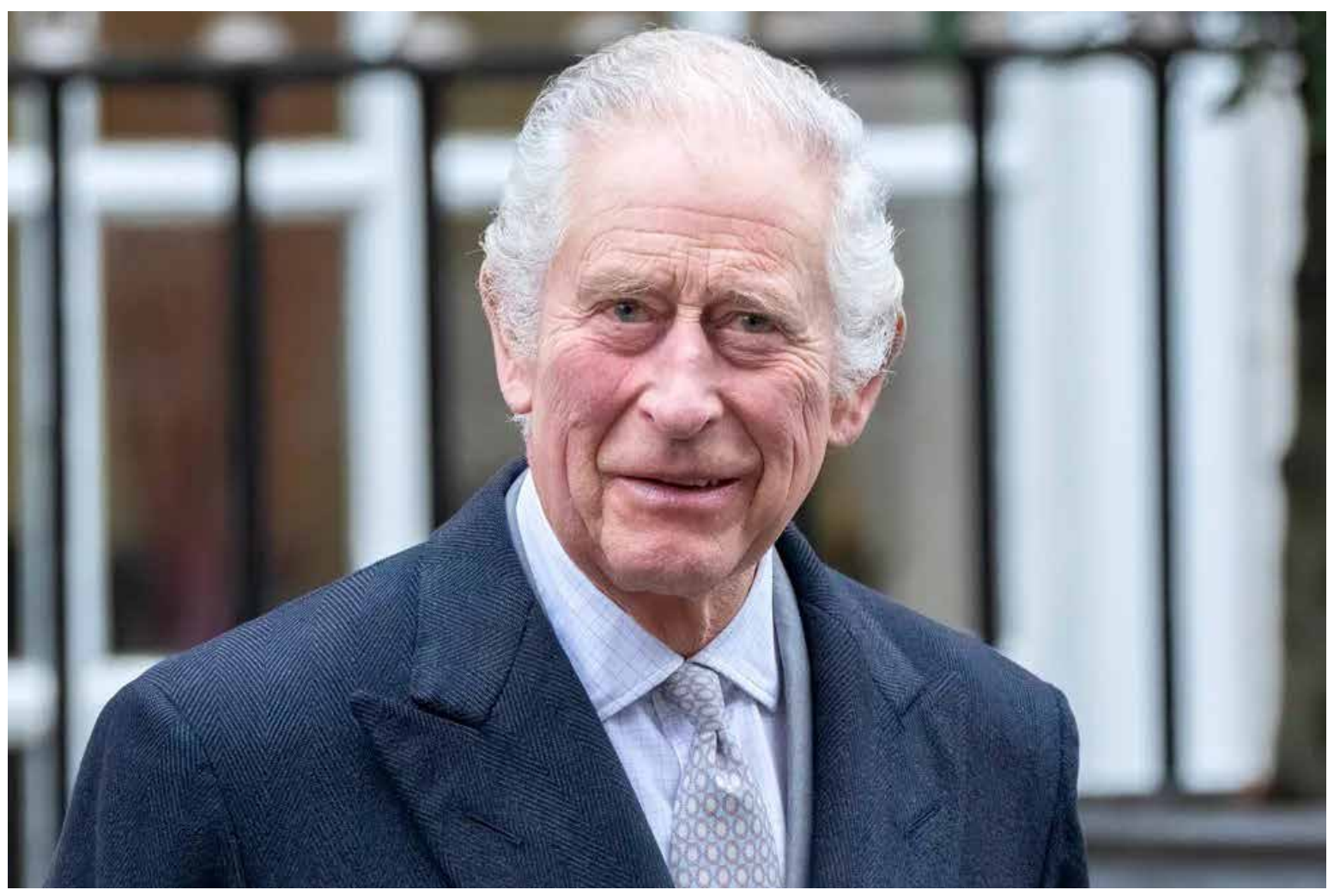
King Charles has been diagnosed with a form of cancer, says Buckingham Palace. Story on page 5.