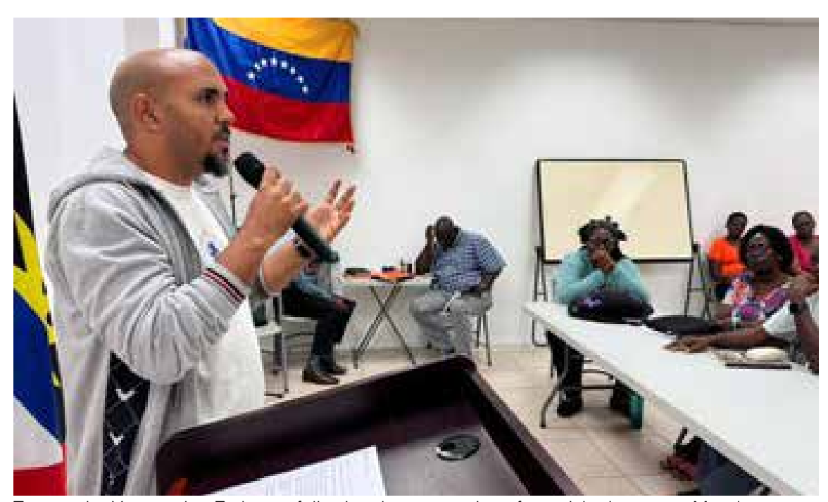
Tutor at the Venezuelan Embassy following the resumption of spanish classes on Monday