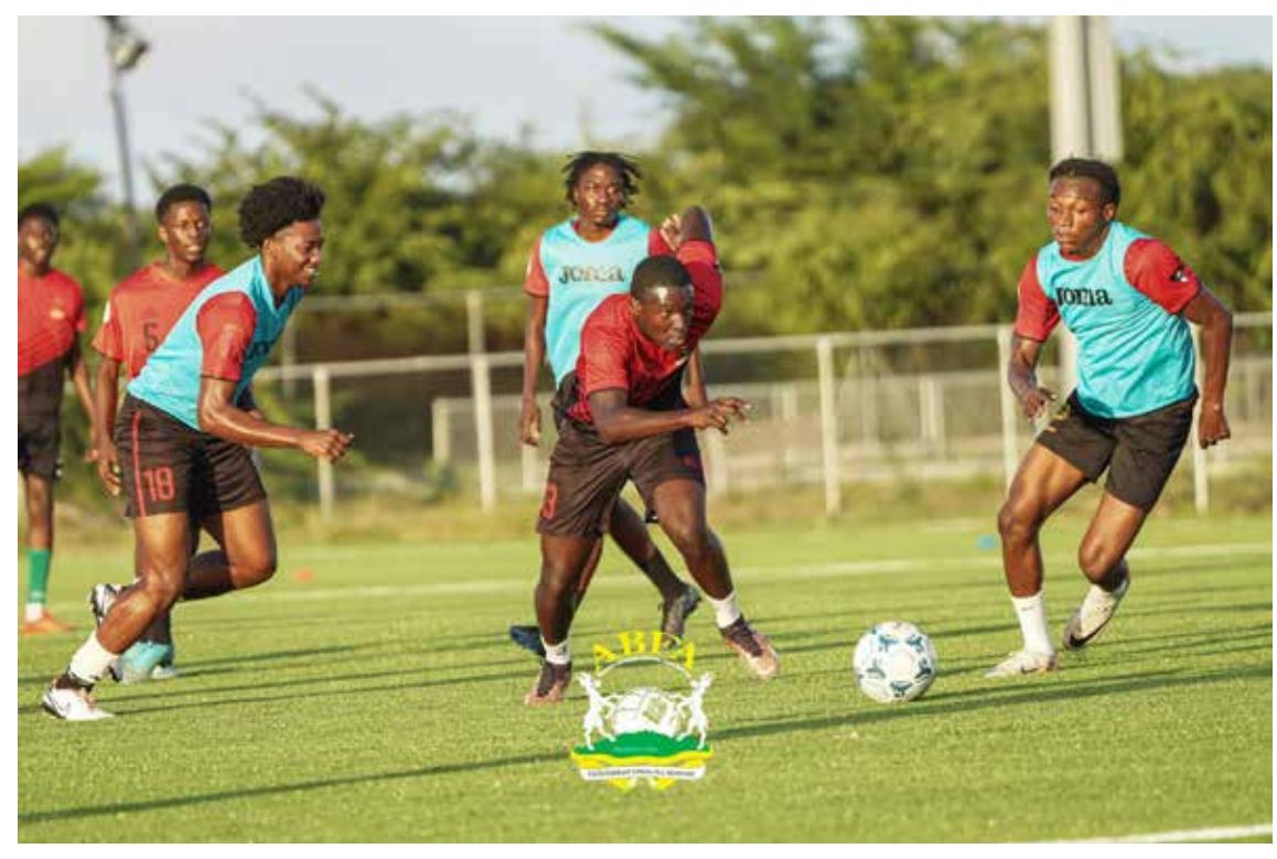
Players of the National Men's Under-20 team in training at the ABFA Technical Center at Paynters.

With only one team qualifying, the competition promises to be fierce as these talented young athletes showcase their skills and determination.