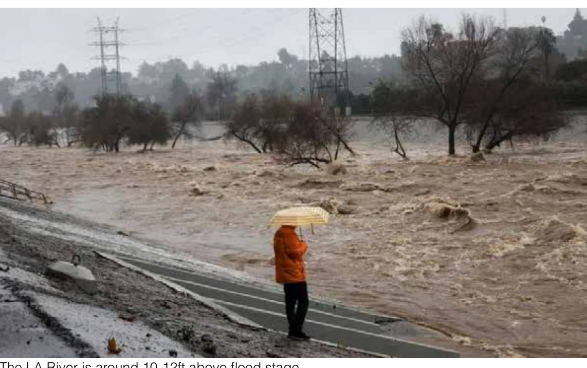
The LA River is around 10-12ft above flood stage.

A state of emergency has also been declared by the governor in eight state counties.