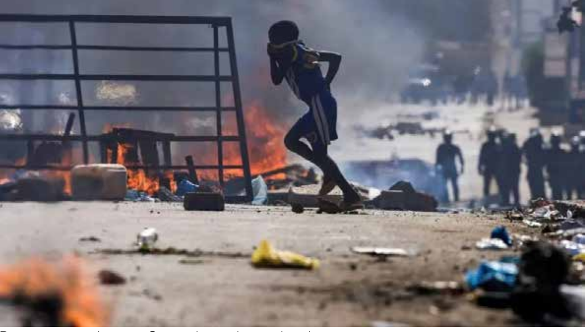
Protests erupted across Senegal over the weekend.

There was a heated atmosphere in the chamber, and it was reported that some opposition MPs had