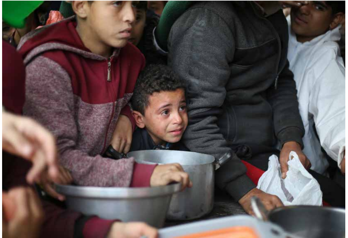
Palestinians line up for free food distribution during the ongoing Israeli air and ground offensive in Khan Younis, Gaza Strip, Friday, February 2, 2024.

made several financial donations to UNRWA, which is the primary humanitarian agency that provides support for over 2 million