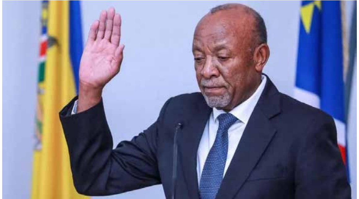
President Nangolo Mbumba took the oath of office hours after announcing the death of his predecessor.

Mr Geingob was first sworn-in as president in 2015, but had served in top political positions since independence in 1990.