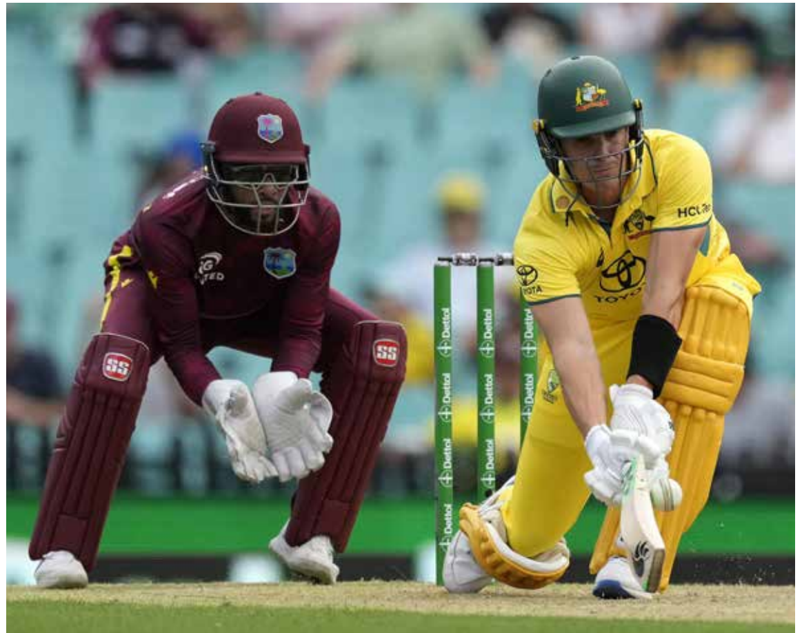
Australia's Sean Abbott, right, plays a shot in front of the West Indies' Shai Hope during their One-Day International cricket match in Sydney, Sunday, Feb. 4, 2024.

had an eventful five deliveries on his ODI debut as he smacked a four and a six before edging Alzarri Joseph, who took two for 74, in the first over, and Josh Inglis (nine) was smartly caught by Roston Chase at point.