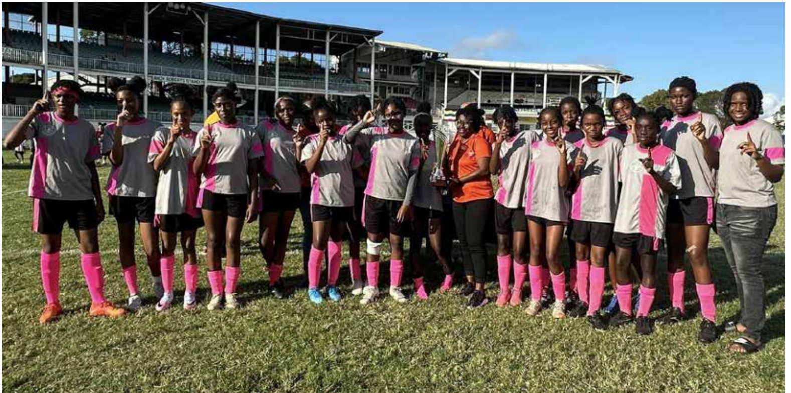
The Princess Margaret School team celebrate with their trophy after capturing the Under-16 Girls Division league title at the Antigua Recreation Grounds on Friday, February 2, 2024.

The result left the Young Lions winless and without a point, as they remain in the cellar after suffering their eighth loss in as many games.