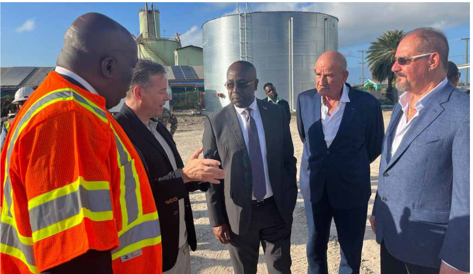
New United States Ambassador to Barbados and the Eastern Caribbean, Roger Nyhus, second left, in conversation with government and APC officials following a tour of the LNG power plant at Crabbes Peninsula. (Story on page 4)