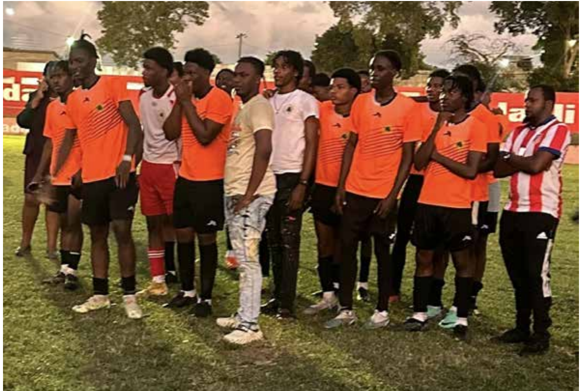
The Antigua State College team after capturing the Under-20 Boys Division league title at the Antigua Recreation Grounds (ARG) on Friday, February 2, 2024.

Ottos Comprehensive School made a fast start by surging to a two-nil lead as cont'd on pg 19