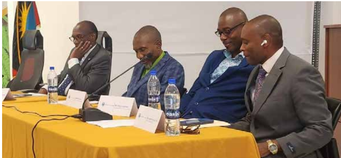
Headtable at Caribbean Pharmaceutical Society symposium held in Antigua and Barbuda February 2-4.

The Symposium, which commenced on Friday, February 2nd, focused on the theme “Pharmacists making a difference in patients’ lives”. It was held in a hybrid format, in person and online via social media plat- cont’d on pg 8