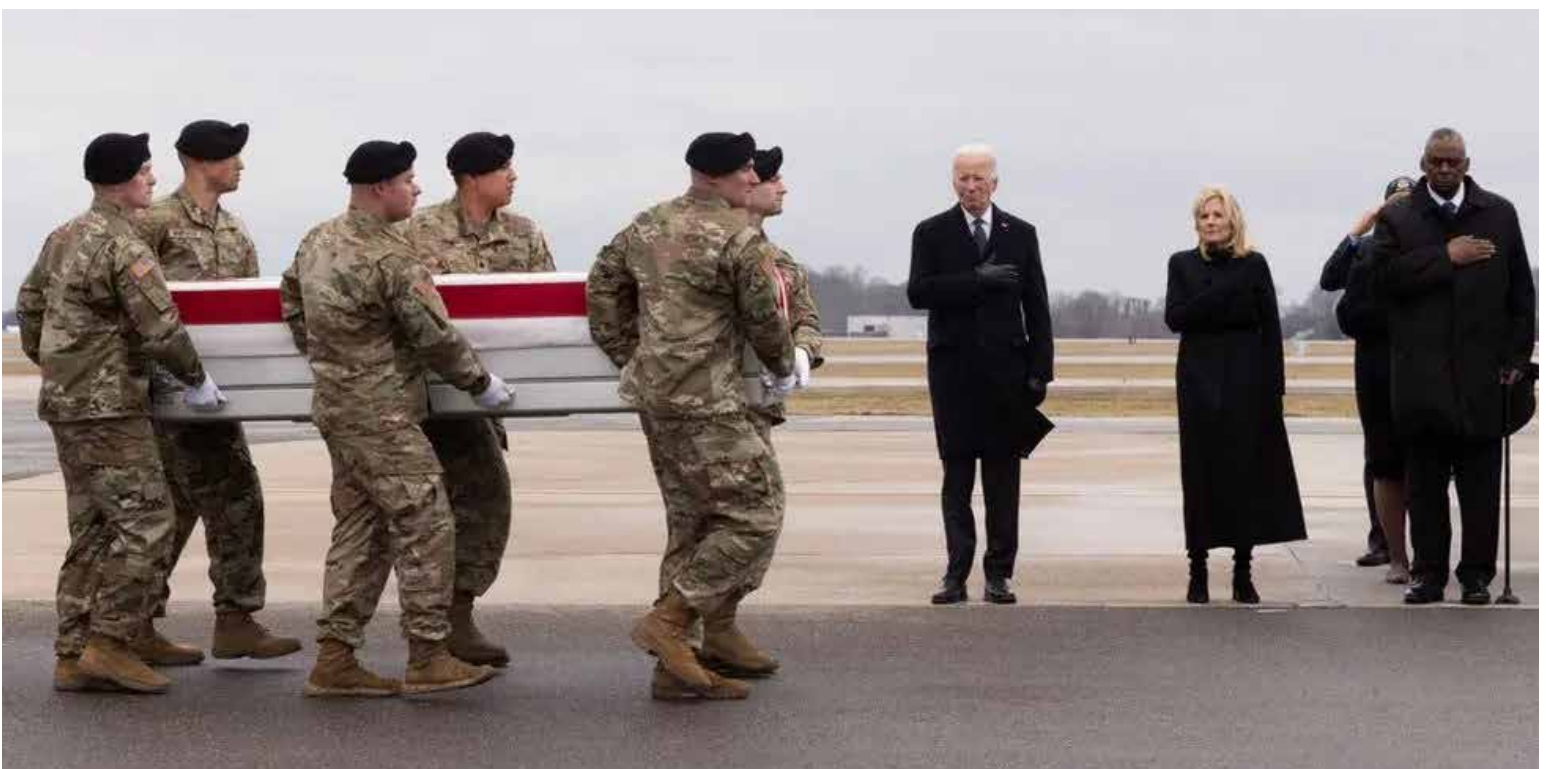
US President Joe Biden and First Lady Jill Biden attended a repatriation ceremony for three American soldiers killed in a drone attack.