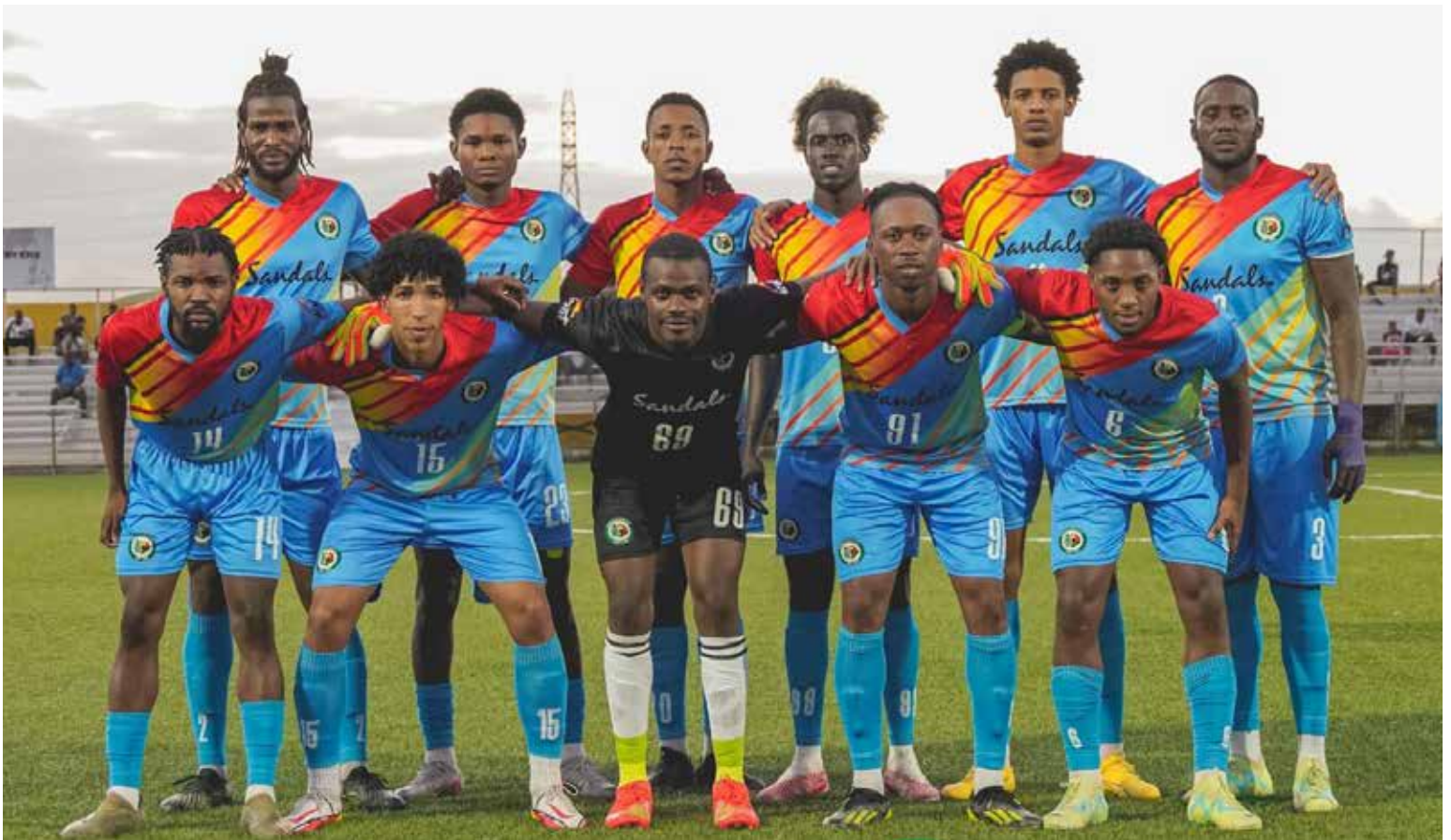
Players of the Sandals and Inet Jennings Grenades football team. (File photo)