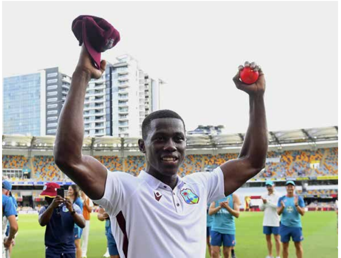
West Indies' Shamar Joseph raises the ball after taking seven wickets in his team's defeat of Australia on the fourth day of the second cricket Test match in Brisbane, Sunday, Jan. 28, 2024.

Shamar Joseph's remarkable debut series showcased his prowess with