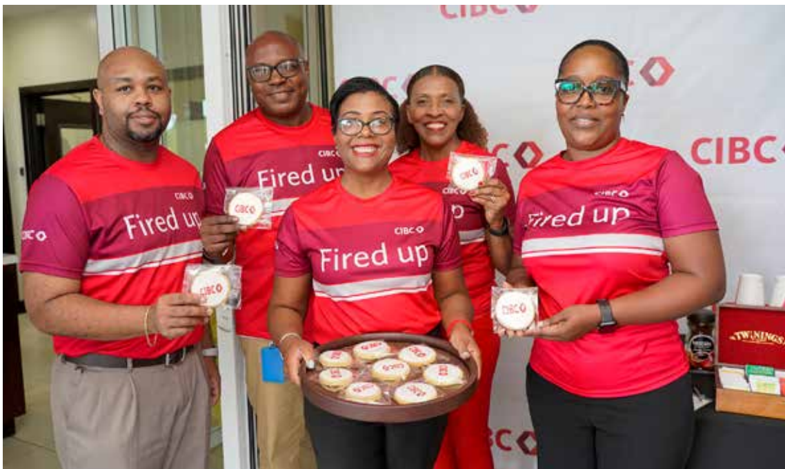
Country Head and staff, ready to present CIBC cupcakes to customers.

“Our new brand identity is a testament to our heritage, symbolizing the values that have been the cornerstone of our success for the past 100 years. At the same time, it embraces a fresh, contemporary look that signifies our readiness to embrace the future. We want our clients