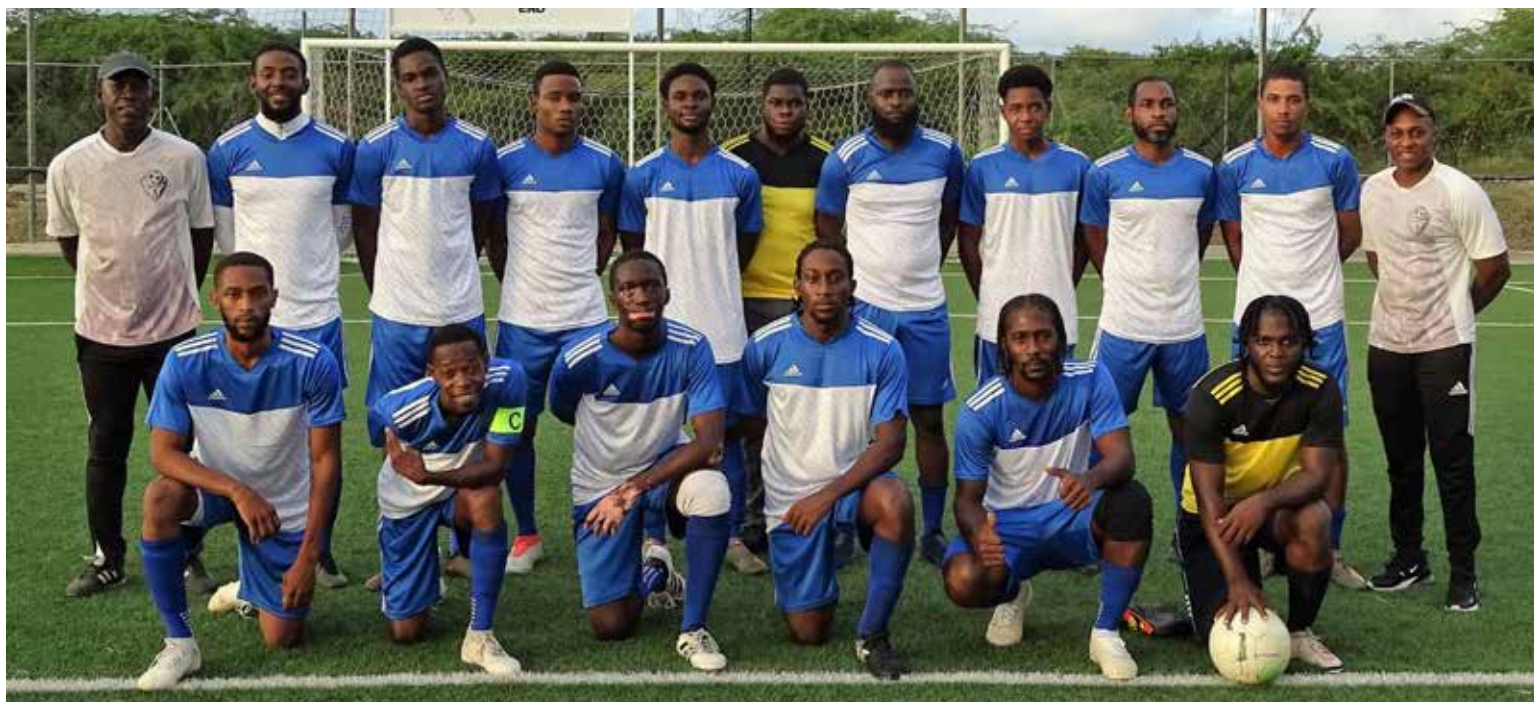
Players of the Sea View Farm football team. (File photo)

Princess Margaret School will be seeking their fourth title this season after winning the under-14 and 16 boys division league competitions as well as the under-20 girls championship.