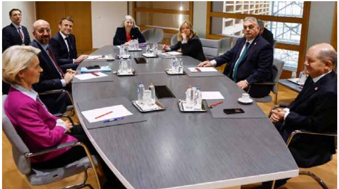
EU leaders at a pre-summit meeting on Thursday morning.

The agreement was announced less than two hours after the summit started, surprising many observers who had expected talks to go on much longer due to