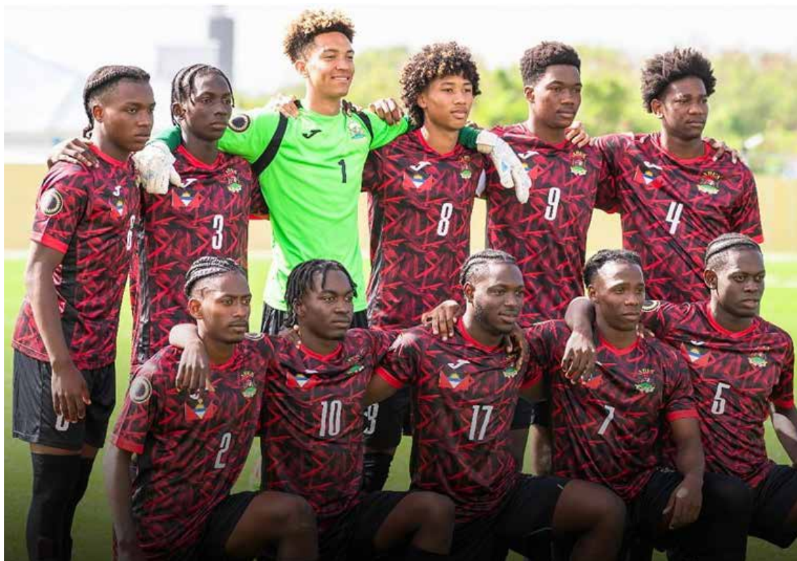
The Antigua and Barbuda Benna Boys starting XI against Suriname at the ABFA Technical Center on Sunday, February 25, 2024.