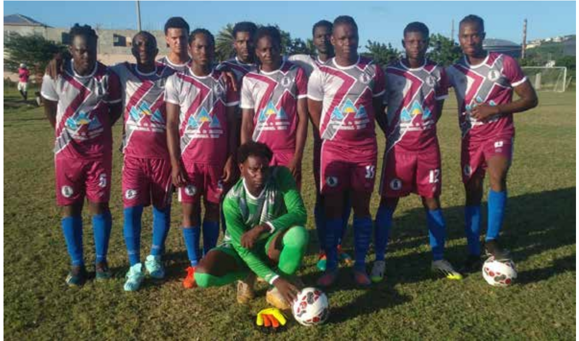
Players of the English Harbour football team. (File photo)

Golden Grove slipped to eighth place by remain-