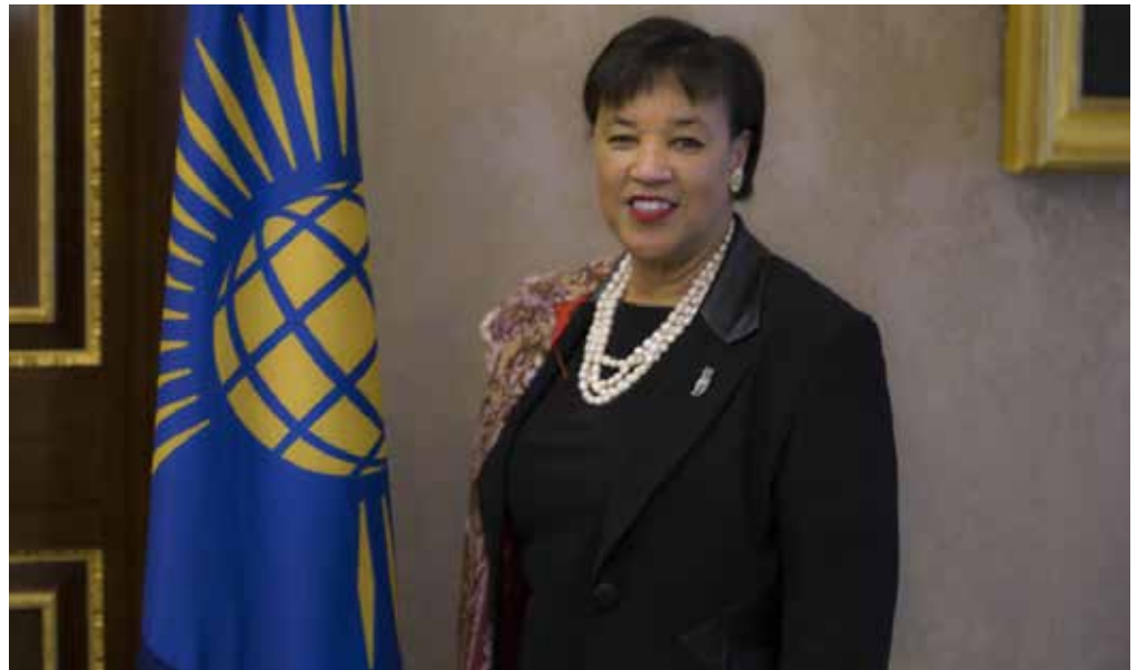
Commonwealth Secretary-General, Patricia Scotland KC.

“As a Caribbean person, every one of these meetings are like coming home to family. In particular, I am