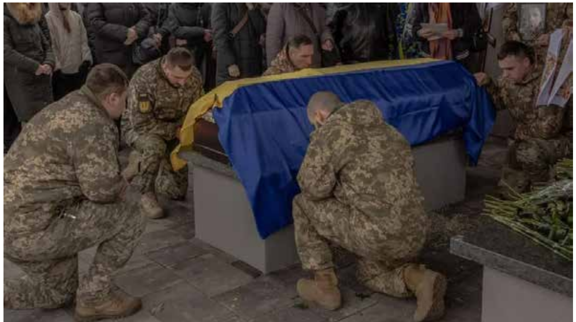
President Zelensky said he made the updated death toll public to counter Russia's inflated estimates.

"31,000 Ukrainian soldiers have died in this war. Not 300,000 or 150,000, or whatever Putin and his lying circle are saying. But each of these losses is a great loss for us."