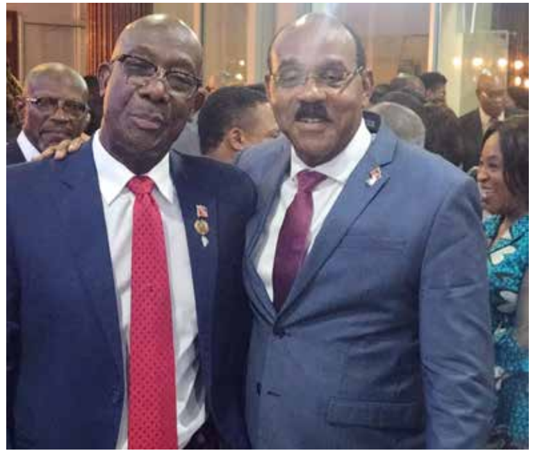
PM Gaston Browne with PM Keith Rowley of Trinidad and Tobago.