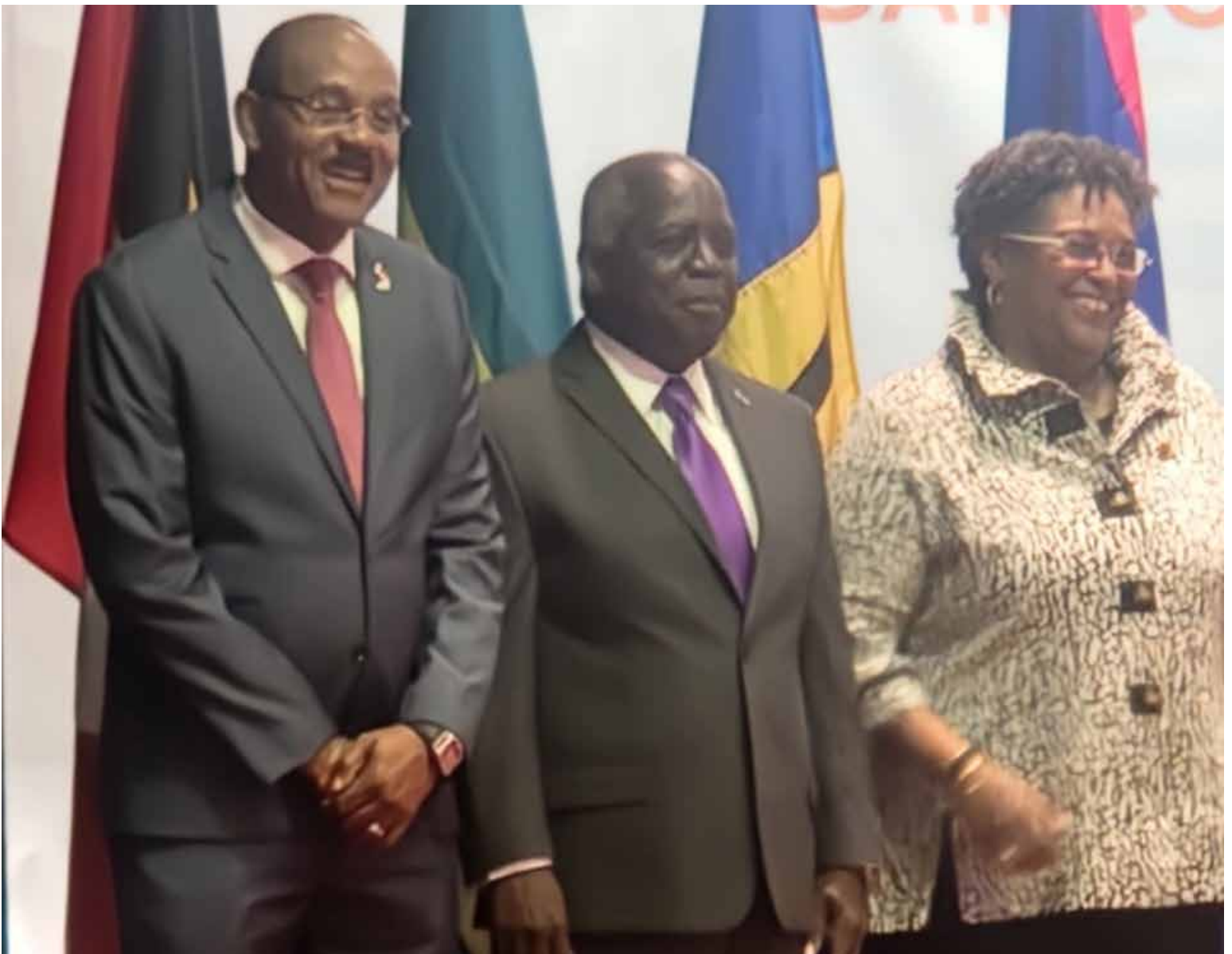
PM Gaston Browne on the platform with other regional leaders at the Forty-Sixth Regular Meeting of the Conference of Heads of Government of the Caribbean Community, CARICOM which opened on Sunday. Story on page 3.