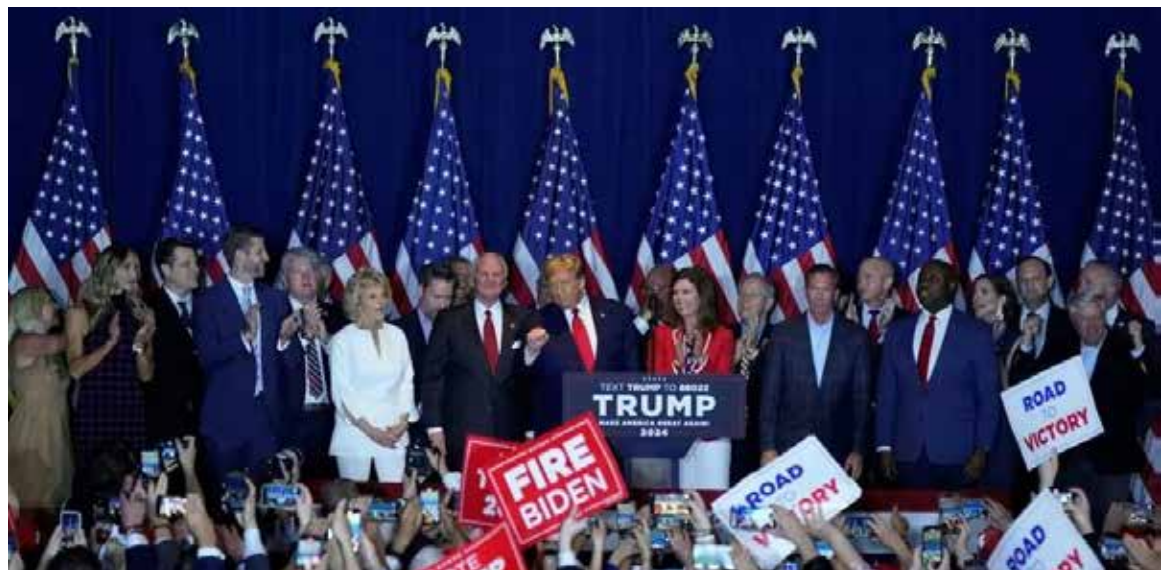
Nearly two dozen allies flanked Mr Trump during his victory speech after the South Carolina primary.

Mr Trump certainly has much to boast about with this win. Exit polling conducted by the BBC's US