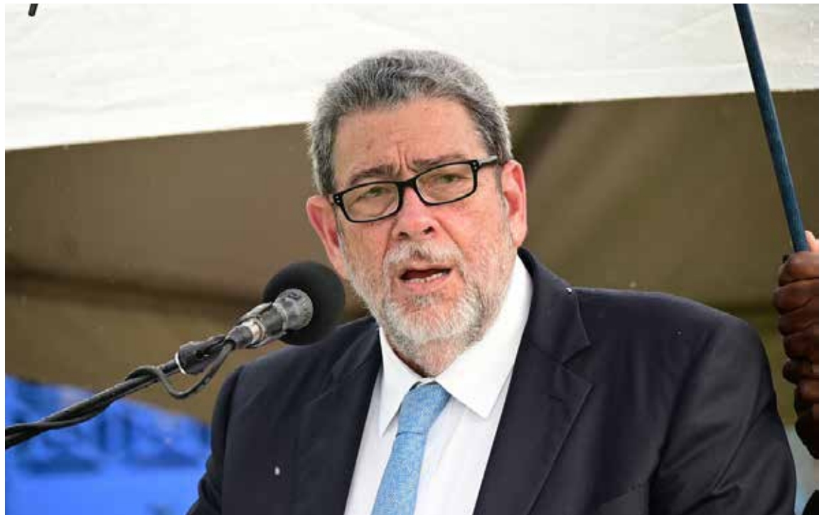
Prime Minister of St Vincent and the Grenadines, Dr Ralph Gonsalves.

"The bank is extremely focused on preserving the independence, confidentiality and integrity of the process and as you can well appreciate in order for us to maintain the integrity and confidentiality of the process we are unable to provide any other details at this time," Solomon told reporters during the bank's annual news conference.