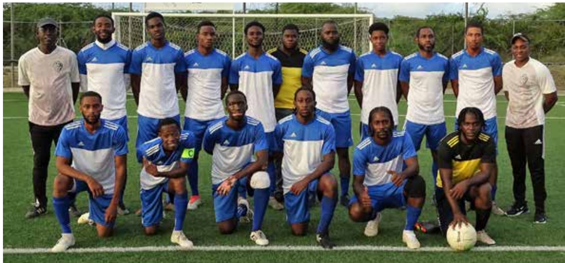
Players of the Sea View Farm football team. (File photo)

Their ninth win in 10 matches allows Freemans Village to extend their lead at the top of the standings by advancing to 27 points,