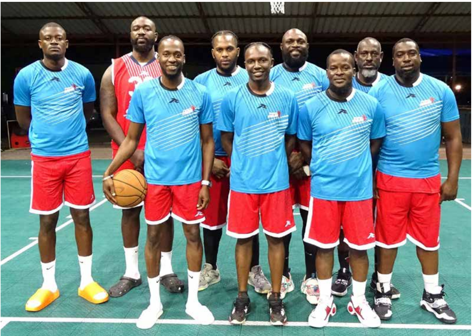
Players of the Potters Stealers basketball team.