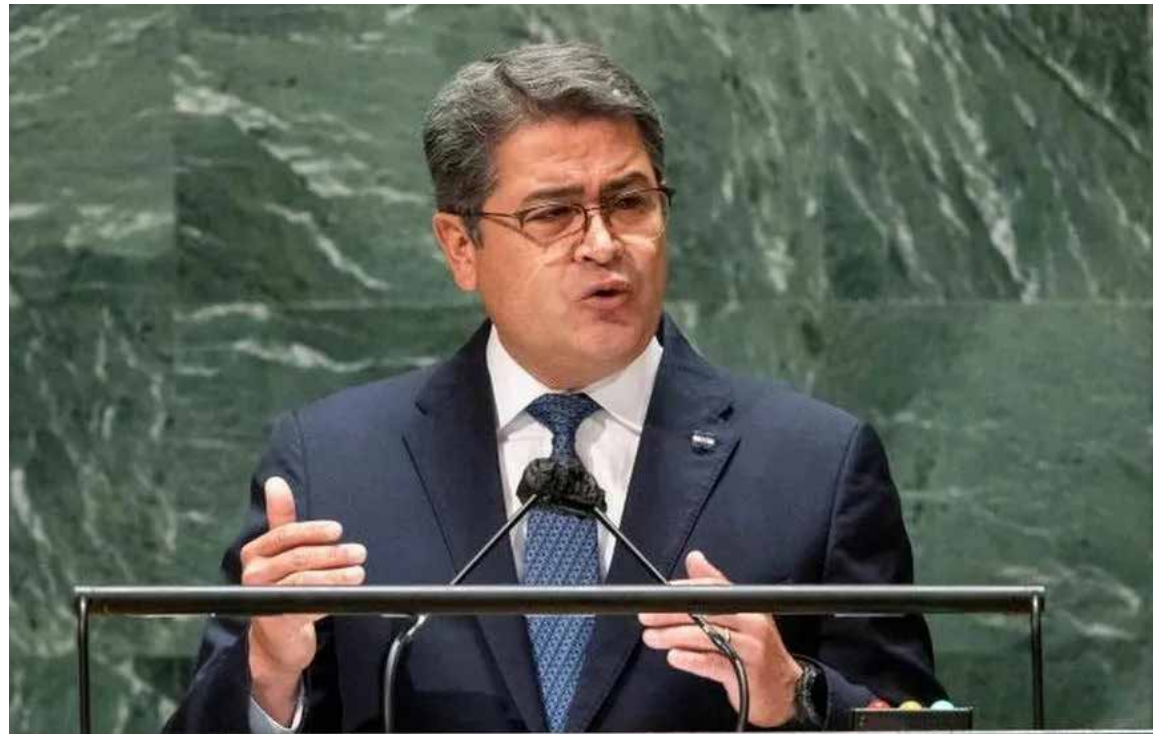
Juan Orlando Hernández was president from 2014 to 2022.

Mr Hernández in turn thanked President Trump