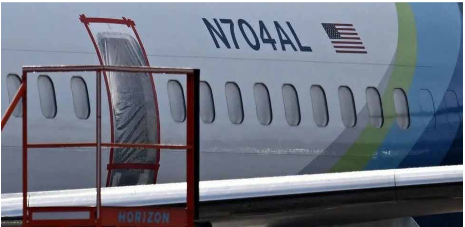
The missing panel on the Boeing plane.