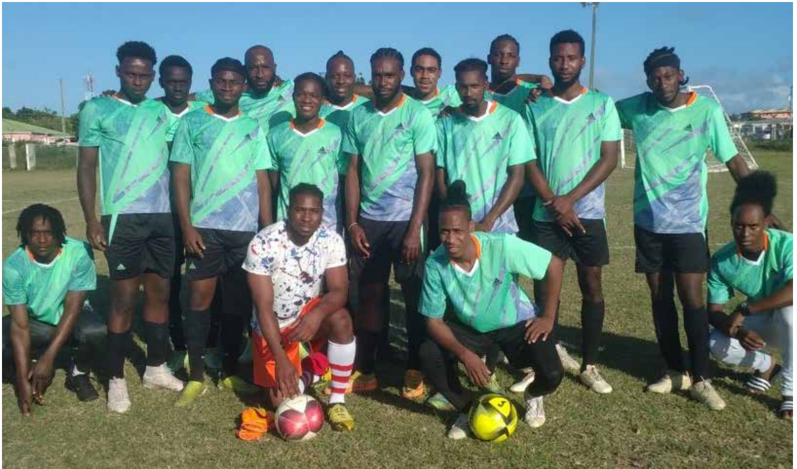
Players of the Potters Tigers football team. (File photo)