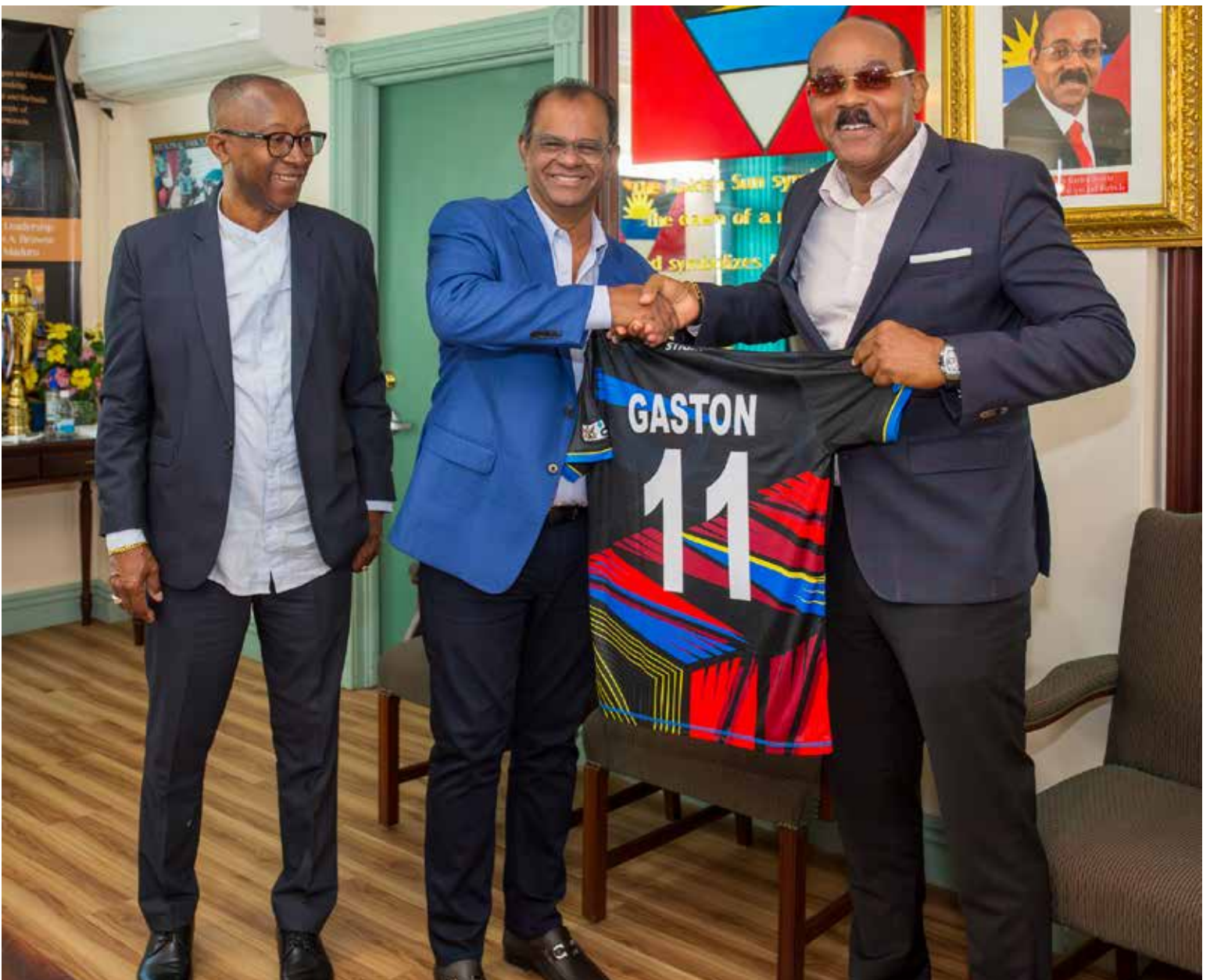
The owners of the CPL's newest team, the Antigua and Barbuda Falcons, paid a visit to the Cabinet on Wednesday.