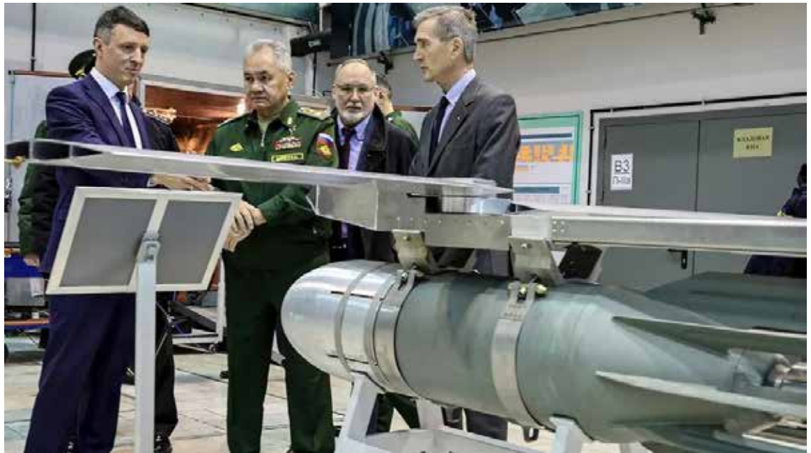
Russian Defence Minister Sergei Shoigu visiting a Russian missile factory last month.

"Sanctions are hitting the Russian military industrial complex hard, causing severe delays and increasing costs. An inability to access Western components is severely undermining Russia's production of new systems and repairs