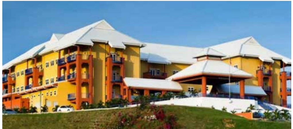
Sir Lester Bird Medical Centre

The minister contends that the SLBMC serves many patients satisfactorily during each calendar year.