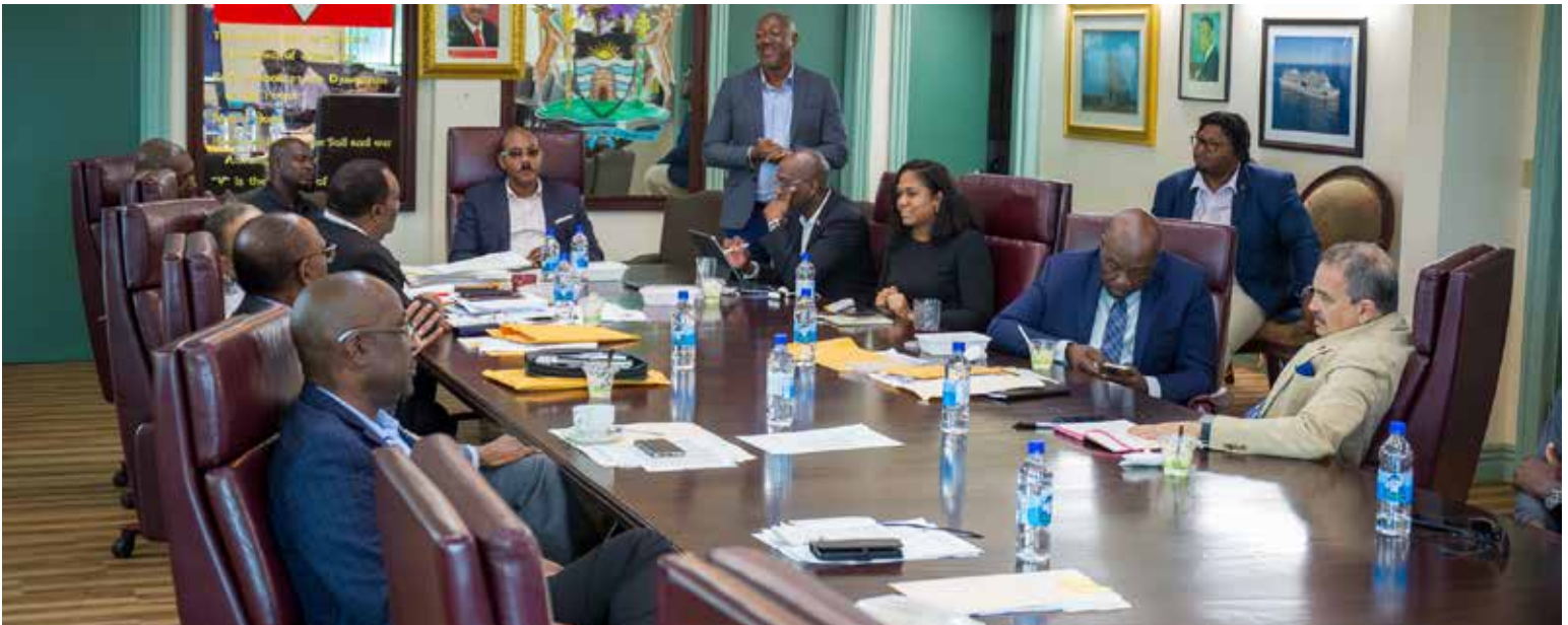
Ministry of Works officials shared upcoming plans with the Cabinet.