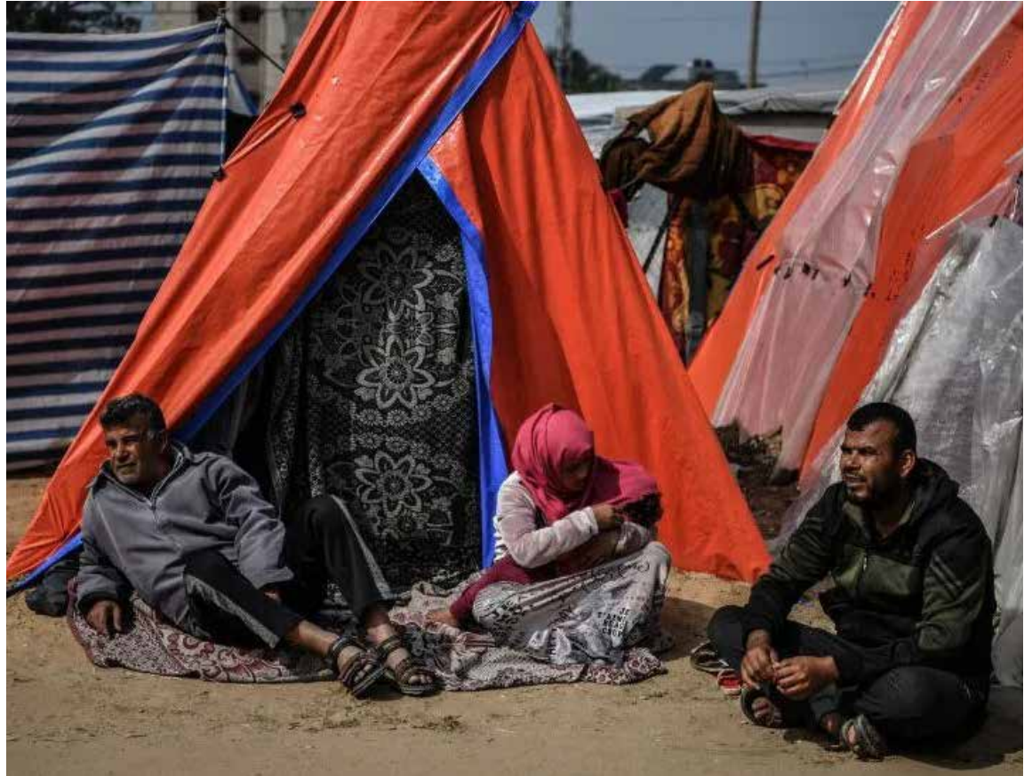
Rafah is sheltering more than a million people who have been forced to flee other parts of the Gaza Strip.

or when the Security Council will vote on the form of words proposed by Washington.