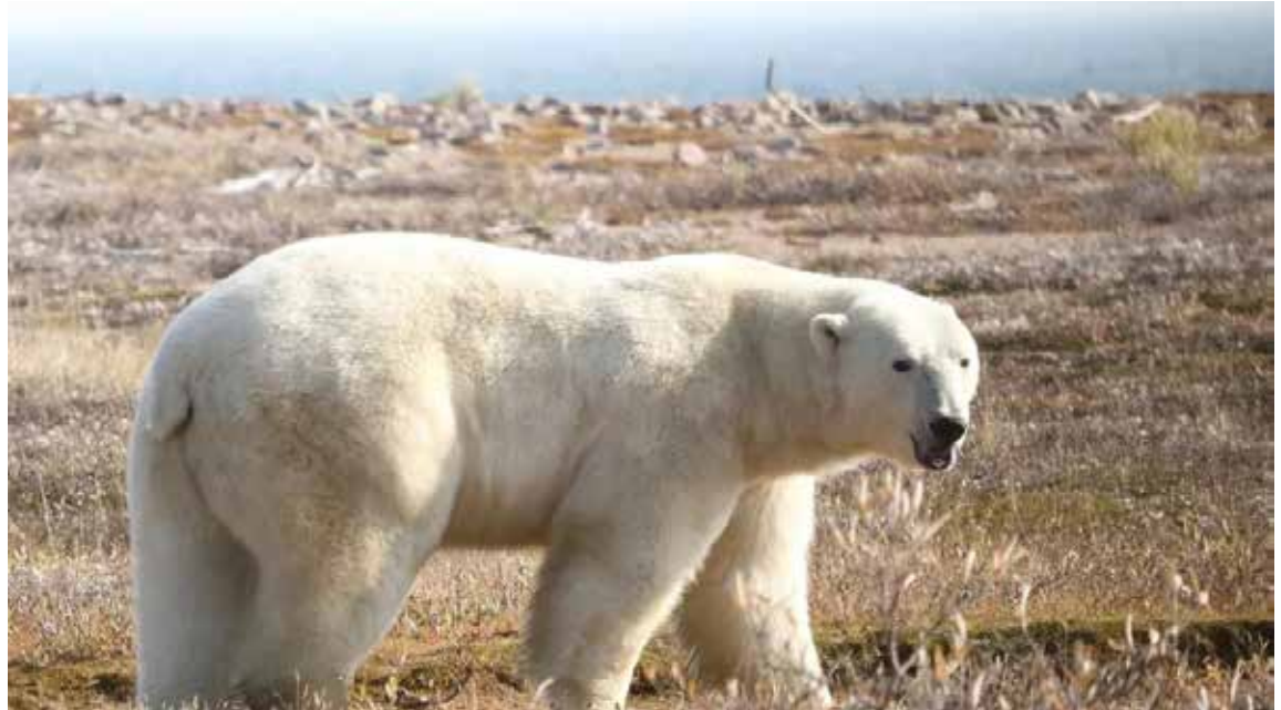
Polar bears in the study lost weight when spending more time on land as the sea ice melted.

But during the warmer months many parts of the Arctic are now increasingly