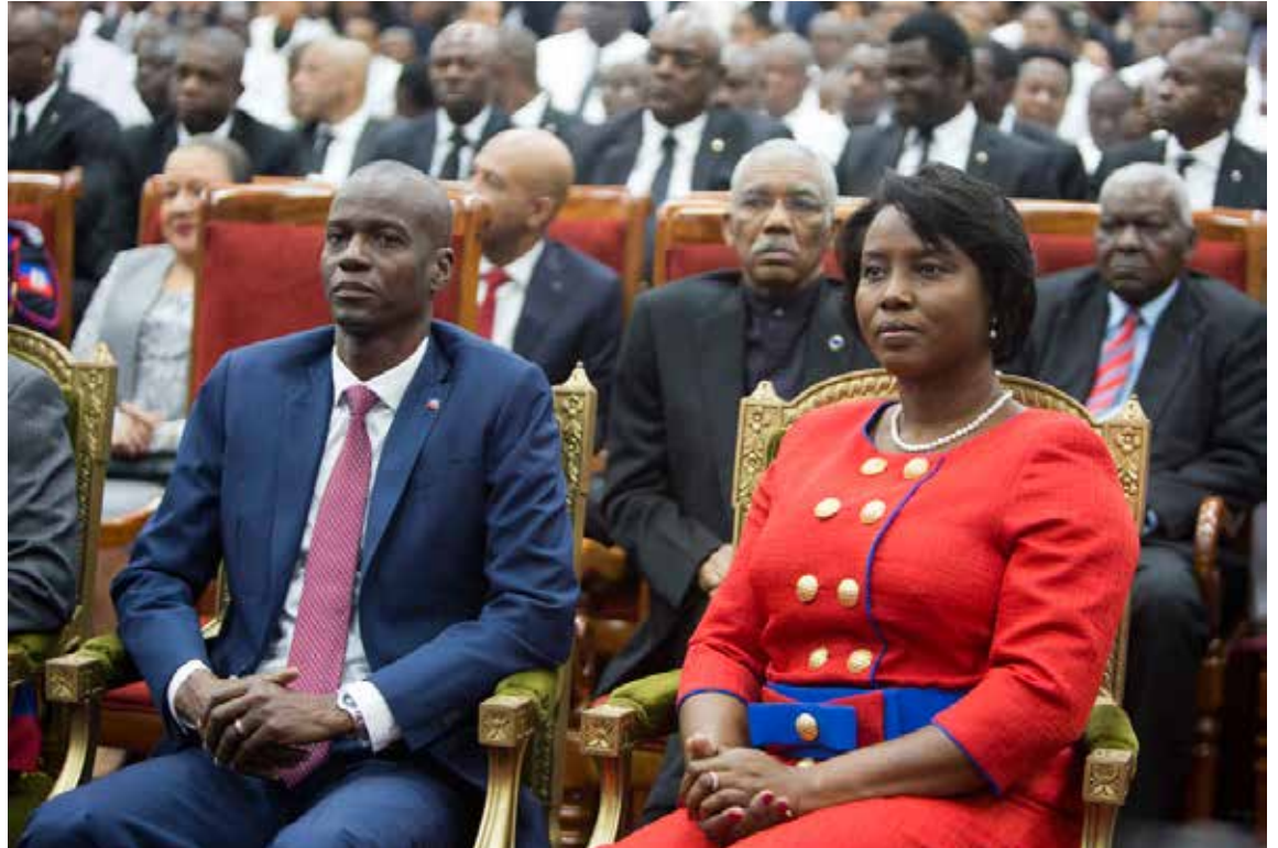
Haiti's President Jovenel Moïse sits with his wife Martine during his swearing-in ceremony at Parliament in Port-au-Prince, Haiti, Tuesday February 7, 2017.