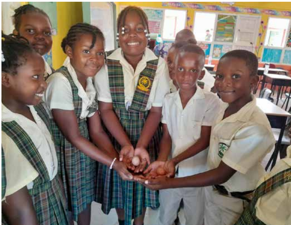
Buckley's Primary School recently started egg production.

The competition is a joint undertaking of the Ministry of Education and the Citizen’s Engagement Unit