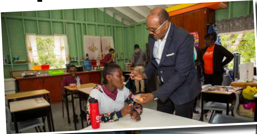
PHOTO ESSAY Prime Minister Gaston Browne visits the Adele School for Special Children on Tuesday