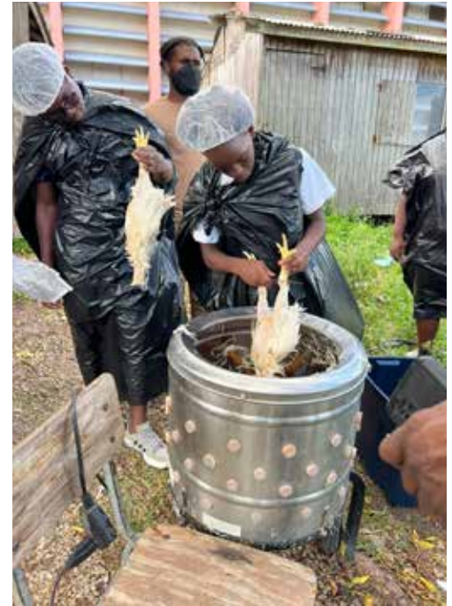
Jennings Secondary Students processing broiler chicken