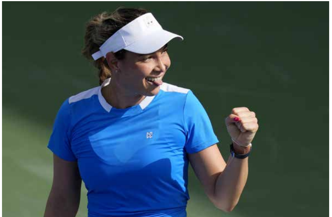
Donna Vekic from Croatia celebrates after beating Aryna Sabalenka during a match of the Dubai Duty Free Tennis Championships in Dubai, United Arab Emirates, Tuesday, Feb. 20, 2024.

Vekic referenced Sabalenka winning "the big one" of their career matchups on Tuesday but her sixth win in their eight contests wasn't too shabby either.