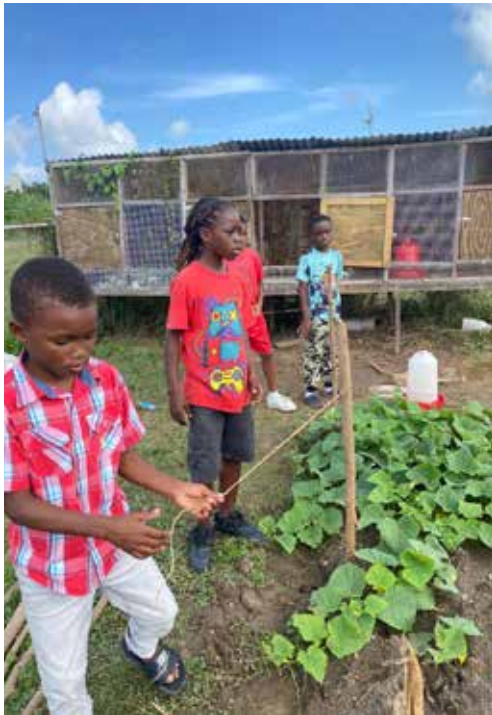
Buckley's Primary School farm.

Several schools have registered to participate in the inaugural Interschool Garden Competition which is designed to put on national display the work being done in the agricultural science departments in many schools