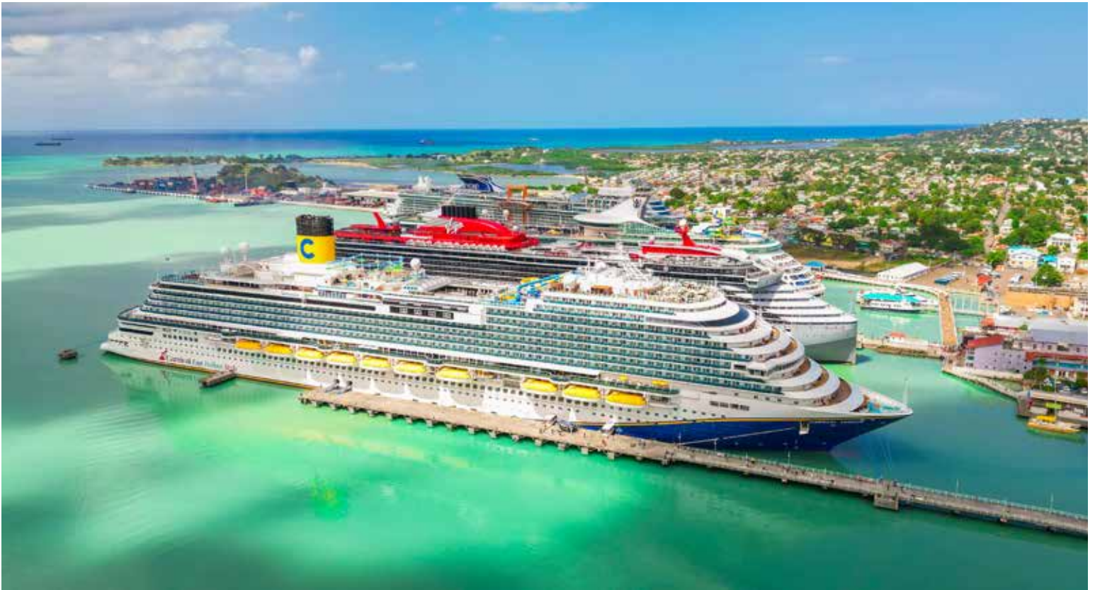
Carnival Venezia's inaugural visit on February 15, 2024.