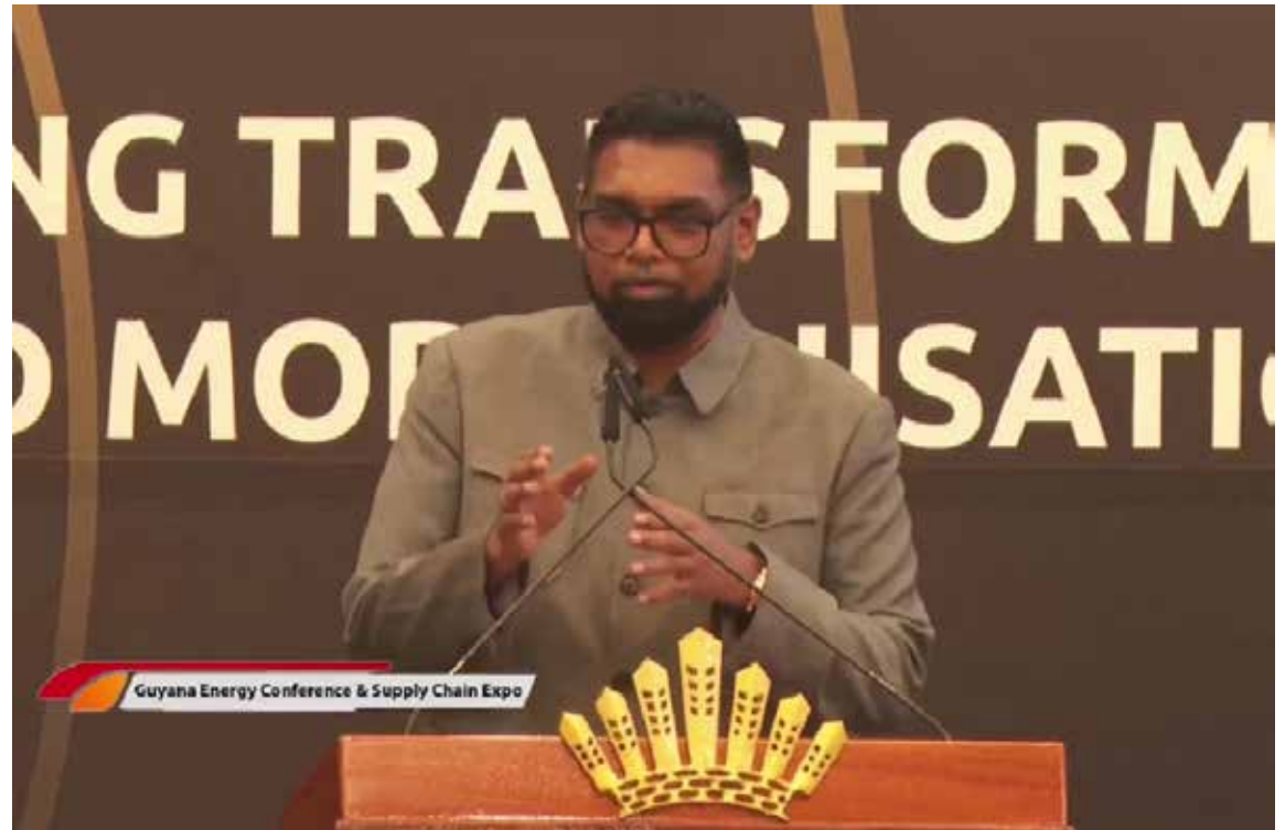
President of Guyana Dr Irfaan Ali speaking at the opening of the Guyana Energy Conference and Supply Chain Expo on February 19, 2024.

ana says this service can help the region to achieve the goals of integration, a greater level of trade and food security.