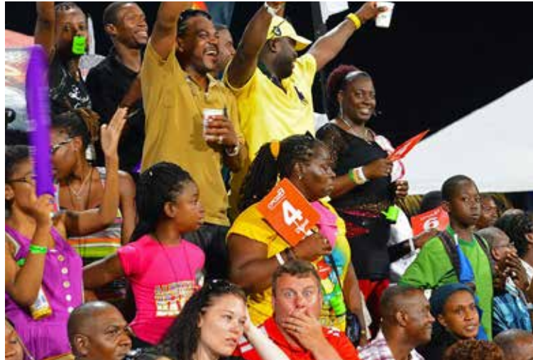
Fans in attendance at a cricket match in the Caribbean.

A variety of ticket options will be available and accessibly priced. Fans will be able to purchase tickets to single or multiple matches, travel and hospitality