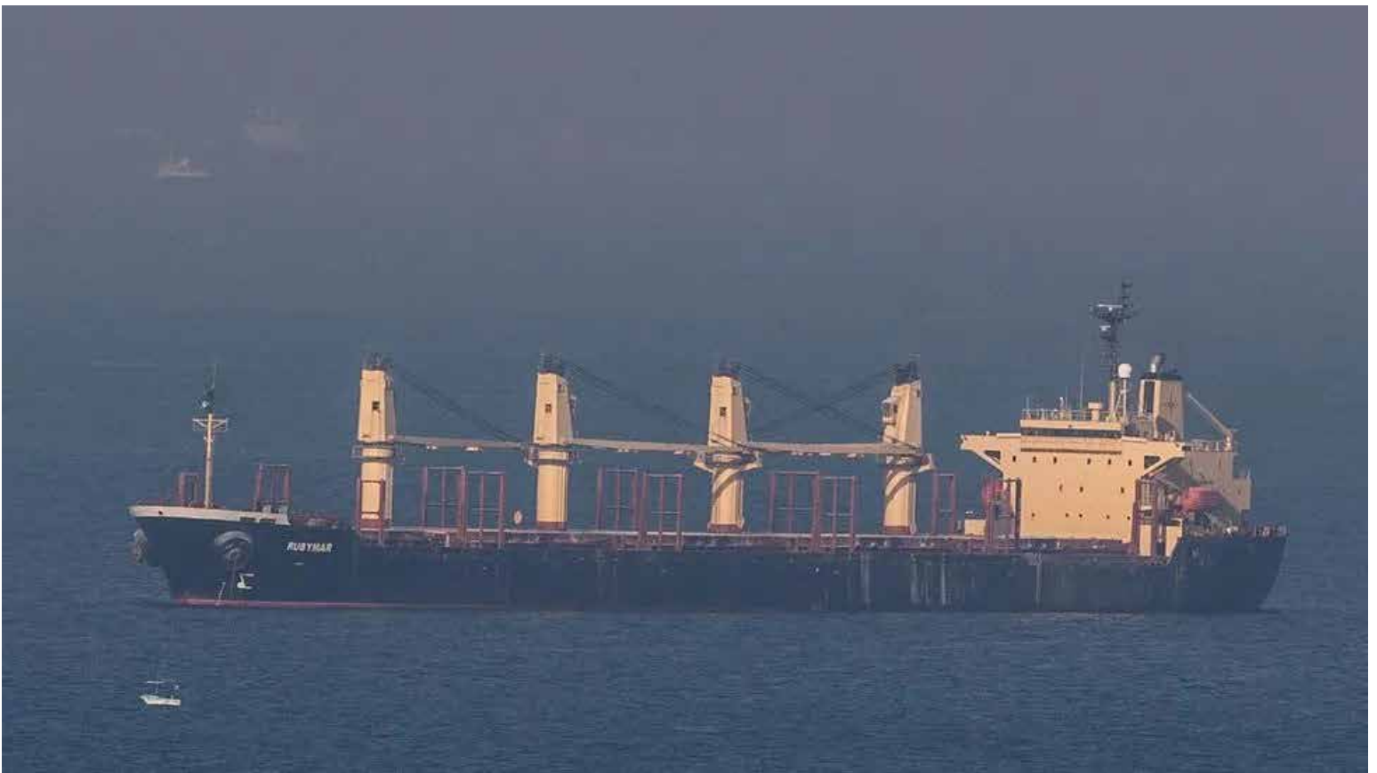
The Houthis said they had targeted the the Belize-flagged, British-registered cargo ship Rubymar (file photo)