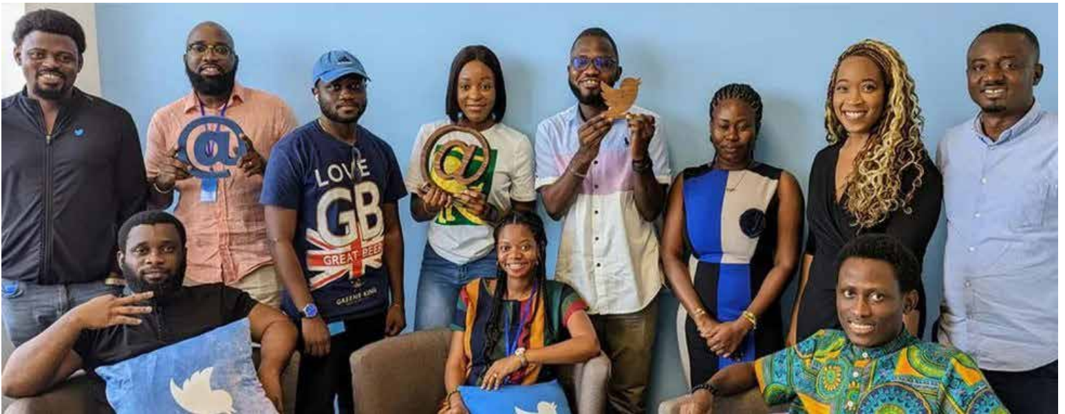
Twitter, now X, staff in Ghana at the time of the takeover, many of whom subsequently lost their jobs.