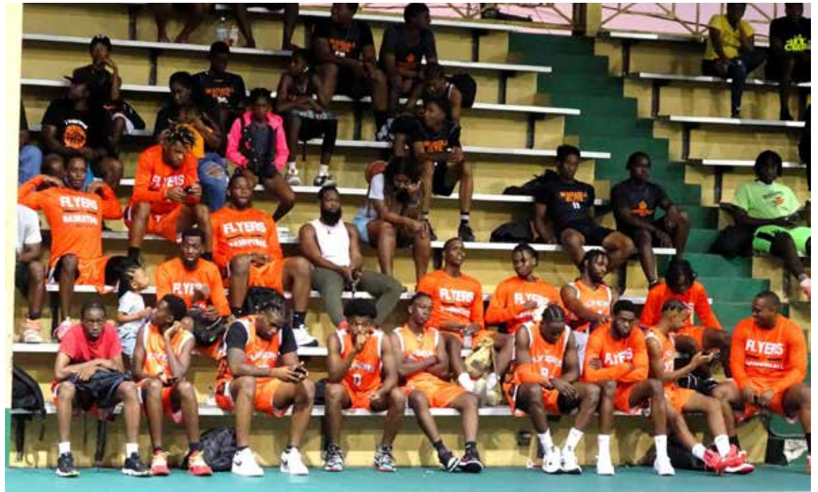
Players of Flyers Basketball teams sit in the stands during the official opening of the 2024 Antigua and Barbuda Basketball Association's domestic league at the JSC Sports Complex on Sunday, February 18, 2024.