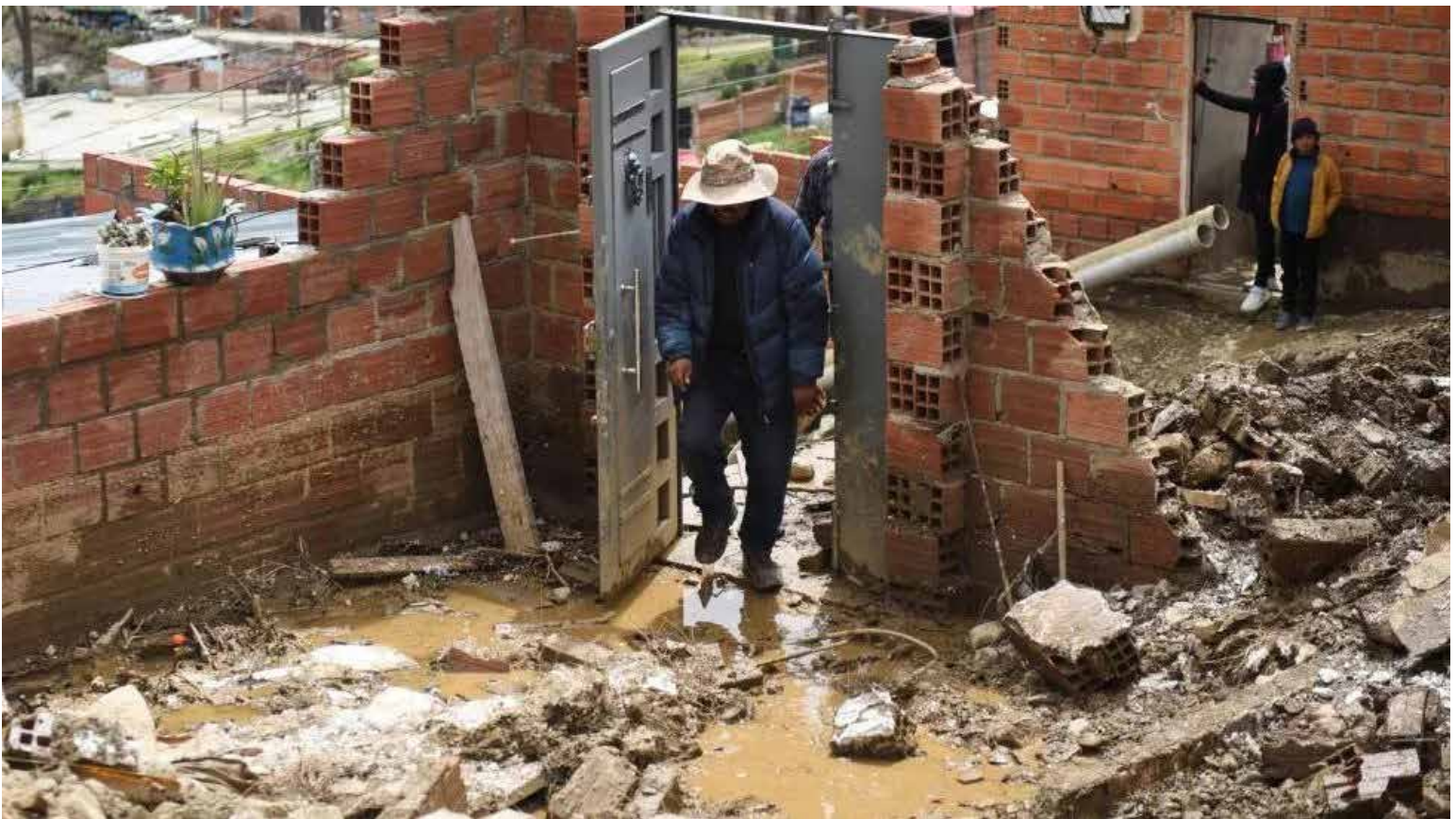
Some homes were buried by a landslide in Achocalla, while others had their roofs swept away.