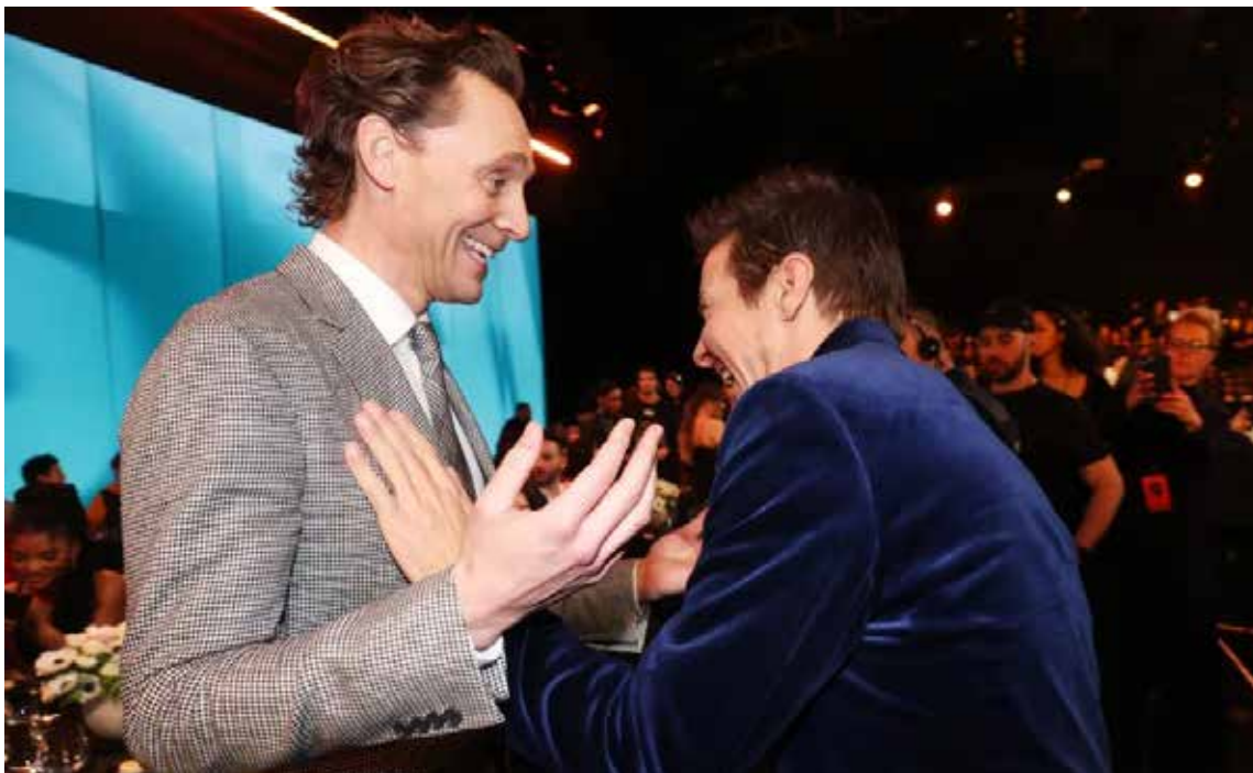
Renner's fellow Marvel star Tom Hiddleston greeted him after Renner had presented the award.

"There's always something to do to get better, be stronger, be happier, be healthier, and that's what I look forward to."