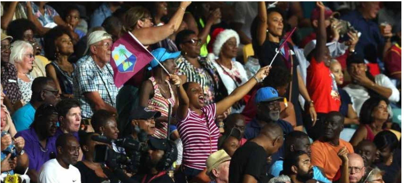
Spectators watching a cricket game in the West Indies