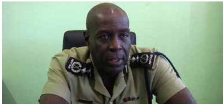
Police Commissioner Atlee Rodney

will also need to be attached specifically to the airport," he stated.