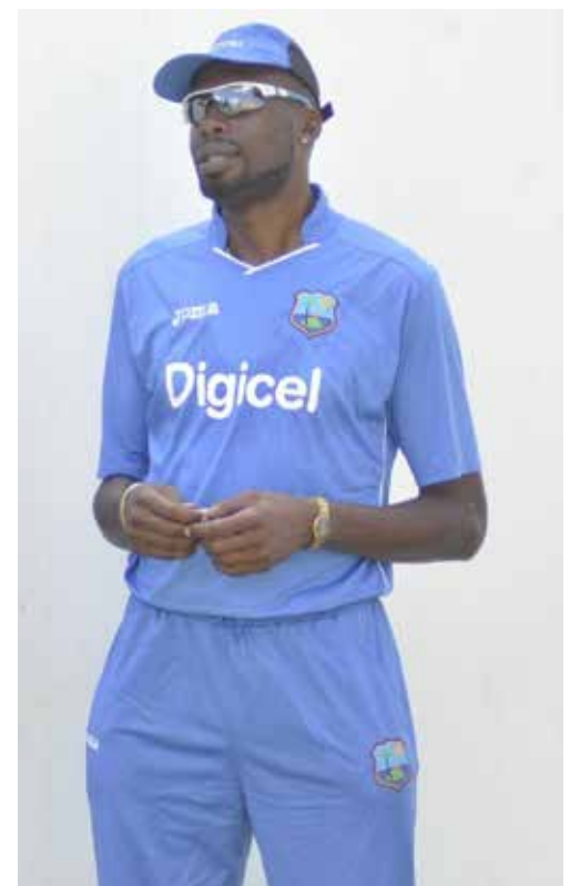
Sir Curtly Ambrose.

However, Joseph's introduction turned the game on its head, the speedster defying painful toe to snatch seven for 68 in 11.5 consecutive hostile overs, and send the Aussies tumbling to an eight-run defeat.