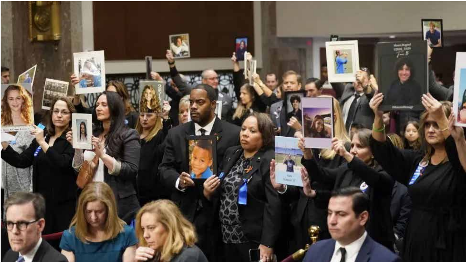
Families held up photos of their loved ones in the audience