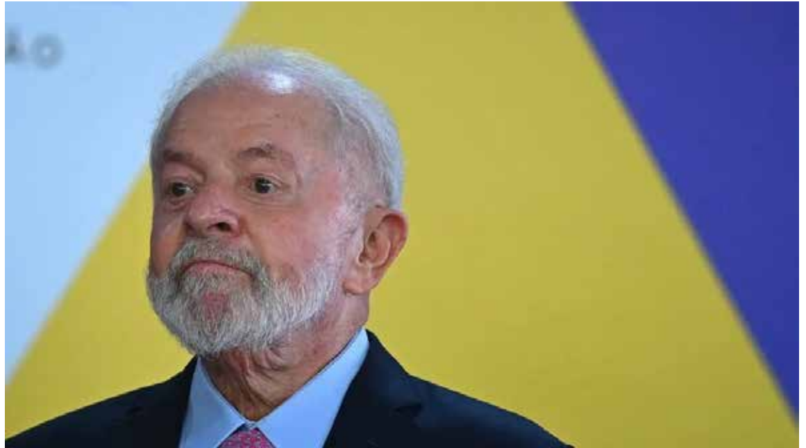
Lula at his residence in Brasilia on Tuesday.

The scandal first broke on Thursday when Brazil's Supreme Court unsealed documents in which Abin was accused of carrying out surveillance on key political