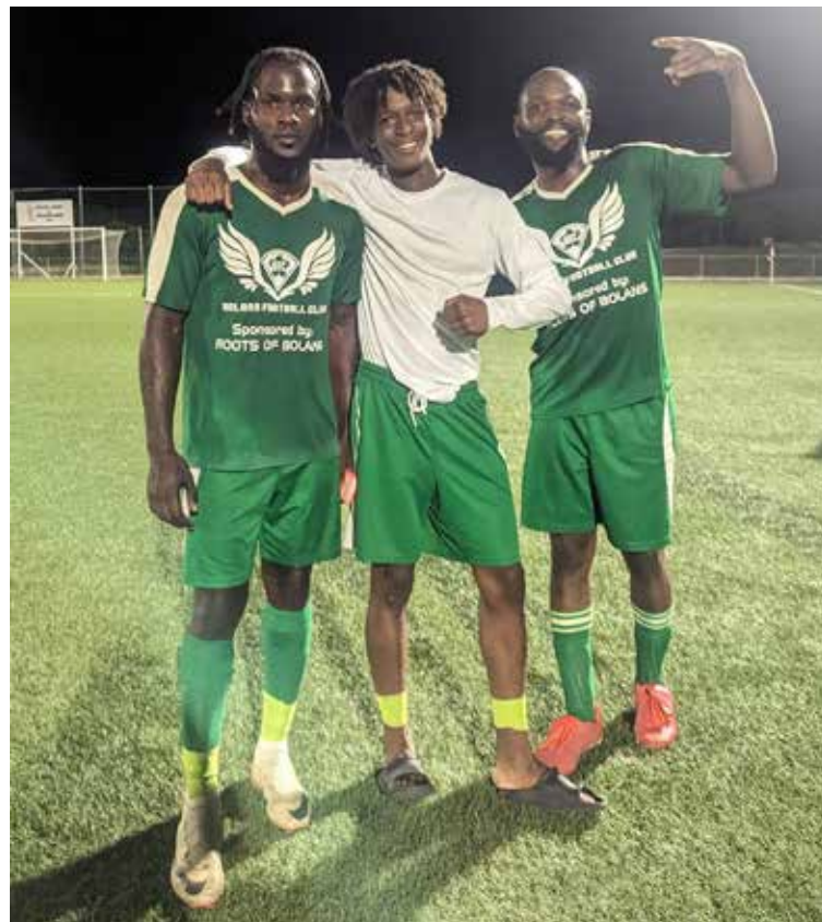
Three players of the Bolans team enjoy their success against Police in their First Division encounter at the ABFA Technical Center on Friday, February 16, 2024.