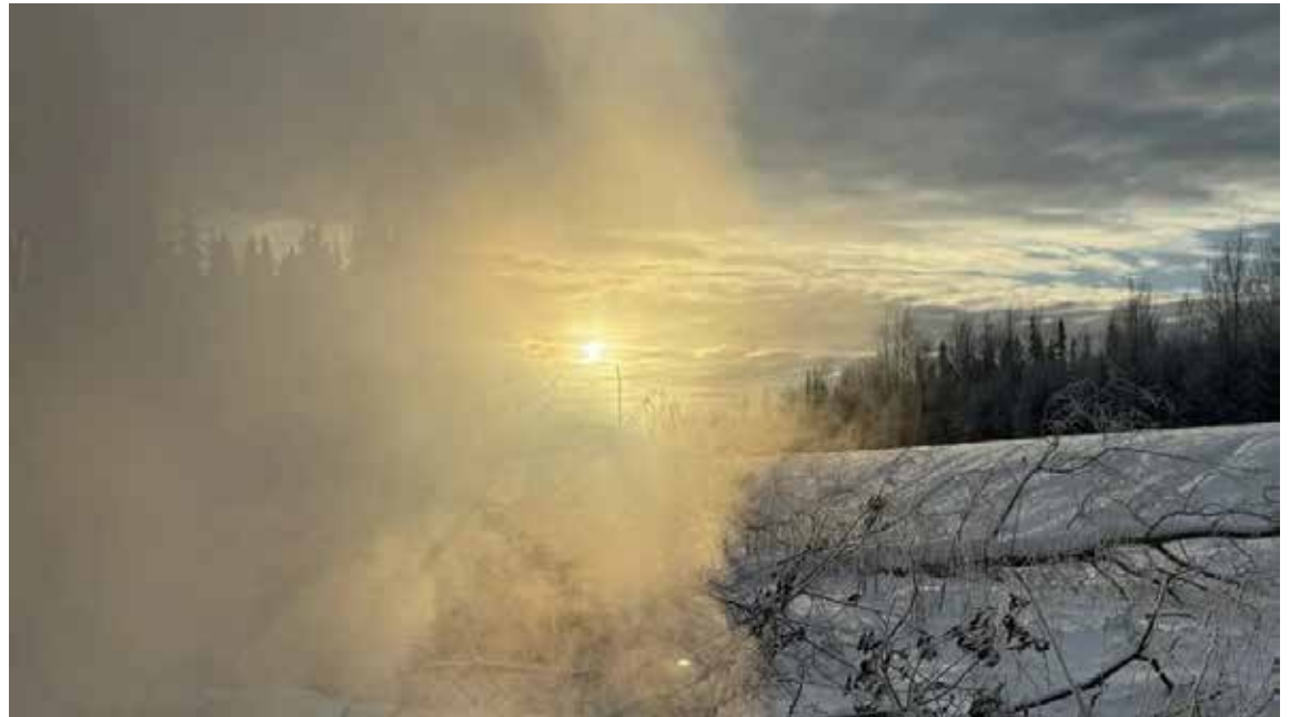
Smoke from a zombie fire pictured here in Fort Nelson, BC.

They are flameless smoulders that burn slowly