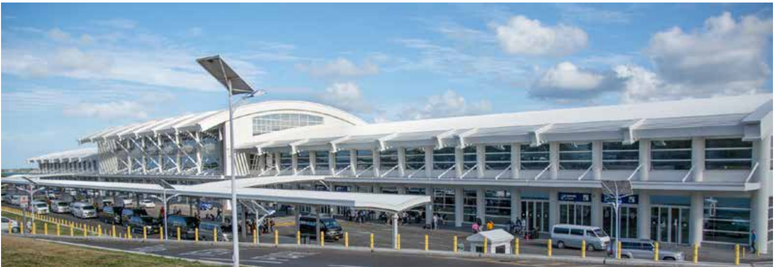
V.C. Bird International Airport