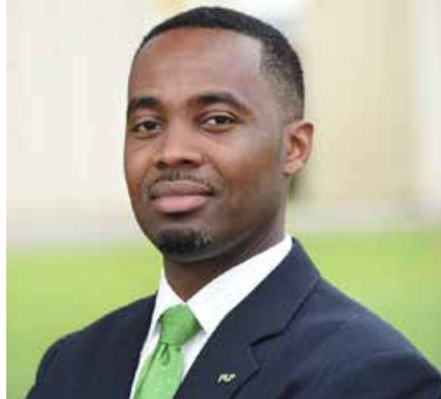
Bermuda Premier David Burt.

coronavirus (COVID-19) pandemic in 2020, the government borrowed funds to "ensure Bermudian families in need could keep their lights on and had food on their tables."