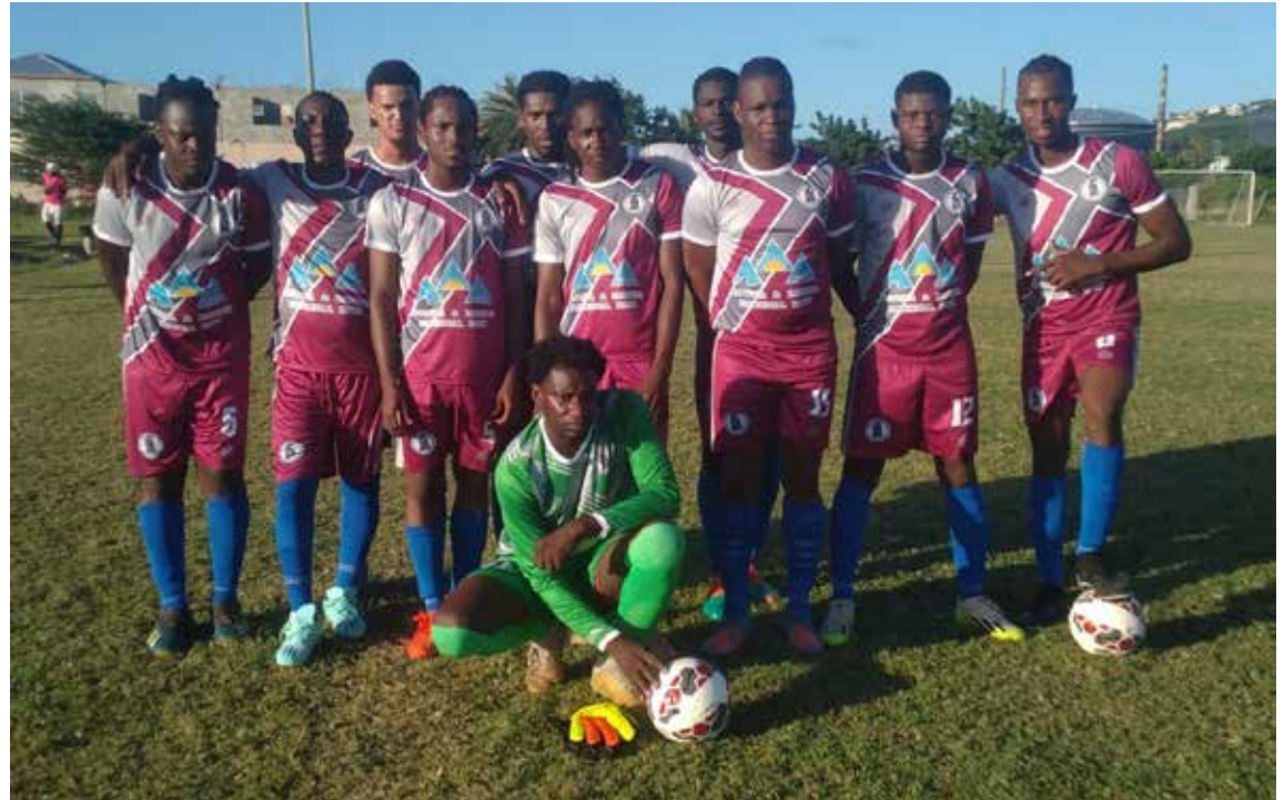
Players of the English Harbour football team. (File photo)

in the 44th and 61st minutes after Devonte Ralph scored Sea View Farms opening goal in the 12th minute.