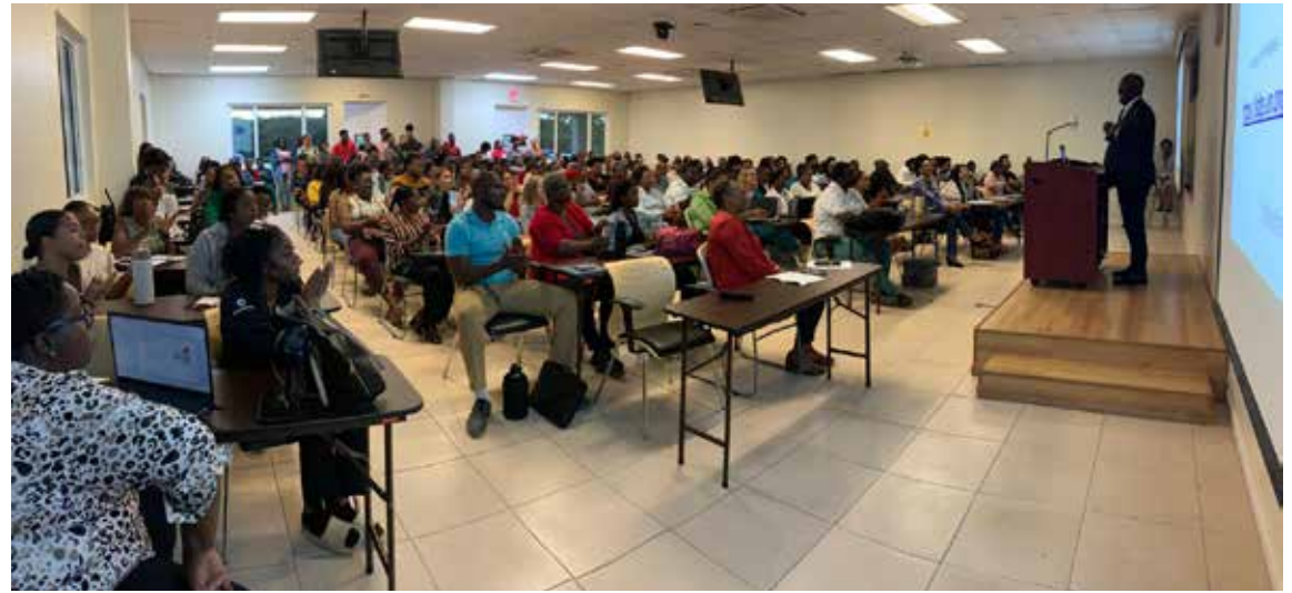
Minister of Foreign Affairs E.P. Chet Greene addressed the participants.

Minister Greene, addressing the eager crowd of prospective volunteers, expressed his deep appreciation for the overwhelming turnout. He commended the