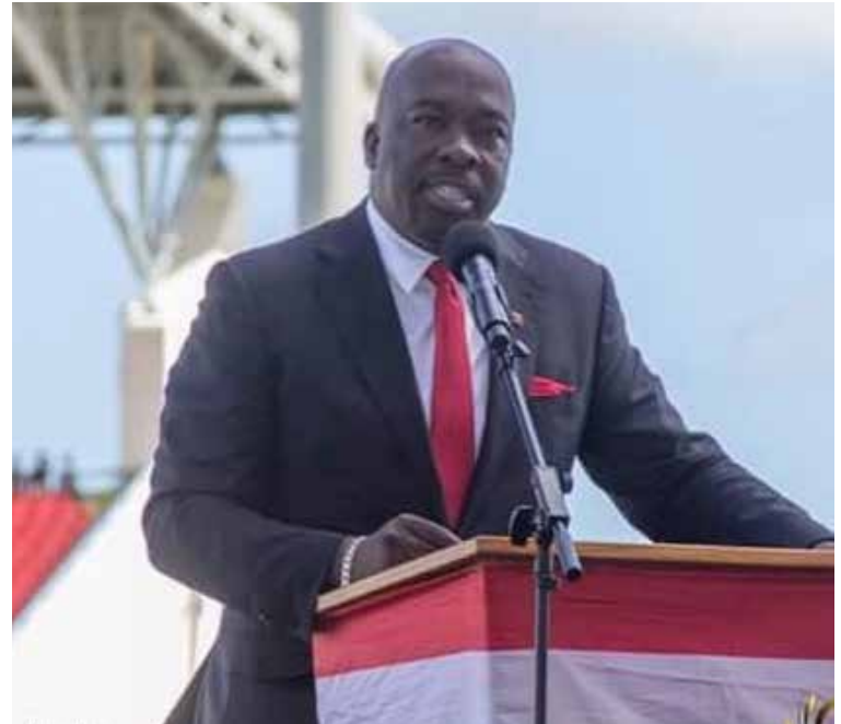
Utilities Minister Melford Nicholas

According to the minister the delay in implementing the increase for residential customers is due to belief that he has which suggests that there should be improvements in the supply of water before charging