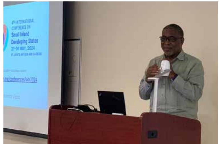
Ambassador Anthony Liverpool, Permanent Secretary of the Ministry of Foreign Affairs, also addressed the gathering.

Moreover, emphasising the inclusive nature of the initiative, Minister Greene stressed the need for all hands on deck, irrespective of economic background, race, gender, or political affiliation. He also announced the Ministry of Foreign Affairs' intention to establish a National Volunteer Corp, aiming to create a pool of skilled and talented individuals ready to provide support at major government events.