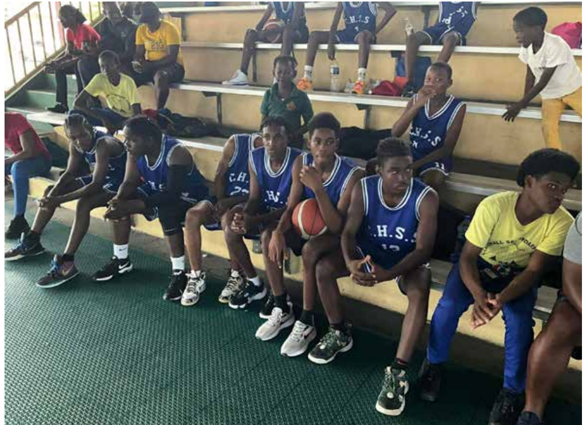
Players of the Clare Hall Secondary School junior boys division basketball team at the JSC Sports Complex.

The first team of the Antigua Grammar School