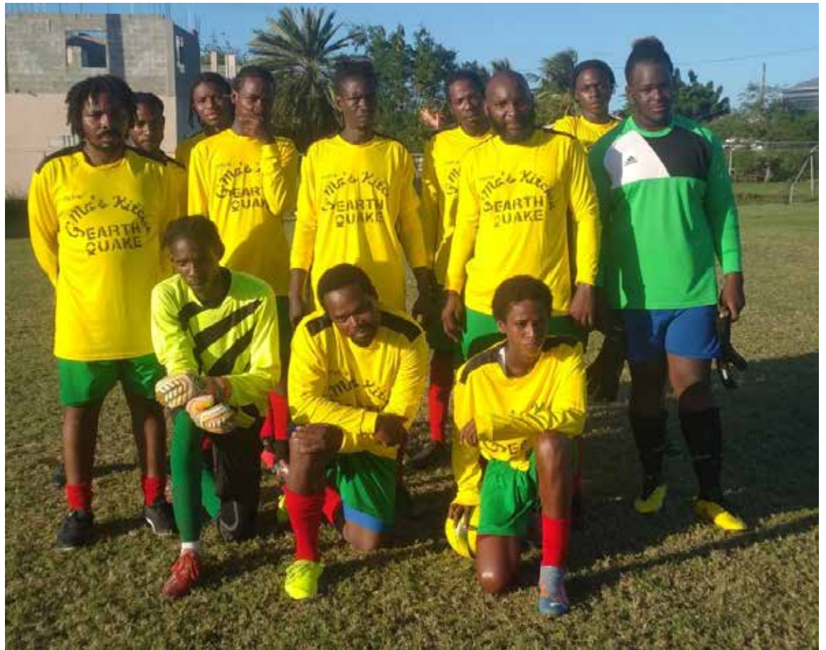
Players of the Earthquakes football team. (File photo)

The result allows the Earthquakes to overtake English Harbour into second place by advancing to 19 points. They moved one point ahead of English Har-