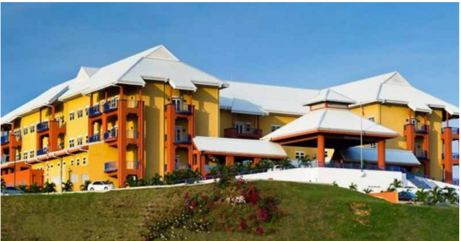
Sir Lester Bird Medical Centre