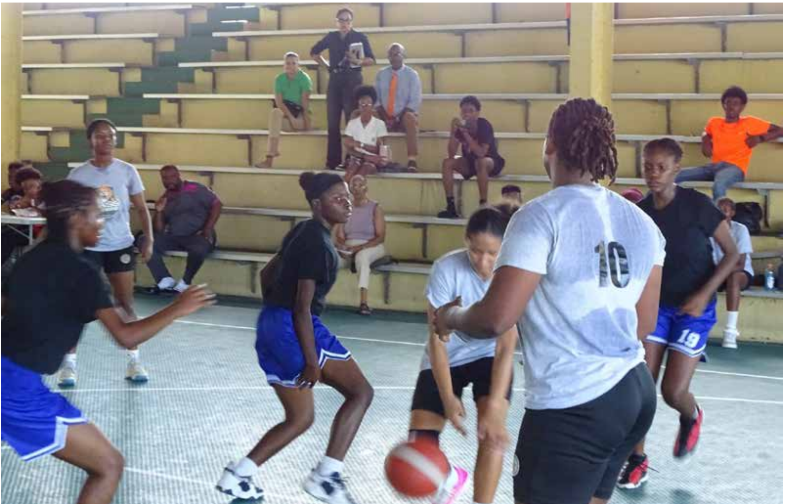
Players of Antigua Girls High School (blue and black uniform) compete against their peers from St. Anthony's Secondary School at the JSC Sports Complex on Tuesday, February 13, 2024.