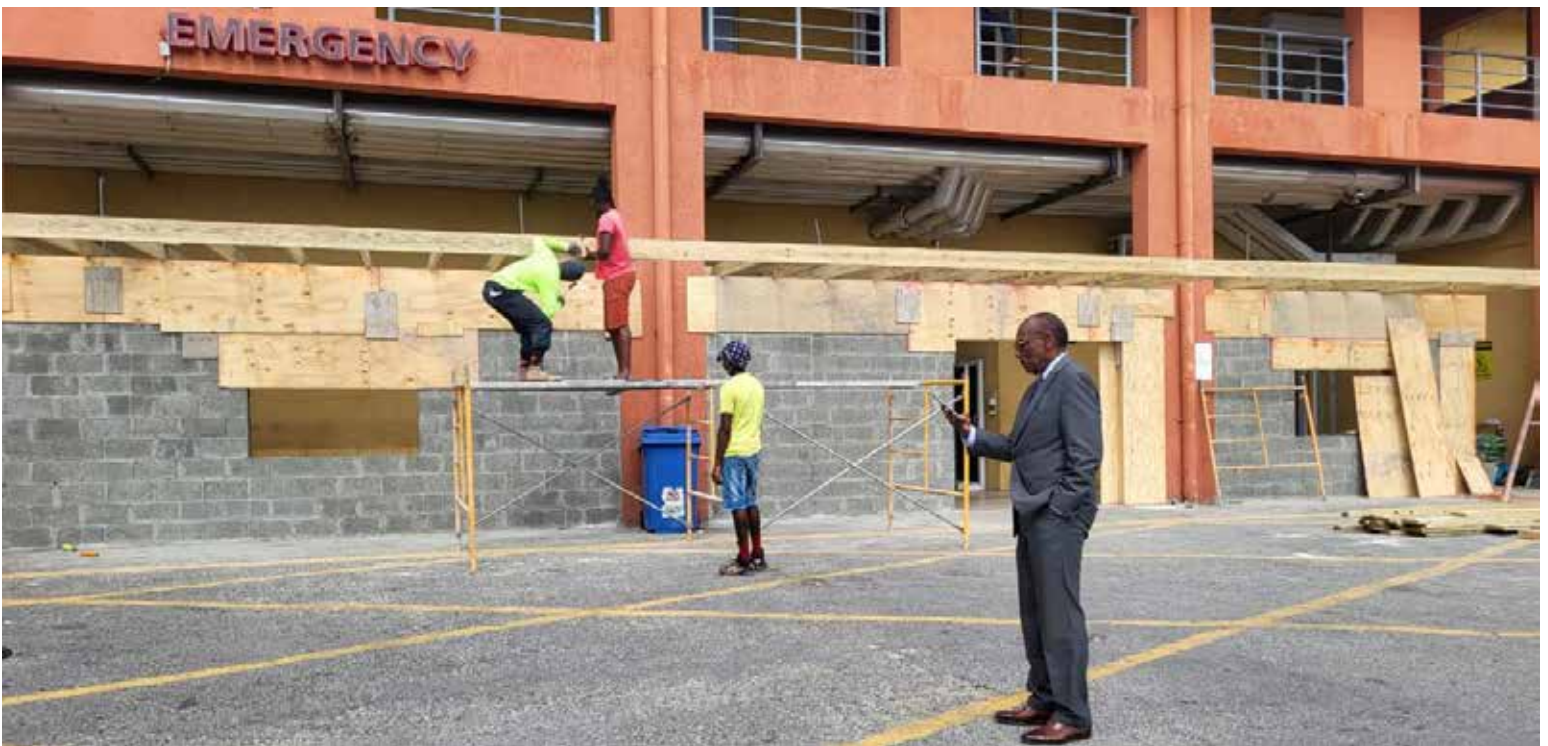
Health Minister Sir Molwyn Joseph continues his monitoring of the ongoing upgrade at the SLBMC.