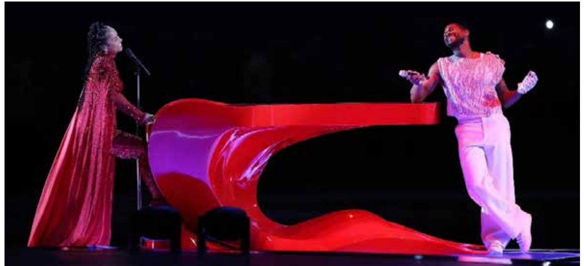
Alicia Keys appeared on stage behind a giant red piano and began performing her hit If I Ain't Got You.

Before his half-time show, Usher admitted it had been "a challenge to squeeze