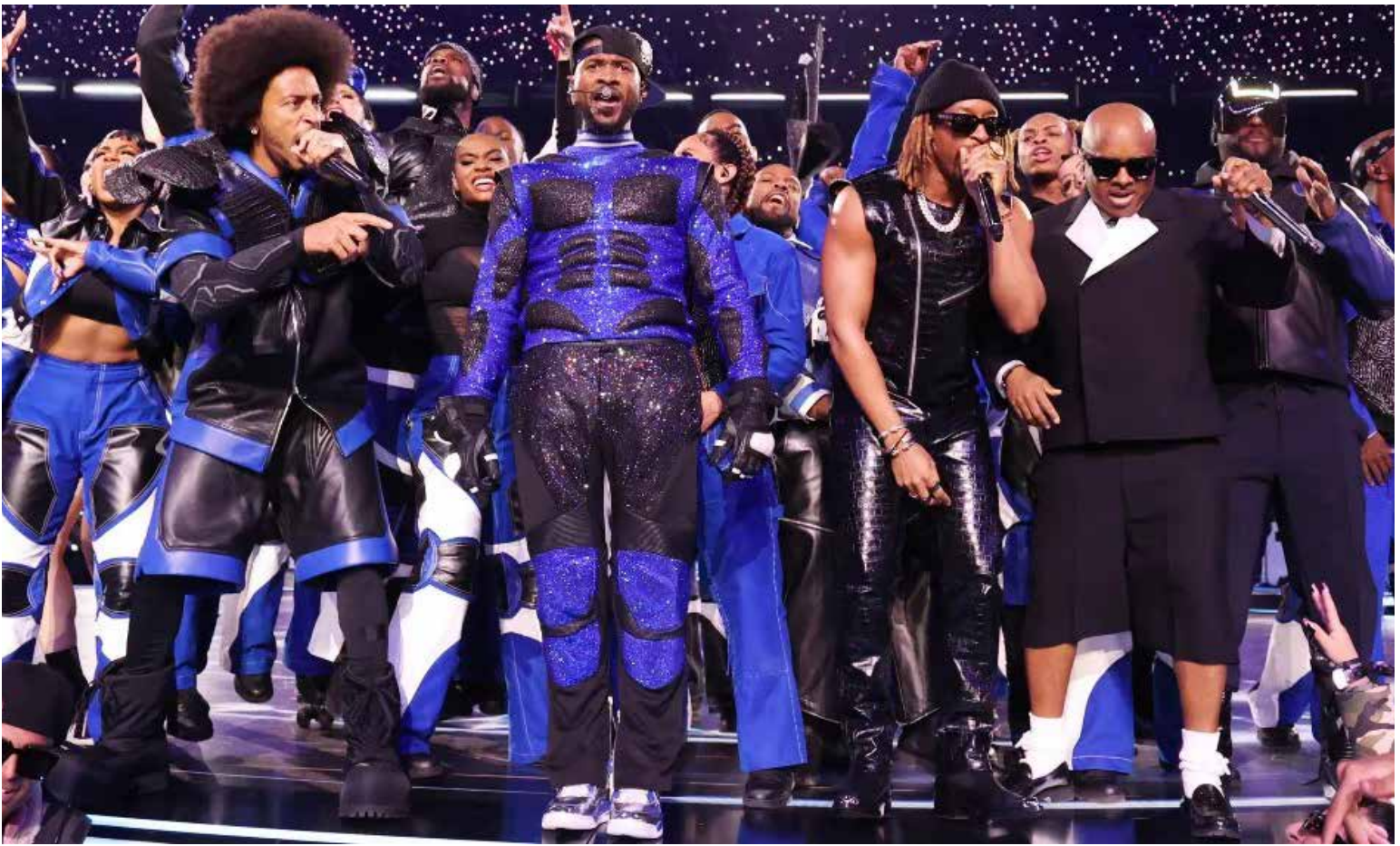
Front row left to right: Ludacris, Usher, Lil Jon and Jermaine Dupri.