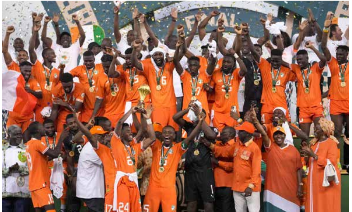
Ivory Coast players celebrate after winning the African Cup of Nations final soccer match between Nigeria and Ivory Coast, at the Olympic Stadium of Ebimpe in Abidjan, Ivory Coast, Sunday, Feb. 11, 2024.

Fans danced and cheered to loud music in the stadium