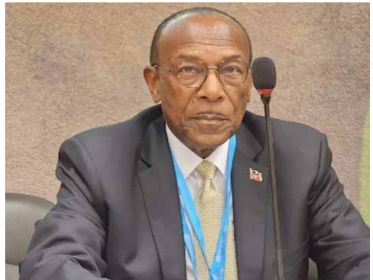
Health Minister, Sir Molwyn Joseph

The minister explained that cervical cancer is primarily caused by the Human papillomavirus (HPV) and that it represents a significant public health challenge that is both preventable and treatable with the right interventions. He stated that the ministry’s strategy is based