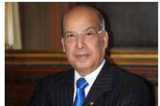
Ambassador Sir Ronald Sanders

More than 27,700 Palestinians have been killed and at least 65,000 injured by the war launched by Israel in response, according to the Hamas-run health min-