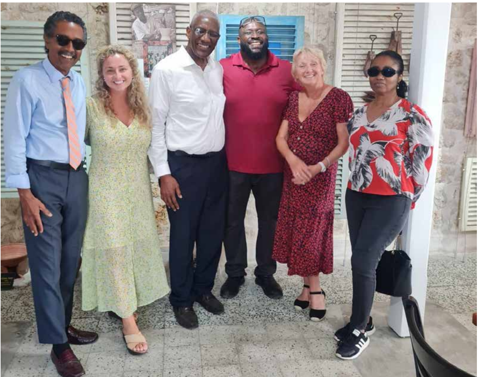
Government House has announced that the 2-acre property is being transformed into a cultural heritage site, managed by The Heritage Trust Antigua and Barbuda (HTAB) Inc. Story on page 7.