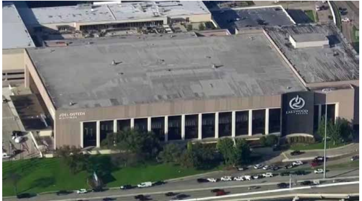
The woman entered one of America’s largest churches on Sunday and opened fire.