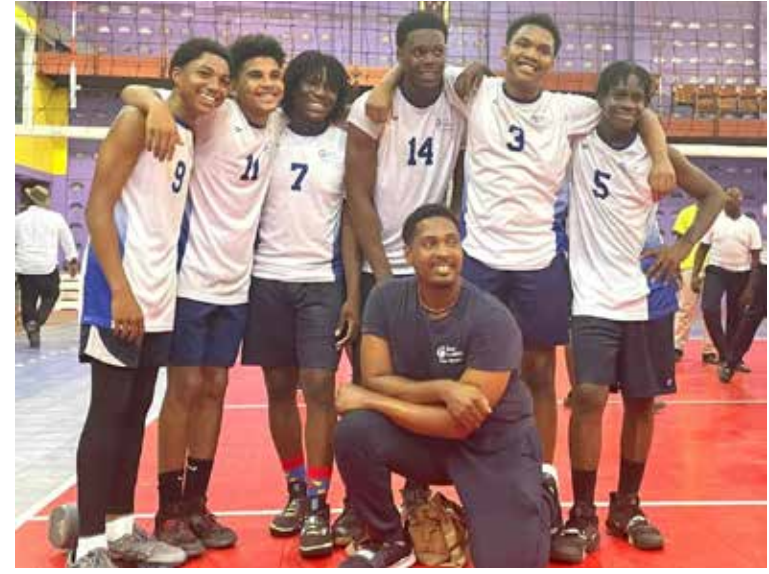
The 2023 school volleyball male division champions, Island Academy. (File photo)

Island Academy will take on Christ the King High School in the female division and will face Ottos Comprehensive in a repeat of last year's male division final. Ottos Comprehensive School finished second and Sir Novelle Richards Acad-