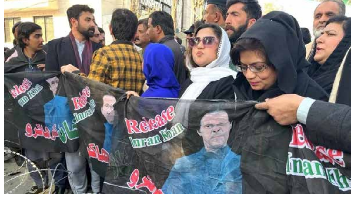
Some demonstrators supporting Imran Khan gathered in the city of Rawalpindi.

As wrangling continues, independent candidates who did not win have flooded