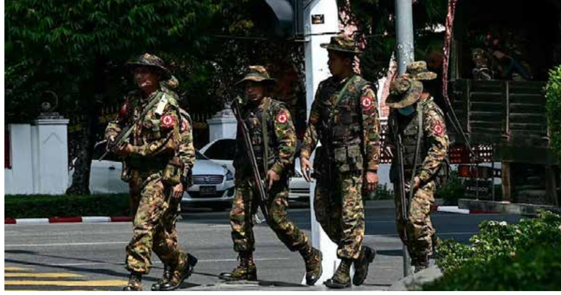
On 1 February, Myanmar entered its fourth year since the coup.

At the end of last year, three ethnic insurgent armies in Shan State - supported by other armed groups that op-