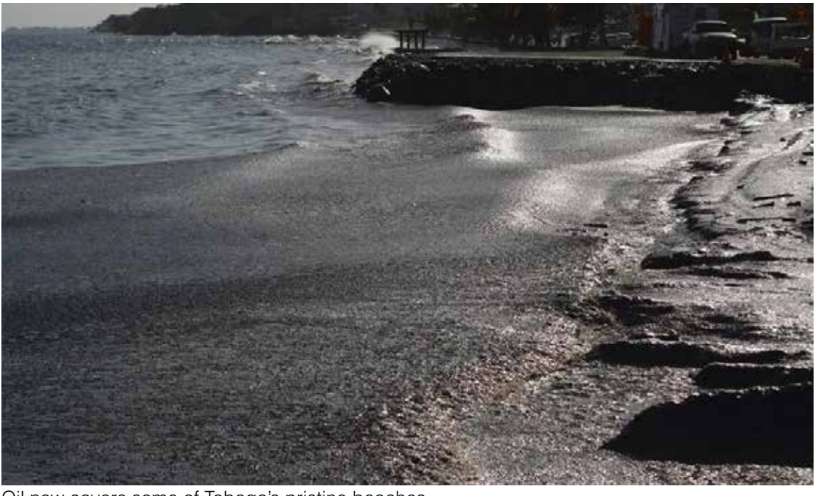
Oil now covers some of Tobago's pristine beaches.

"Everything indicates that we are going in that