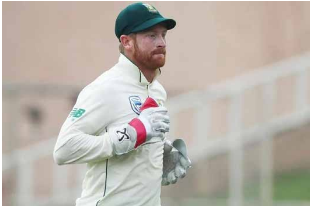
South Africa wicketkeeper-batter Heinrich Klaasen

"After a few sleepless nights wondering if I am making the right decision, I have decided to retire from red-ball cricket. It's a difficult decision that I have made because it is by far my favourite format of the game," Klaasen