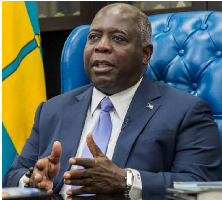
Bahamas Prime Minister, Phillip Davis (File photo)

try was now looking to the RBPF “in these trying times.