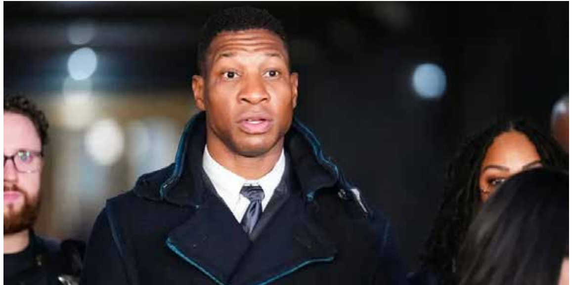
Jonathan Majors is awaiting sentencing for his assault and harassment conviction.

"Based off the evidence, based off the prosecution's evidence, let alone our evidence, how is that possible?" he told the Good