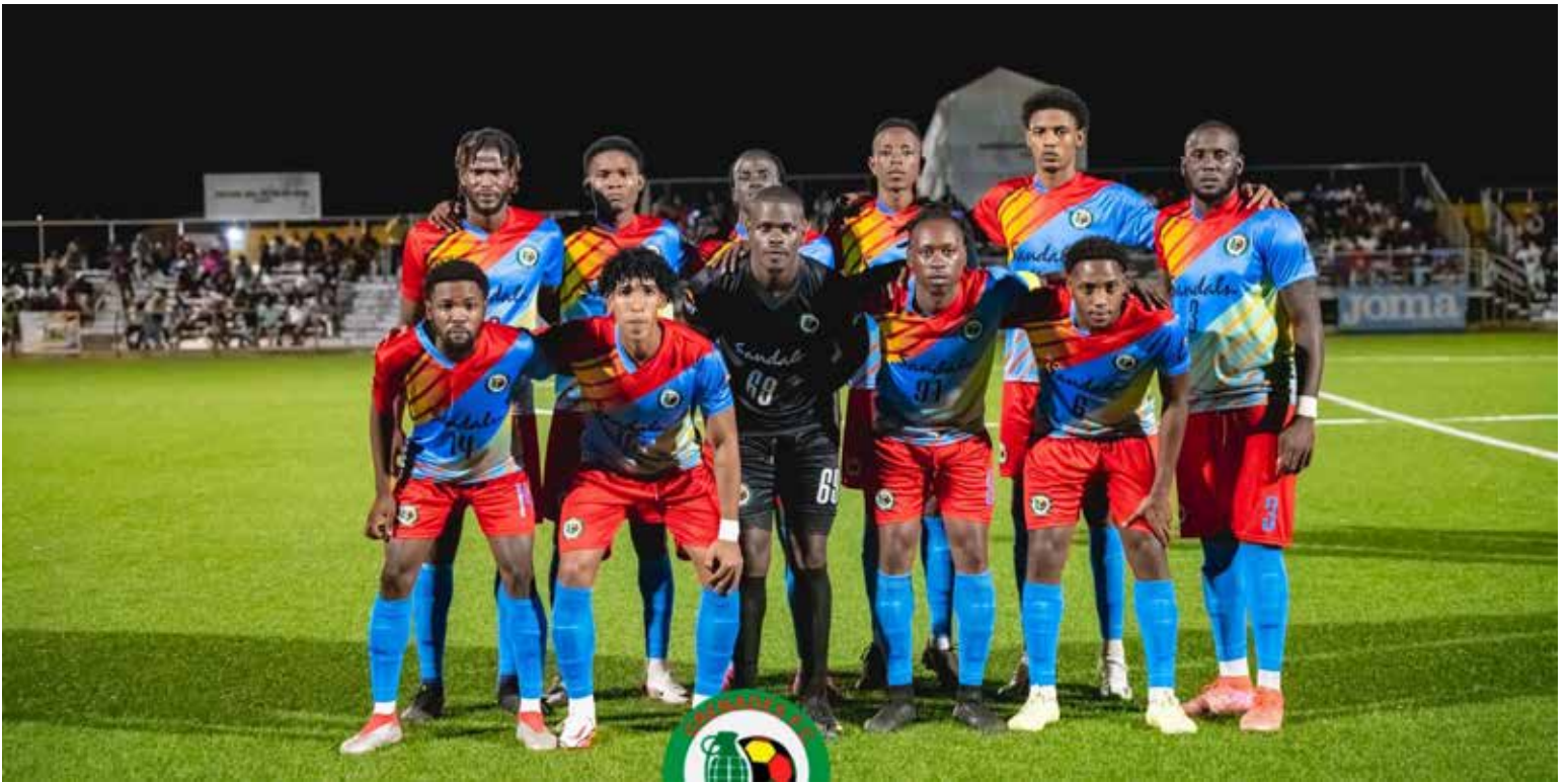
Players of the Sandals Inet Jennings Grenades football team. (File photo)