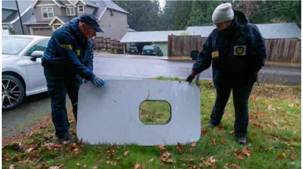
Agents from the National Transportation Safety Board have recovered the plane’s door plug.

“We have been able to operate some planned flights by switching to other aircraft types, avoiding about 30 cancellations each on Monday and Tuesday,” United added.