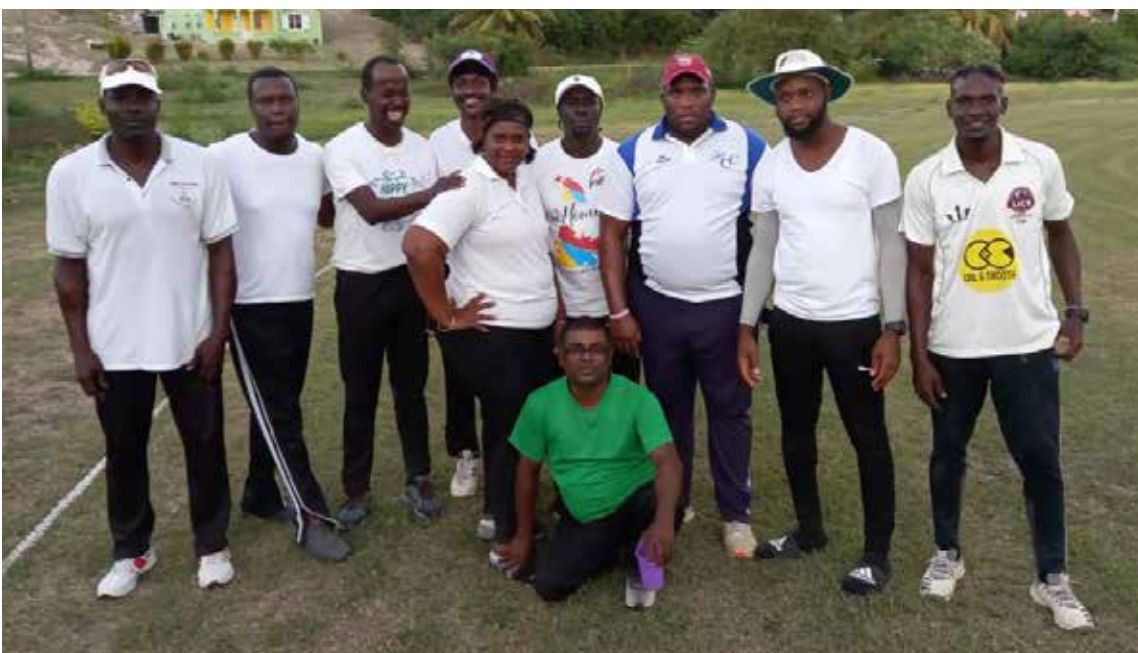
Grill Box softball cricket team