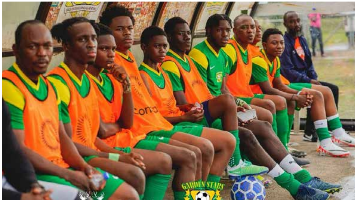
Some players of the Garden Star team sit on the bench during a match in the Premier League at the ABFA Technical Center.

The win carries All Saints United to 13 points, while John Hughes remain on seven points after los-