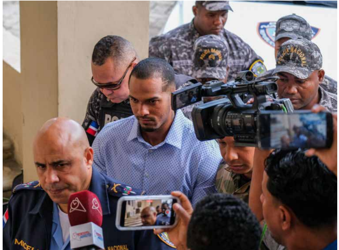
Tampa Bay Rays shortstop Wander Franco, centre, is escorted by police to court in Puerto Plata, Dominican Republic Friday, January 5, 2024.

The 22-year-old All-Star is accused of commercial sexual exploitation