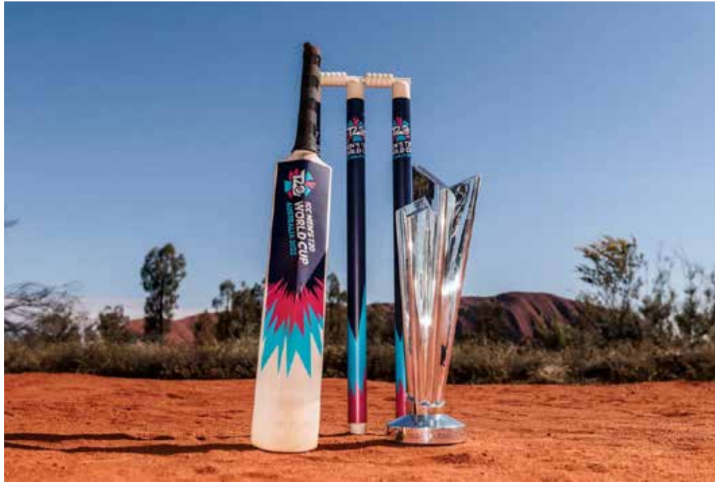
The T20 World Cup Trophy is pictured during the ICC Men's T20 World Cup Tour at Uluru, Australia, on August 9, 2022.

The 20 teams have been divided into four groups of five, with the top two teams progressing to the Super Eights. Group A comprised India, Pa-