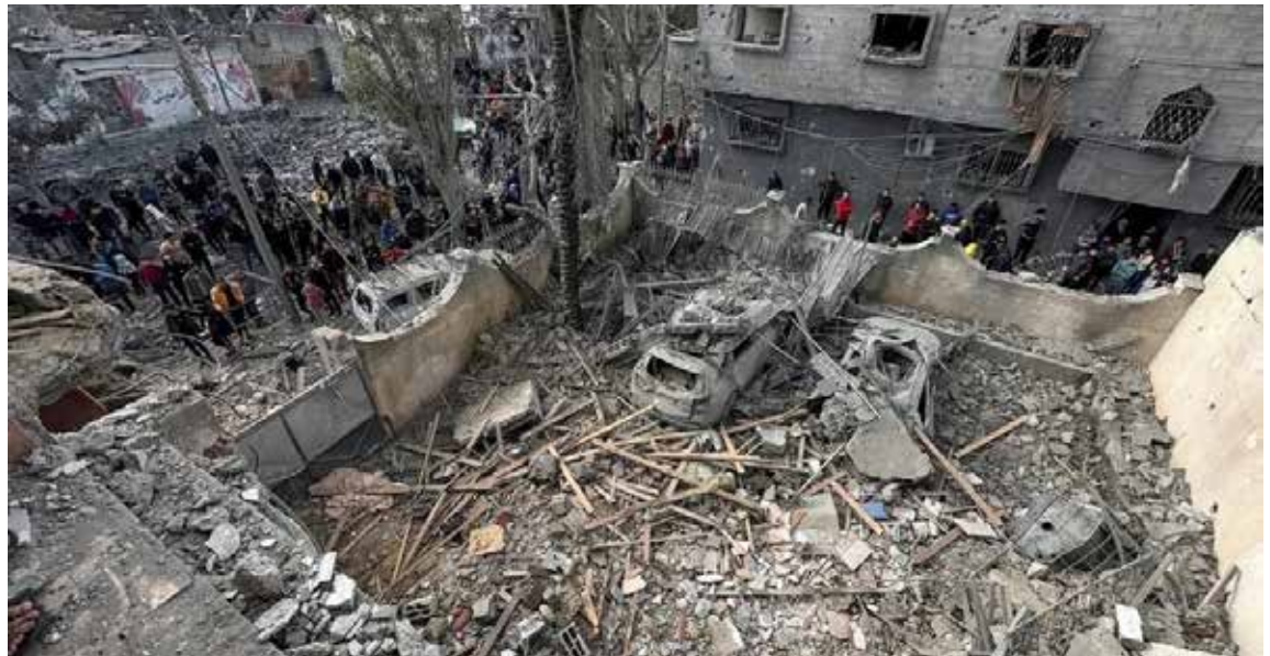
Much of northern Gaza has been reduced to rubble.

On Saturday, US Secretary of State Antony Blinken