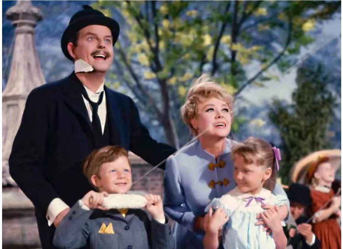
Glynis Johns in Mary Poppins as suffragette mother Winifred Banks.

She also won a Tony Award in 1973 for playing Desiree Armfeldt in Stephen Sondheim’s Broadway musical A Little Night Music , in which she sang