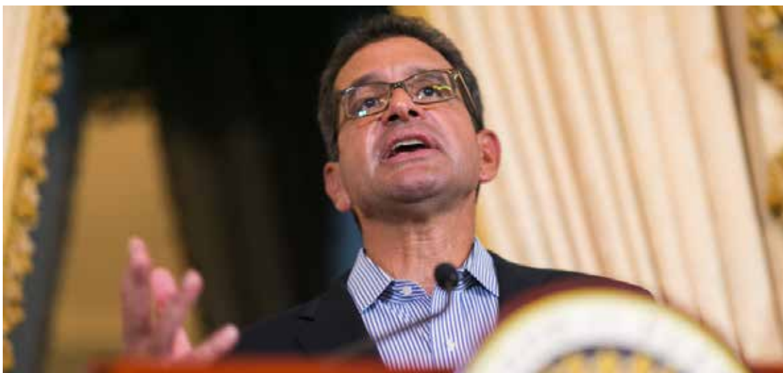
Puerto Rico Governor Pedro Pierluisi gives a press conference in San Juan, Puerto Rico, August 6, 2019.

The Puerto Rico governor's office must stop using the slogan "Making things happen" to promote the administration's work because it looks like election campaigning, election officials said Wednesday.