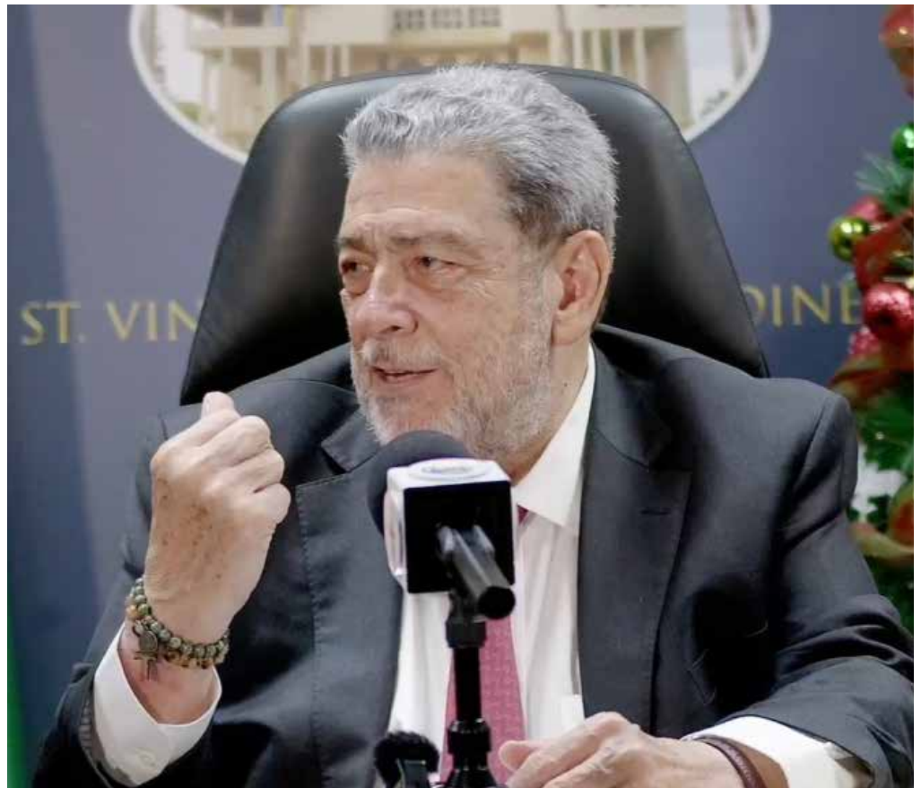
Prime Minister Dr Ralph Gonsalves.

attendant on this controversial issue; and from time-to-time there will be flare-ups."