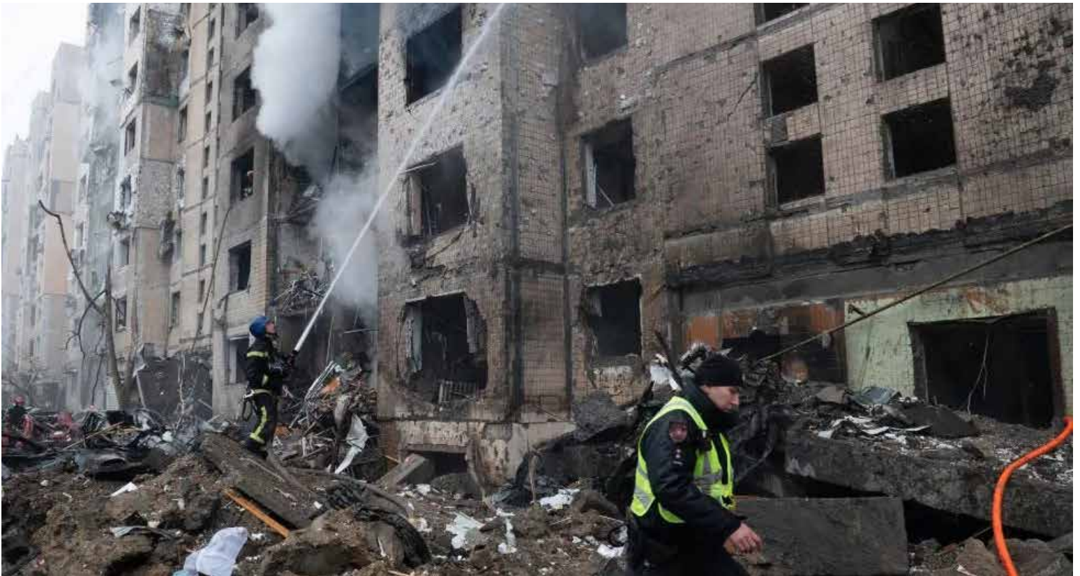
Ballistic missiles launched by Russia hit Ukraine's capital Kyiv on 2 January.