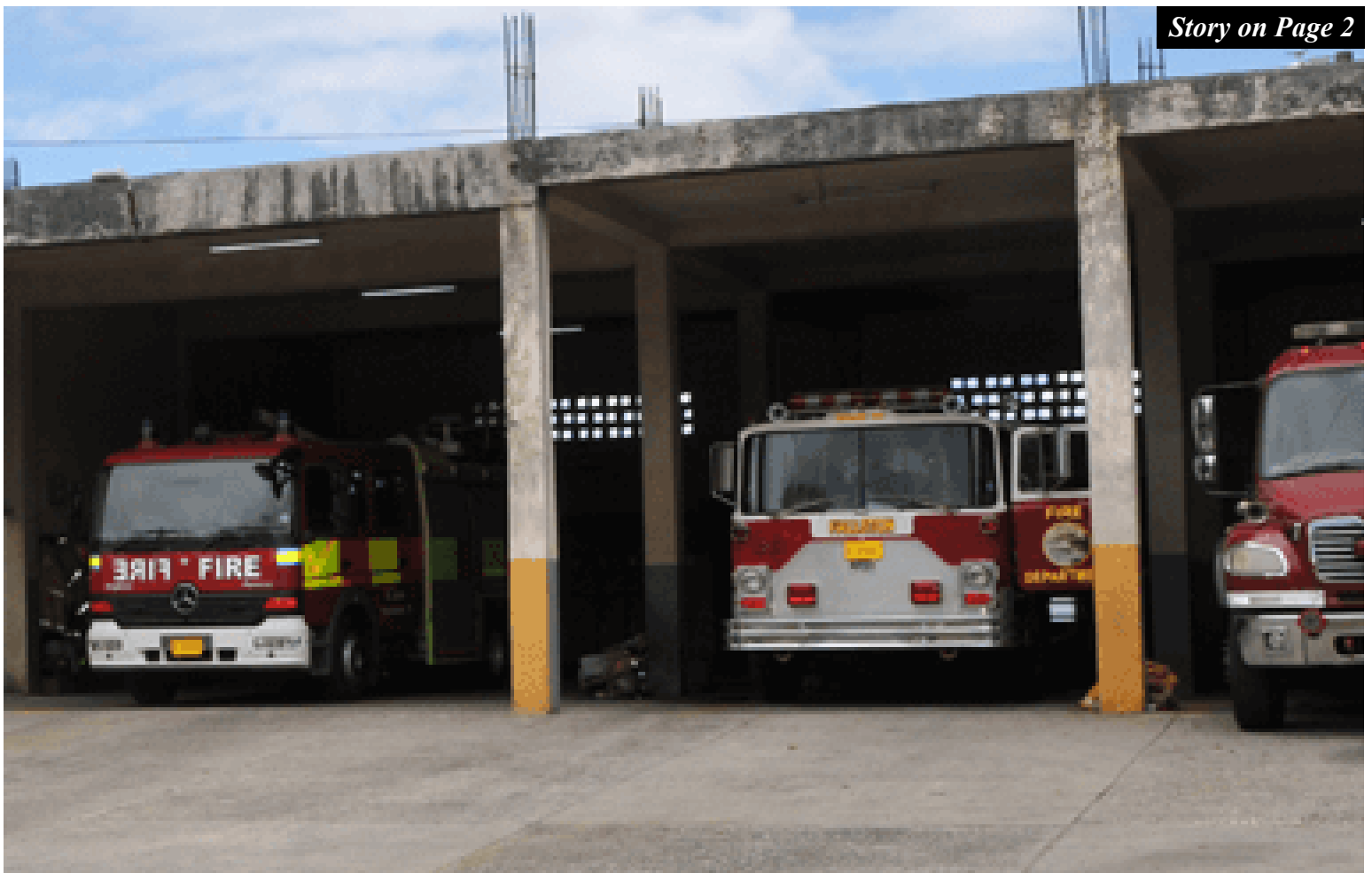
Fire trucks parked at the St. John's Fire Station.