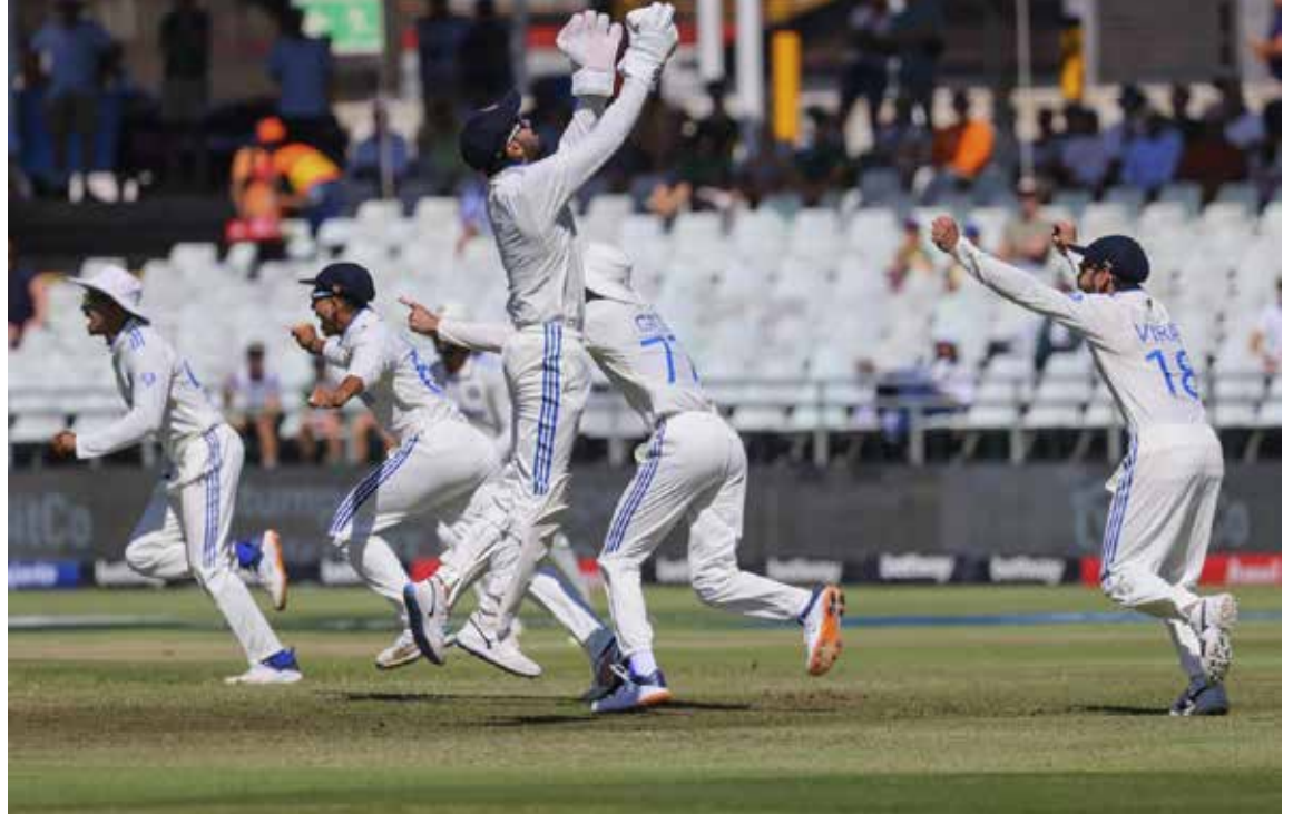
India celebrates the wicket of South African batsman David Bedingham during the second day of the second Test match between South Africa and India in Cape Town, South Africa, Thursday, Jan. 4, 2024.

But India seamer Jasprit Bumrah took six for 61 as the tourists bowled South