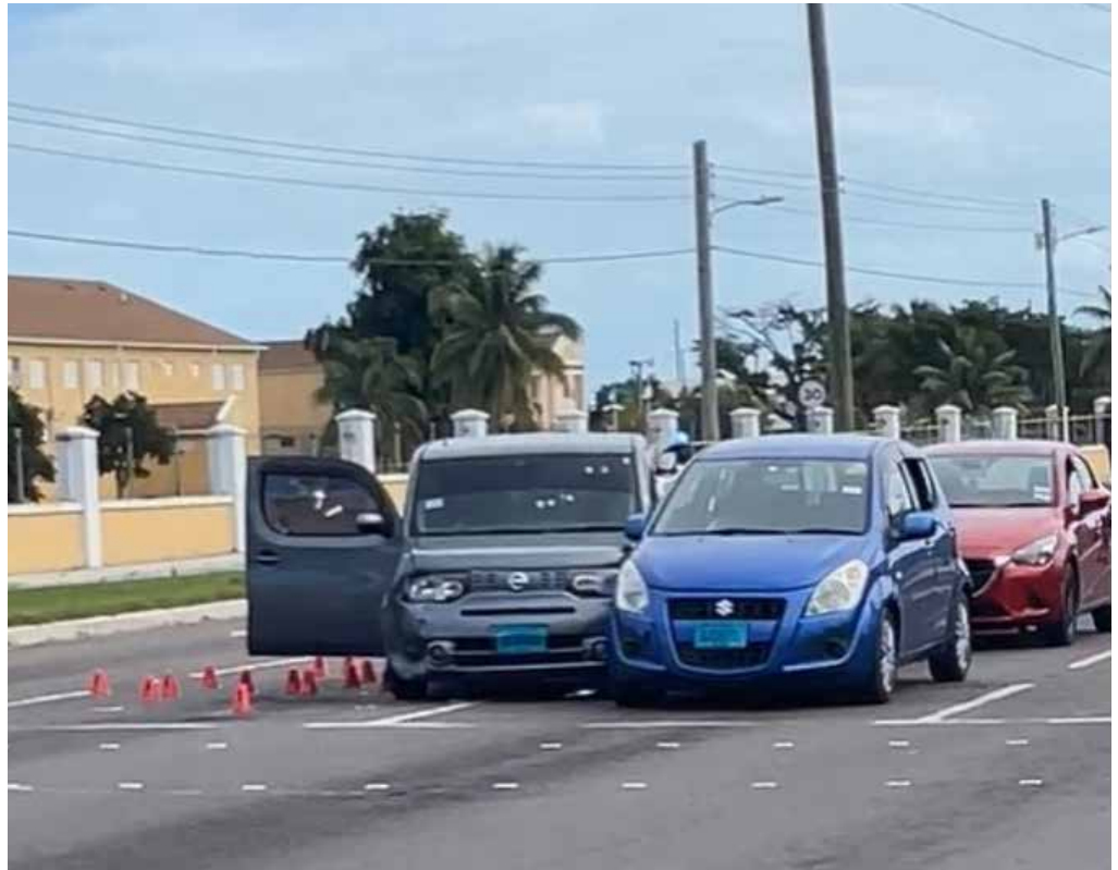
Investigators collect evidence at the scene of The Bahamas' first double murder for 2024.

Police said the victims were shot multiple times and they died on the