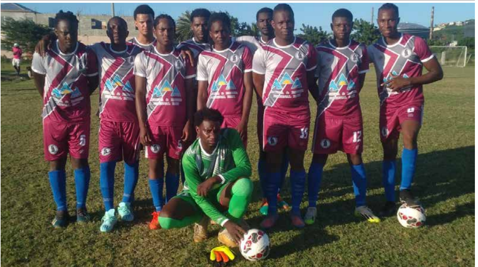
Players of the English Harbour football team. (File photo)