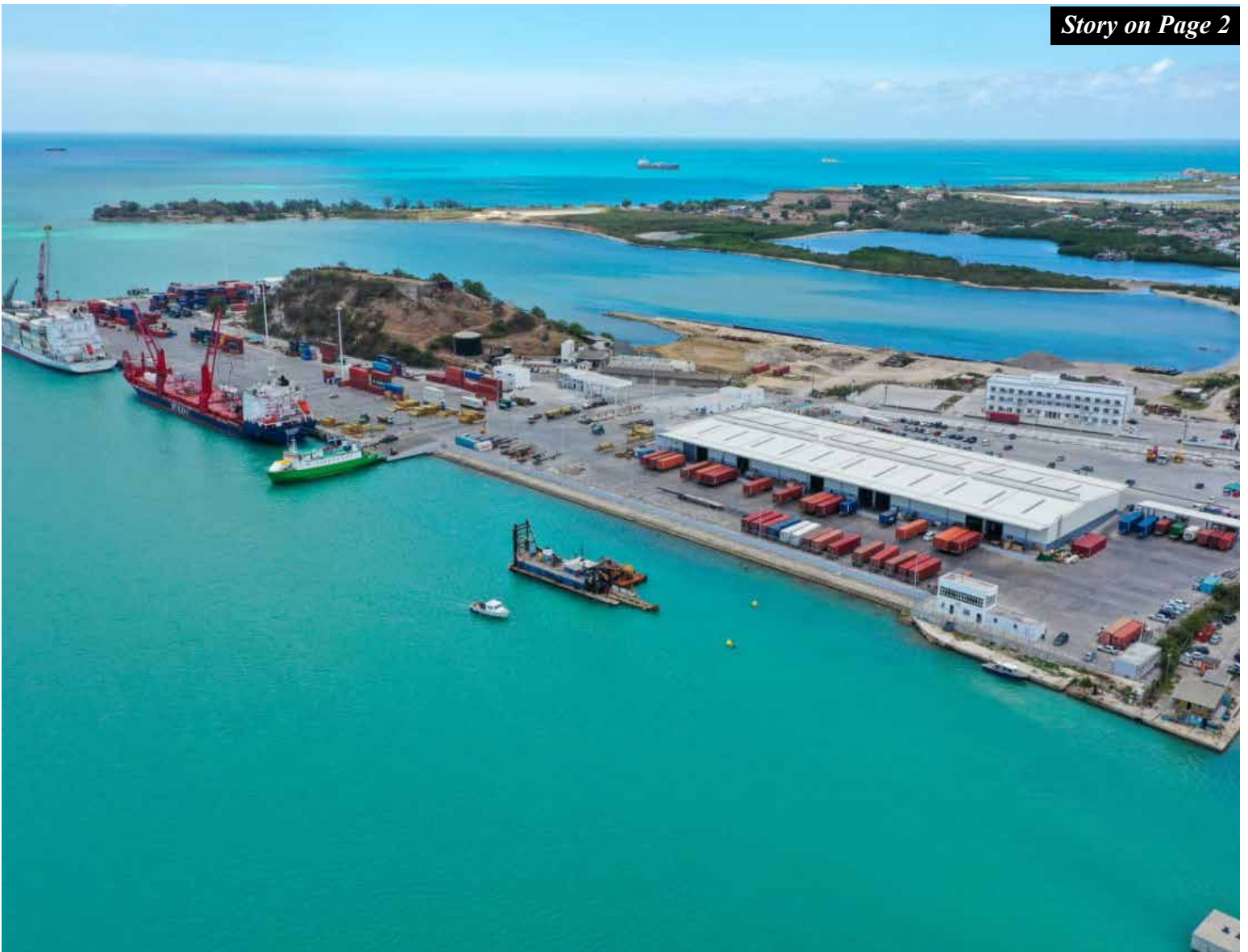
The port complex at Deep Water Harbour