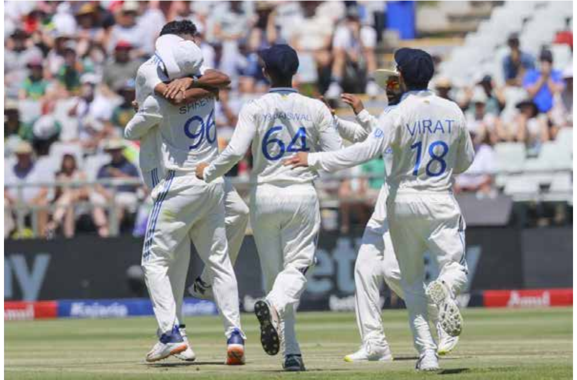
Indian bowler Mohammed Siraj, left, celebrates with teammates after taking a wicket of a South African batsman during the second Test match between South Africa and India in Cape Town, South Africa, Wednesday, Jan. 3, 2024.

South Africa lost captain Dean Elgar twice in the day before his retirement, which he announced ahead of the