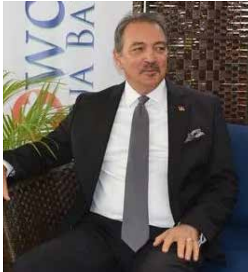
Tourism Minister, Charles Fernandez public yet.

Details of the agenda for the meeting or the number of delegates that is expected have not been made