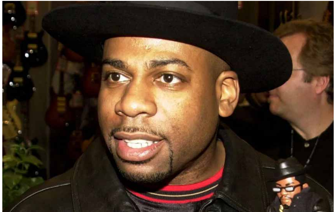
Jam Master Jay's murder shocked the music world in 2002.

They spoke against drug culture, even recording a “Just Say No” public service announcement in 1988. But prosecutors said Mizell had become involved as a middle man in cocaine deals to support