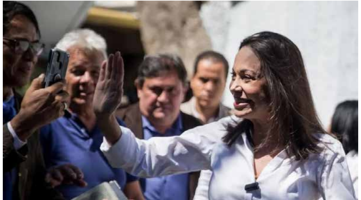
María Corina Machado says she will stand firm and continue to fight the ban which bars her from running for president.

Shortly after the deal was reached in Barbados, the US Treasury issued a licence temporarily allowing transactions involving Venezuela's oil and gas sector.