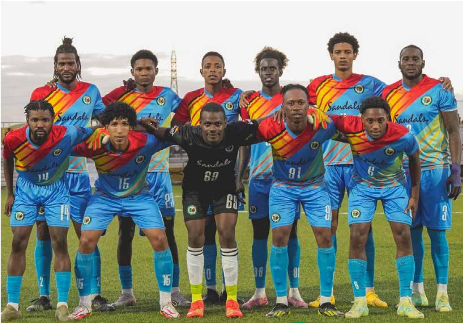
Players of the Jennings Grenades football team. (File photo)