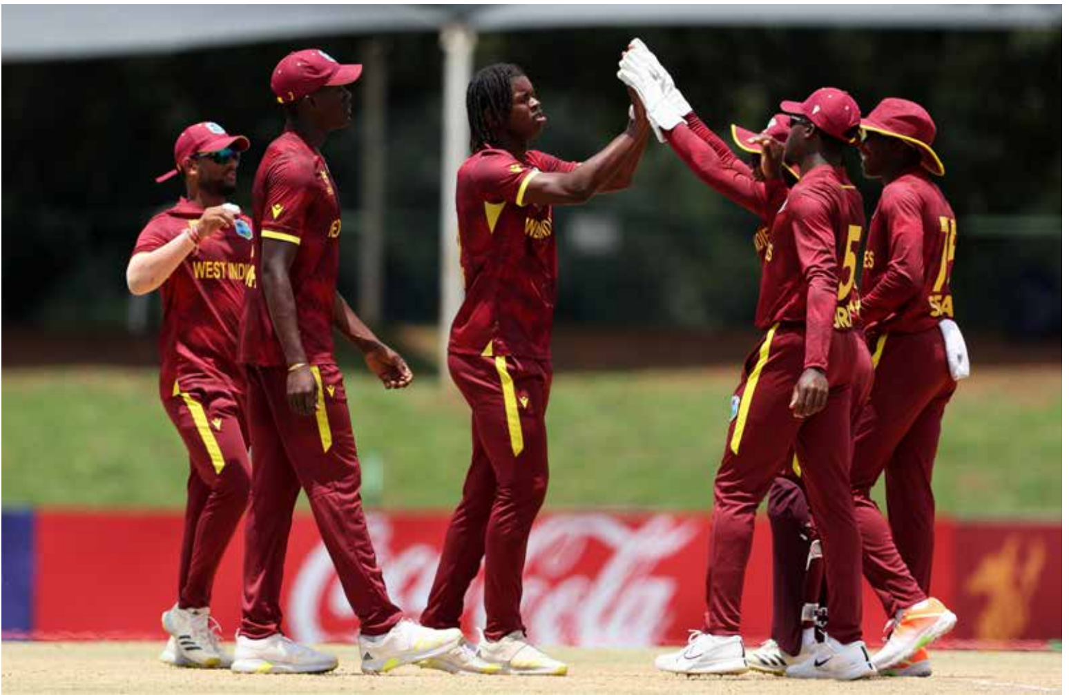
Players of the Young West Indies team at the 2024 ICC Under-19 Men's World Cup in South Africa.