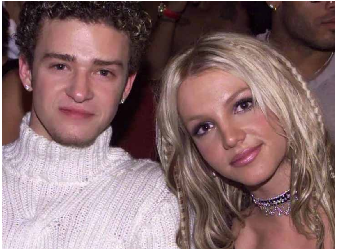
Britney Spears and Justin Timberlake dated in their late teens.

Spears dated the NSync singer from 1999,