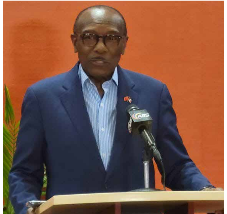
Health Minister, Sir Molwyn Joseph exclaimed.

"They have the equipment that gives them that capacity, not only for diabetes but for cancer screening. There is a new technology which we were fully exposed to, where dealing with cancer would be like dealing with a vaccine. They are saying that they are working on a vaccine that can prevent cancer. Not only that, they are giving the body the ability to fight cancer," he