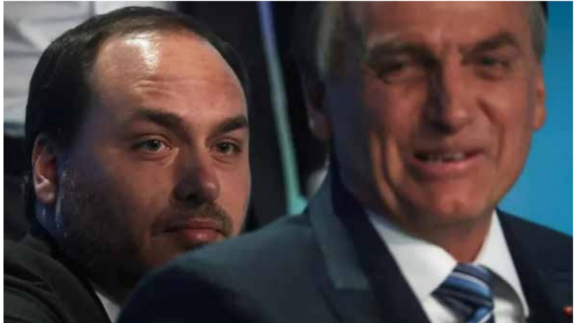
Carlos Bolsonaro, seen here behind his father, was Jair Bolsonaro's confidante.

home and offices of Alexandre Ramagem - the former head of Abin and a close ally of Jair Bolsonaro - on Thursday.