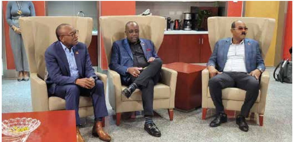
Foreign Affairs Minister, E.P Chet Greene, centre.

“Having a physical presence in China means that Antigua and Barbuda traders as well as business between Antigua and Barbuda and China should see a difference in terms of positive growth. Opening the embassy means that nationals who are doing business