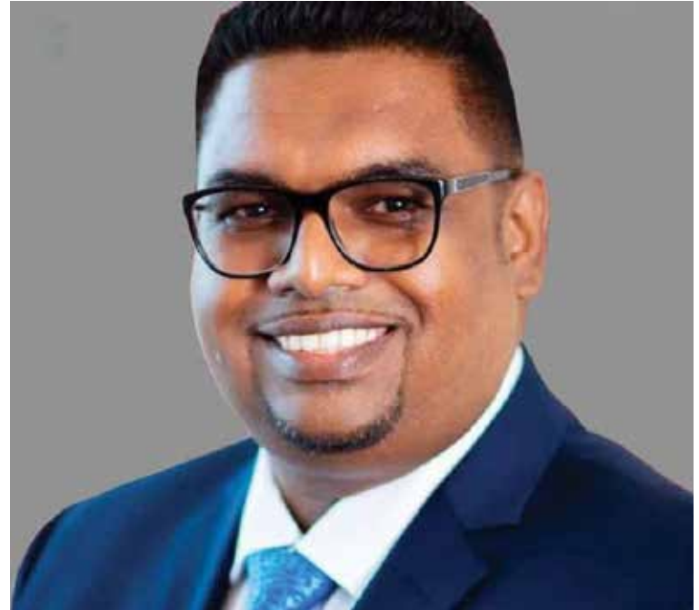
President of Guyana, Dr Irfaan Ali.