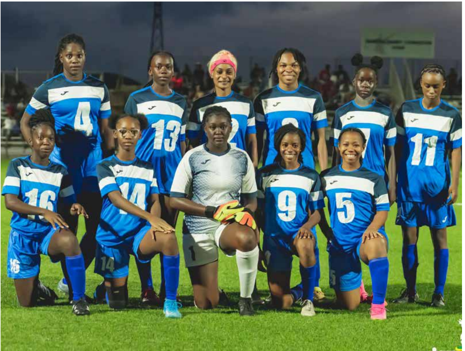
Players of the Fort Road women's football team. (File photo)