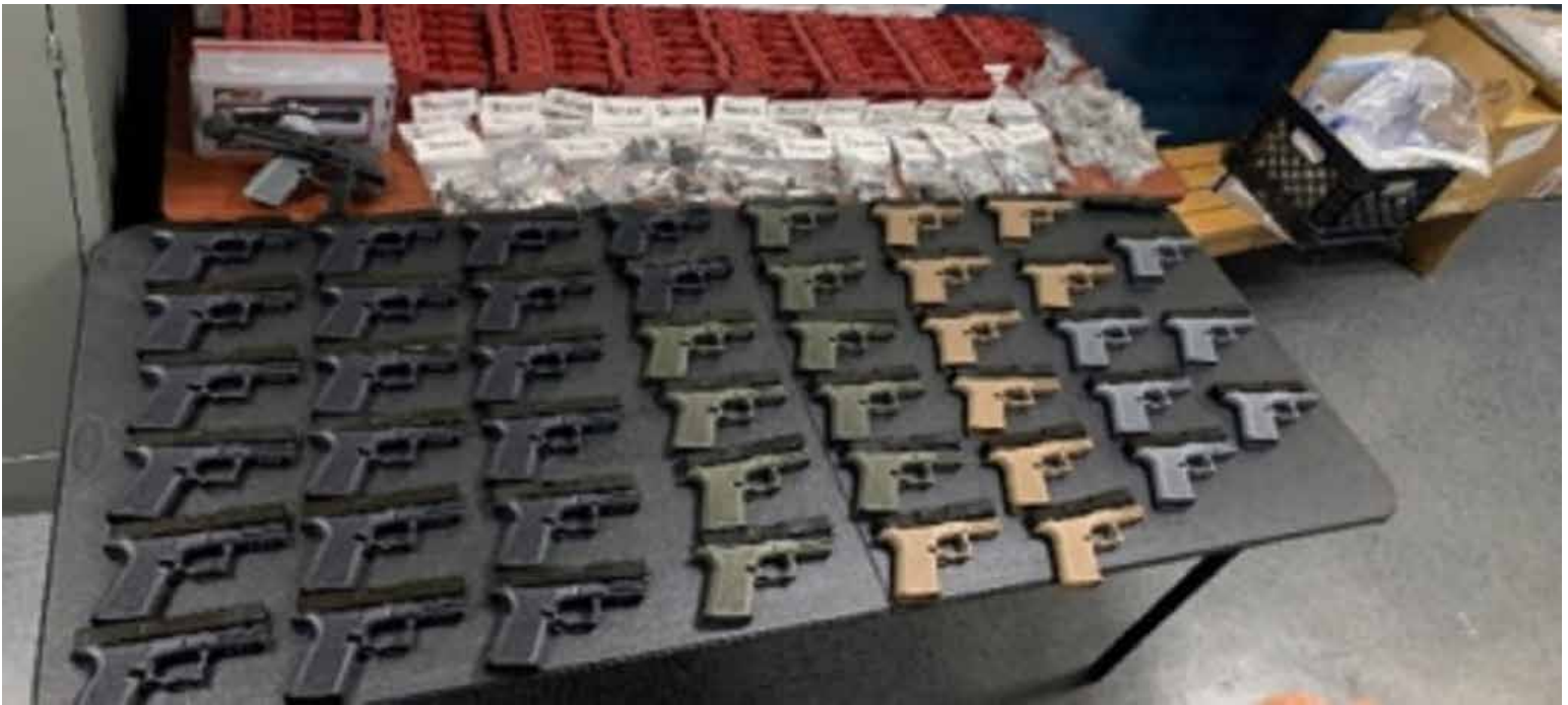
Ghost guns