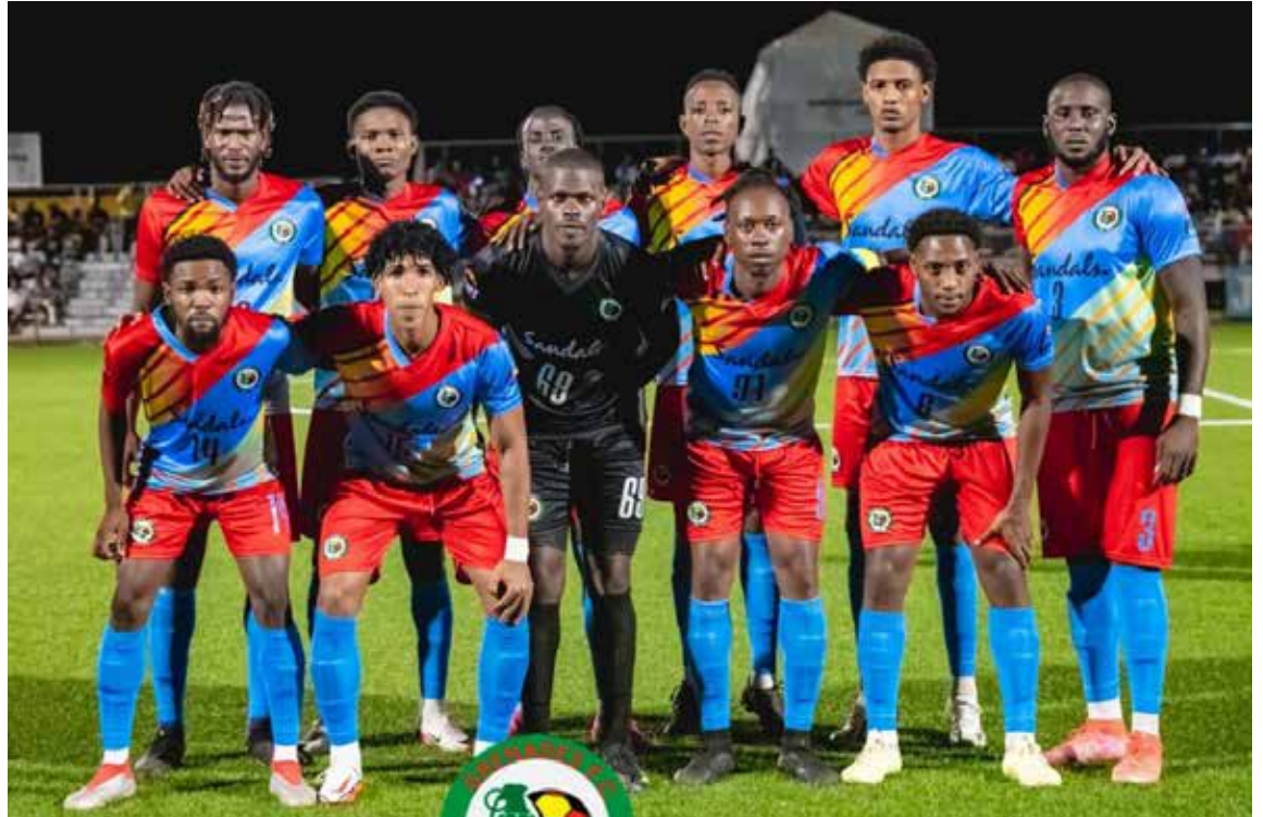
Players of the Sandals Inet Jennings Grenades football team. (File photo)