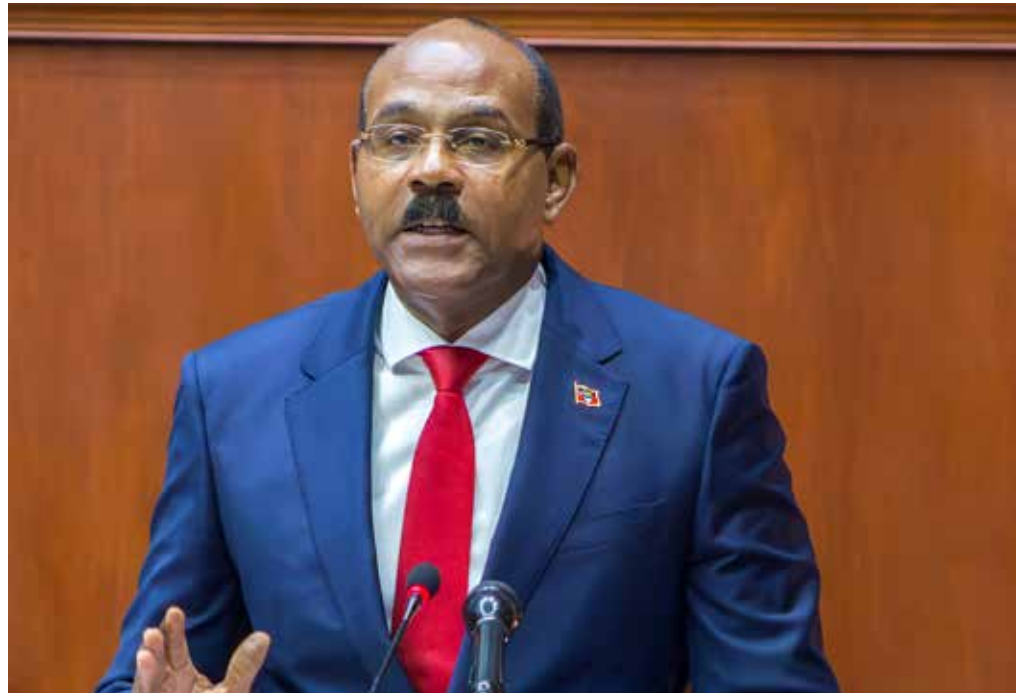
Prime Minister Gaston Browne

The prime minister pointed to the several tourism projects that are in the pipeline ready to start this year and which are expected to provide the impetus for continued growth especially in the critical construction