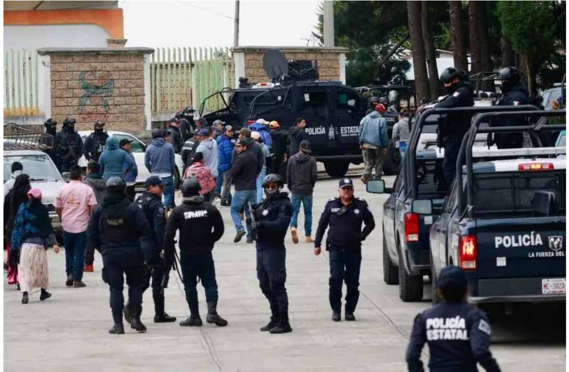
Hundreds of police have been deployed to Texcapilla after the deadly incident.

Gang members demanded that farmers pay a fee to the group for every square metre of the fields