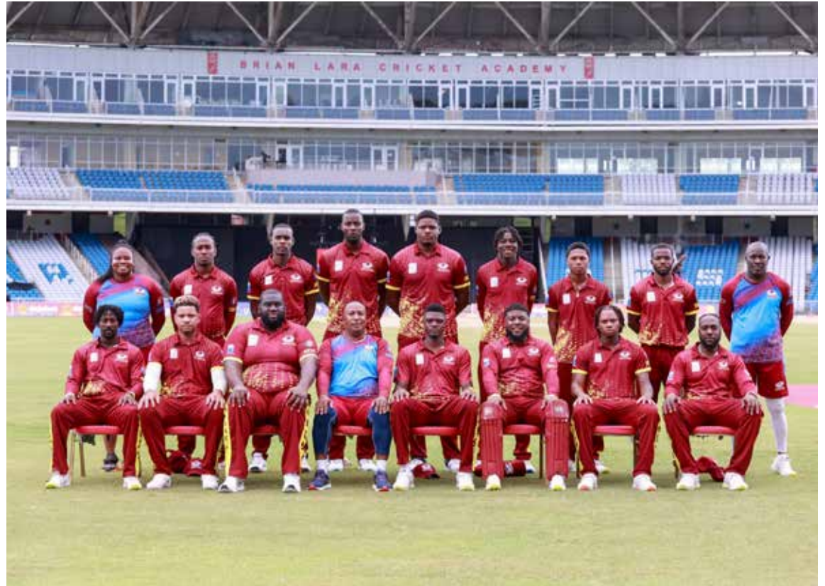
The Leeward Islands Hurricanes squad which claimed the runners-up spot at the 2023 regional CWI Super50 Cup one-day tournament in Trinidad.

However, the LICB said "the plan will take place at the start of the second quarter of 2024. The Hurricanes will continue to train and play matches in St. Kitts, to include the start of the CWI 2024 4-Day Tournament."