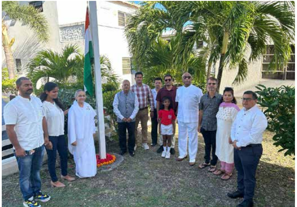
Indians in Antigua and Barbuda mark the 75th anniversary of that country's independence

Congratulations were conveyed by Prime Minister, Gaston Browne to Prime Minister Narendra Modi, reaffirming Antigua and Barbuda's strong commitment to its relationship with In-