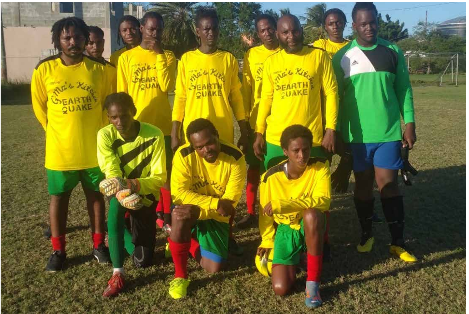
Players of the Earthquakes football team. (File photo)