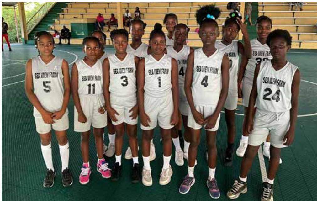
The Sea View Farm Primary School's Minigirls Primary Division basketball team.