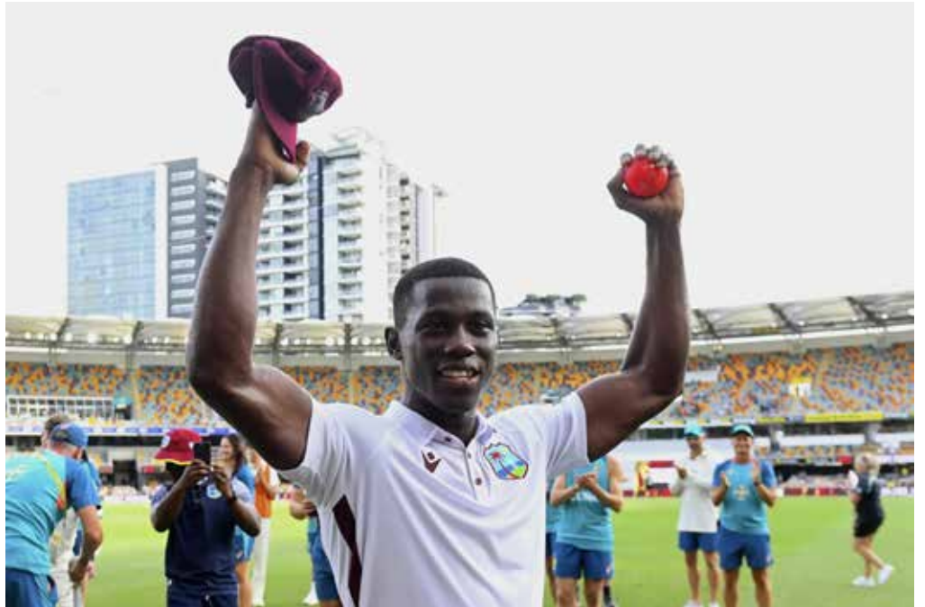
West Indies' Shamar Joseph raises the ball after taking seven wickets in his team's defeat of Australia on the 4th day of the second cricket Test match in Brisbane, Sunday, Jan. 28, 2024.

It was Australia's first loss in 12 pink ball Tests. The West Indies, who arrived in Australia with a weakened and inexperienced squad, were given little hope of getting anything out of