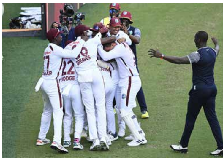
West Indies players celebrate after defeating Australia on the 4th day of the second cricket Test match in Brisbane, Sunday, Jan. 28, 2024.

Resuming from 33 overnight, Smith continued to accumulate while Starc opted for aggression, blasting a 14-ball 21 before presenting debutant Kevin Sinclair at backward point his third catch for the game.