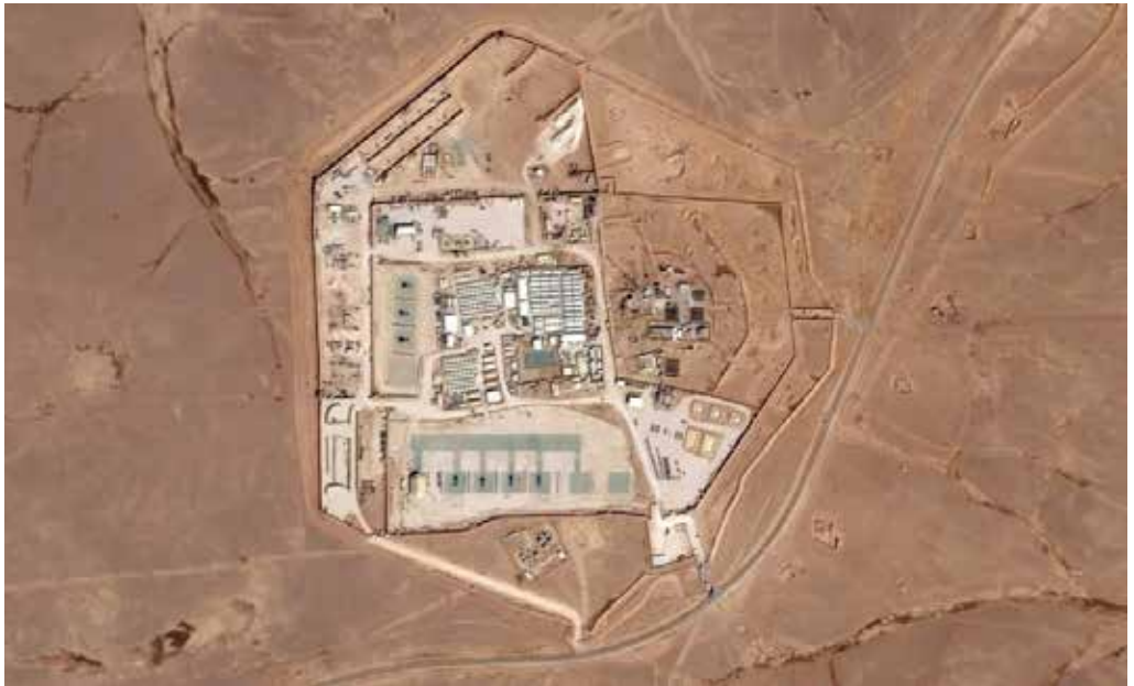
The attacked base was named by US officials as Tower 22.

US officials say at least 34 military personnel were being evaluated for possible traumatic brain injury, and that some of the injured soldiers were medically evacuated from the base for further treatment.