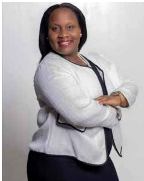
Sen. Kiz Johnson

For her, this is a major challenge. "The only challenge with this role is that there is still a perception that the Independent Senator is not really "independent" by virtue of the fact that I am the Governor General's appointee and the Governor General is himself