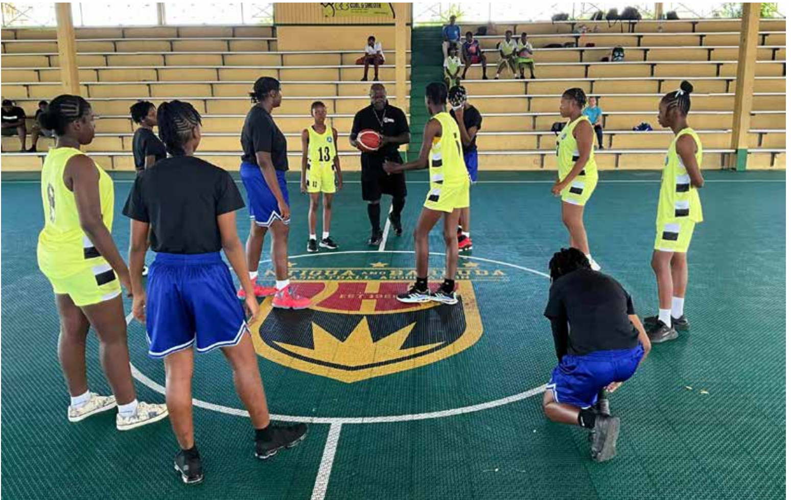
Players of the Antigua Girls High School (blue and black uniform) and Irene B. Williams Secondary (yellow uniform) prepare to tip off their Senior Girls Division encounter in the Cool and Smooth Inter-School Basketball Championships at the JSC Sports Complex on Tuesday, January 23, 2024.