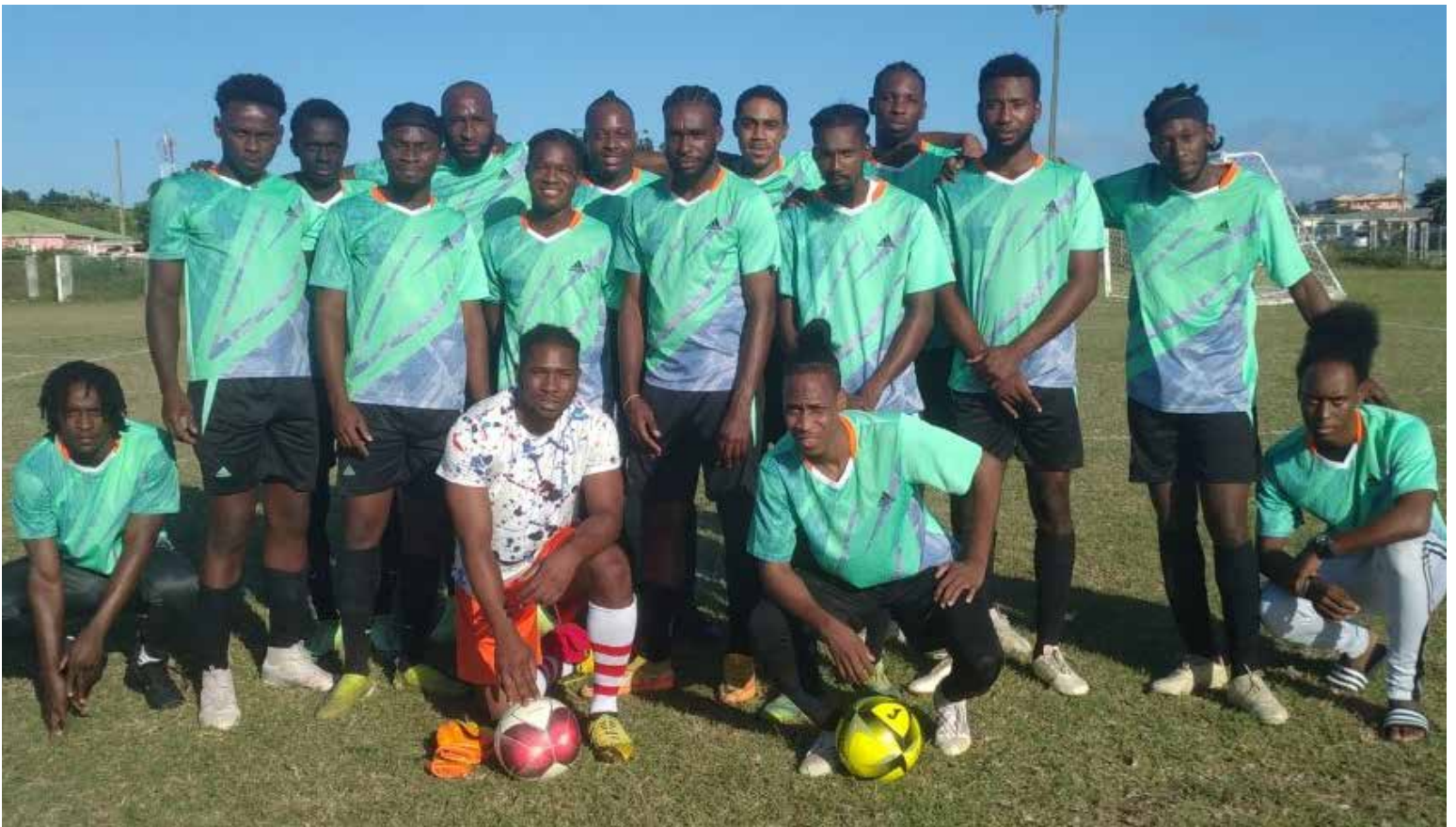
Players of the Potters Tigers football team. (File photo)