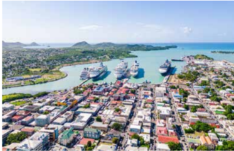
Aerial view of downtown St. John's

The collaboration with the Government of Antigua and Barbuda, and ‘World Travel in 360’ signifies a strategic digital renaissance for Antigua and Barbuda. The digital mapping of the entire road network promises enhanced accessibility for citizens and an immer-