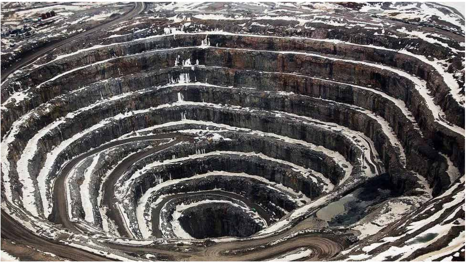
The Diavik Diamond Mine in the North Slave Region of the Northwest Territories, Canada.