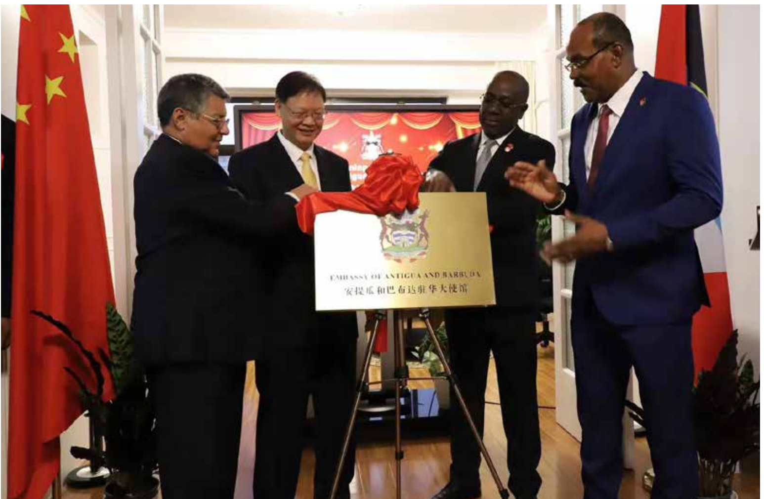
Prime Minister Gaston Browne, right, and other members of the Antigua and Barbuda delegation participate in the opening ceremony of the Embassy of Antigua and Barbuda on Tuesday. Story on page 3.