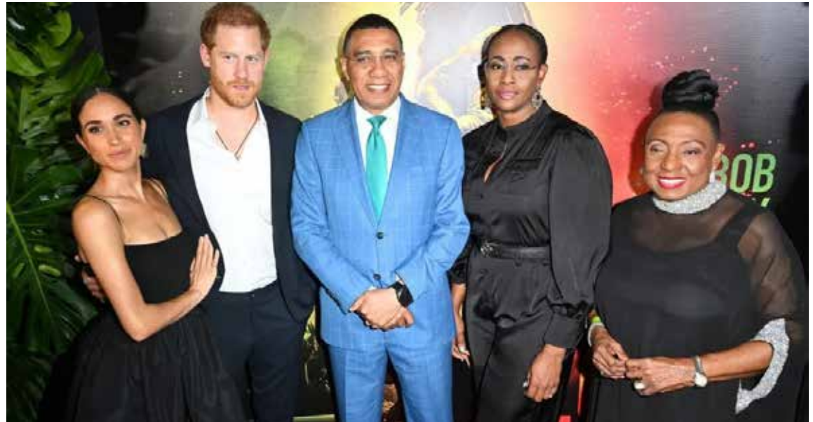
Meghan and Harry with the Jamaican prime minister Andrew Holness at the film premiere.

The film, due to be released in the UK next month,