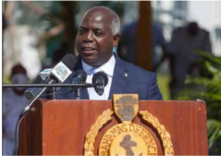
Bahamian Prime Minister Phillip Davis.

He said the government’s strategy titled “Crackdown 2024: Build-