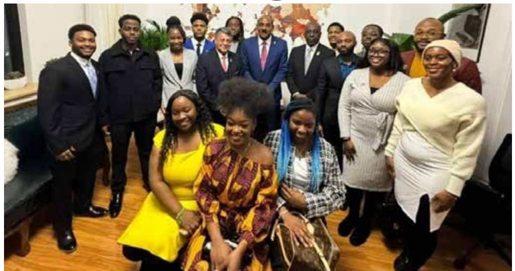
Prime Minister Gaston Browne and delegation with Antigua and Barbuda students in China.

“Your philosophy to ensure that there is shared global prosperity and peace is one that resonates globally and I believe that you have demonstrated unparalleled leadership and we are hoping that others, especially those in the developed nations, will follow your lead and that of the People’s Republic of China in ensuring that we can have a more