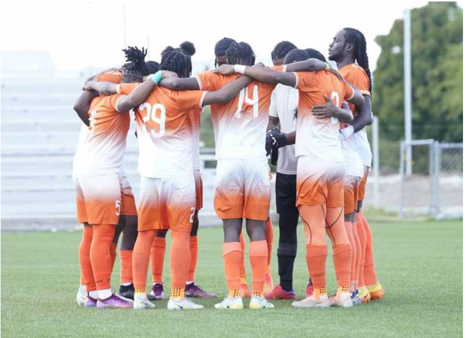
Players of the Pigotts Bullets football team.