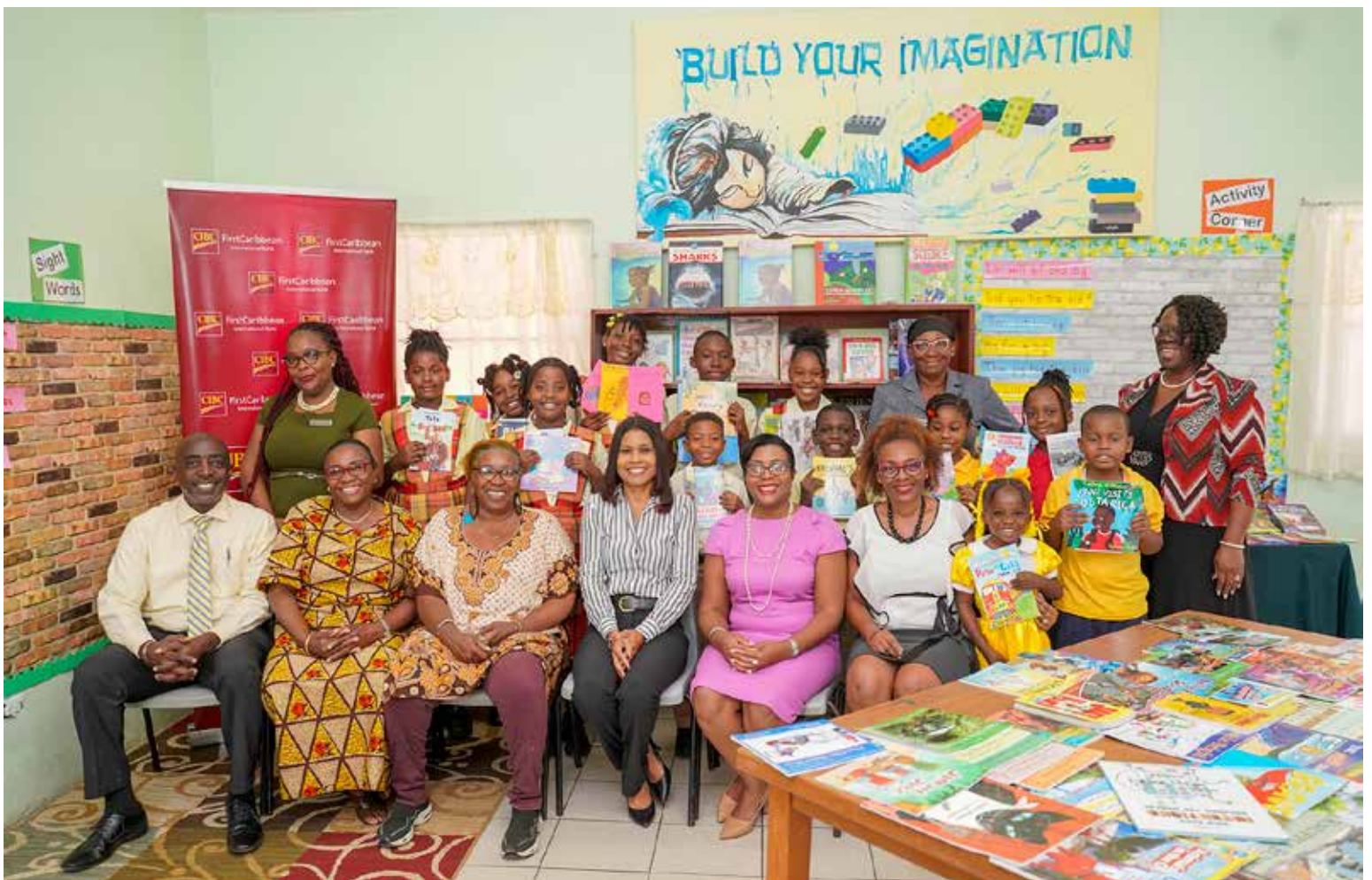
The Pigotts Primary School and the Antigua Girls High School received donations of books and other school supplies via a partnership between Hands Across the Seas and CIBC FirstCaribbean International Bank. Story on page 7.