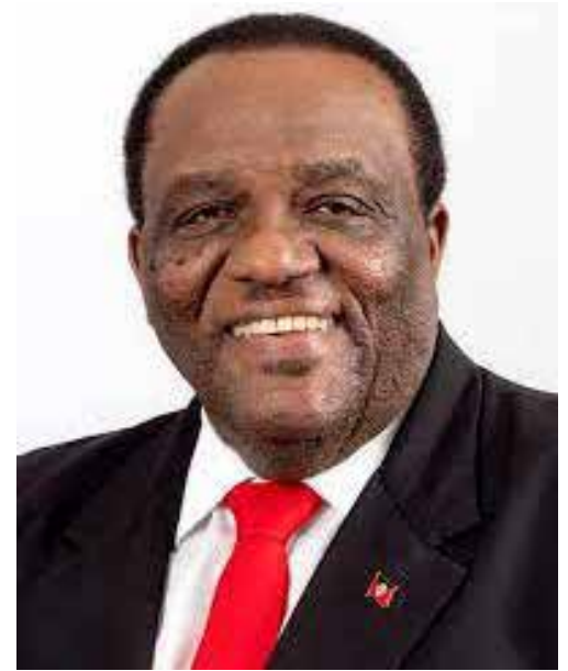
Sir Steadroy Benjamin