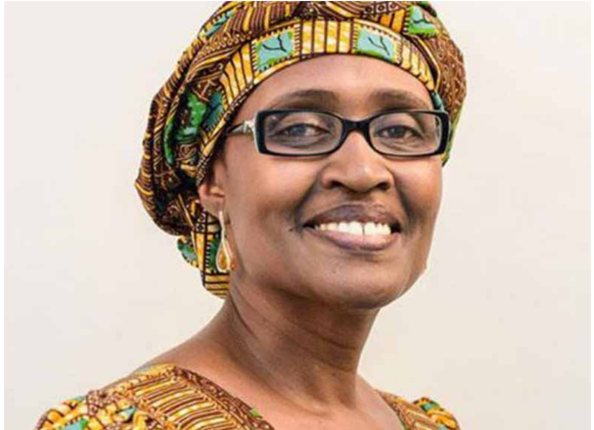
UNAIDS Executive Director, Winnie Byanyima.

"This government, and indeed the whole House, has demonstrated its commitment to preventing and punishing acts of domestic violence through the passage of these important amendments which will, among other things, allow the Court to issue Protection Orders and impose a