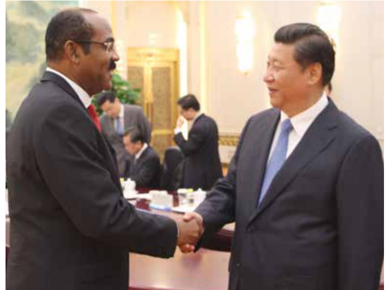
Prime Minister Gaston Browne, left, with Chinese President Xi Jinping.

During the visit, Antigua and Barbuda will officially open an embassy