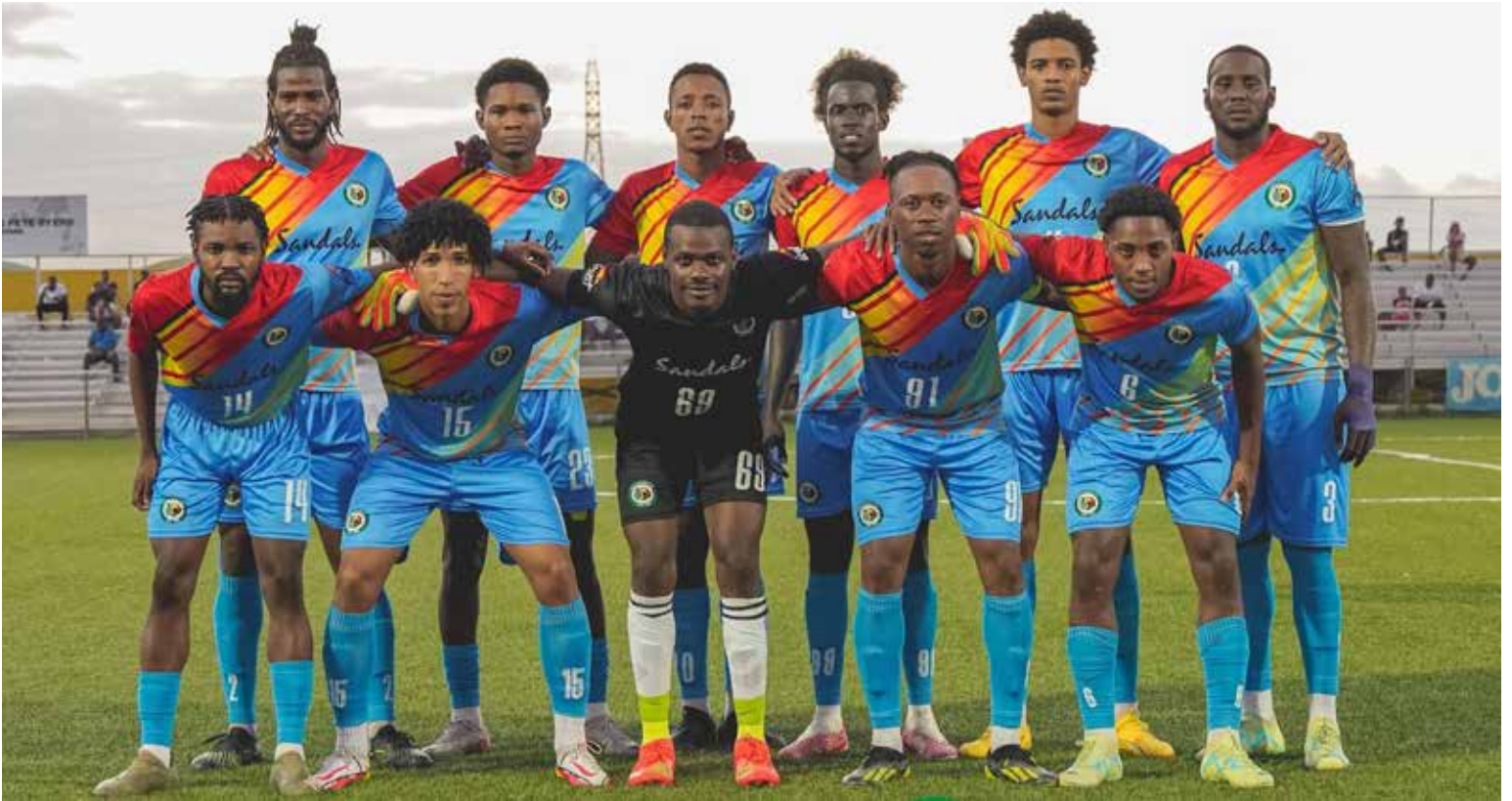
Players of the Sandals, Inet Jennings Grenades football team.