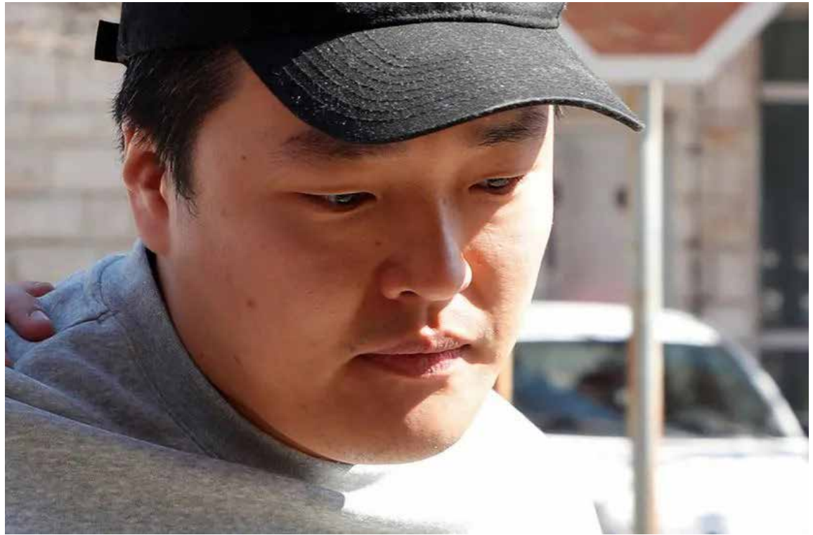
Do Kwon being taken to court in Montenegro in March 2023.

raUSD plummeted to about $0.02 - which then caused the Luna coin to nosedive.