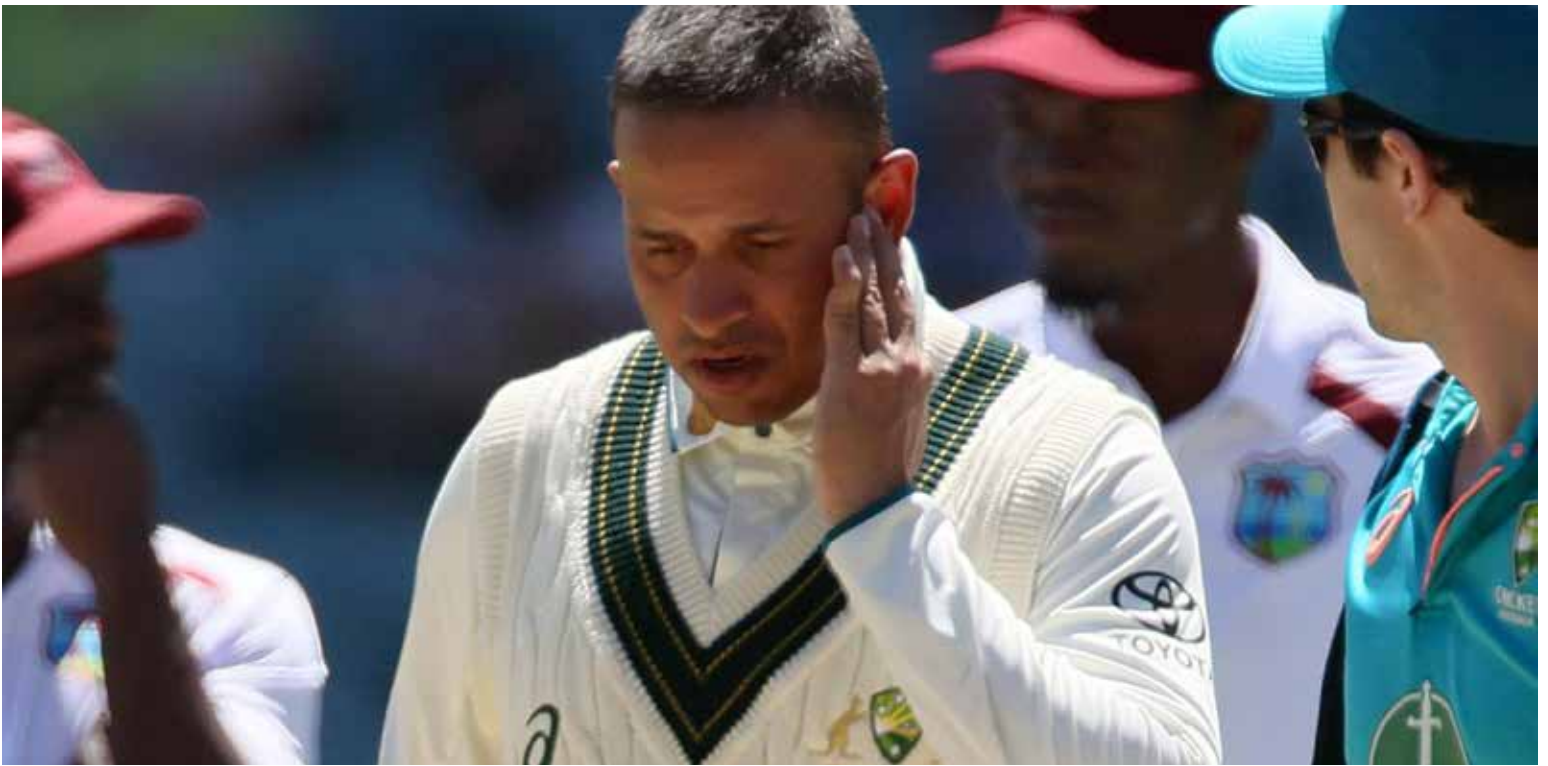
Australia's Usman Khawaja walks off the field after being injured on the third day of the first Test against the West Indies at the Adelaide Oval on Friday, January 19, 2024.