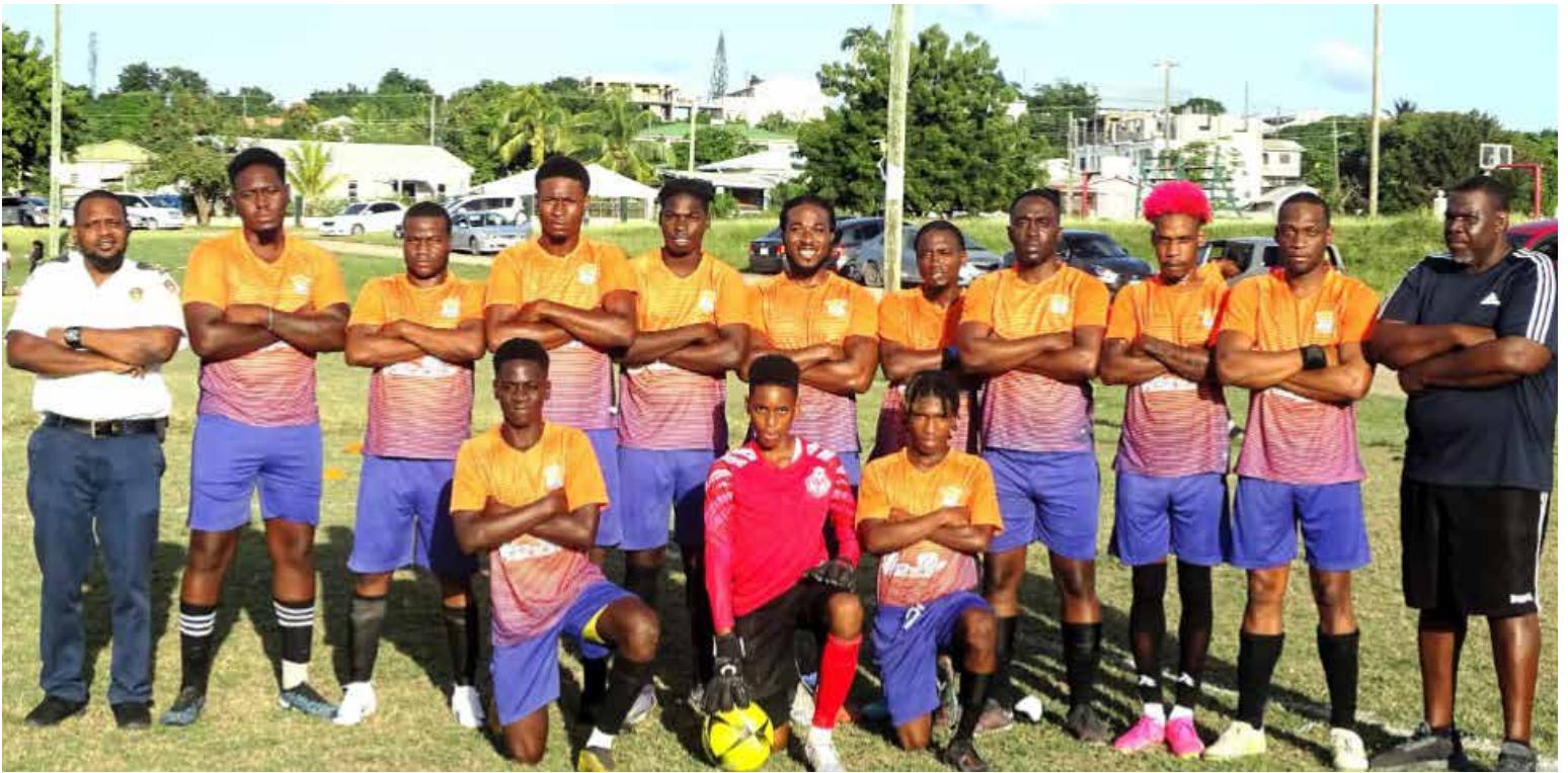
The FC Master Ballerz football team. (File photo)