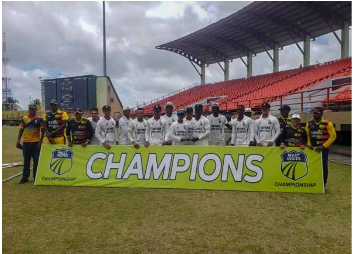
The Guyana Harpy Eagles who won the title in 2023 will be defending this year's Cricket West Indies regional four-day championship.

Matches will be played at three venues in Jamaica. They are Sabina Park,