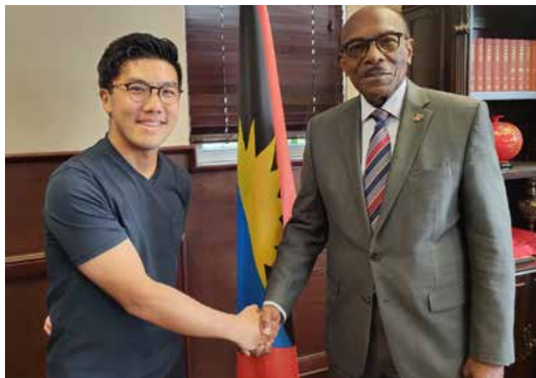
WOTA Representative along with Health and Environment Minister, Sir Molwyn Joseph

Key highlights of the progress include the successful completion of demonstrations for the WOTA Box, conducted between December 7th and 10th, 2023, at prominent locations such as the De-