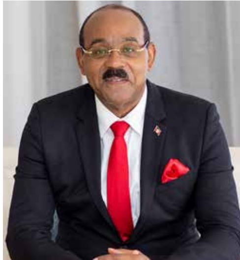
Prime Minister Gaston Browne sibility to you,” PM Browne declared in a social media posting.

“Your expectation that our government should have stepped in and pay you US$13M with tax-payers money is unconscionable and wicked. The GOAB has no such fiduciary respon-