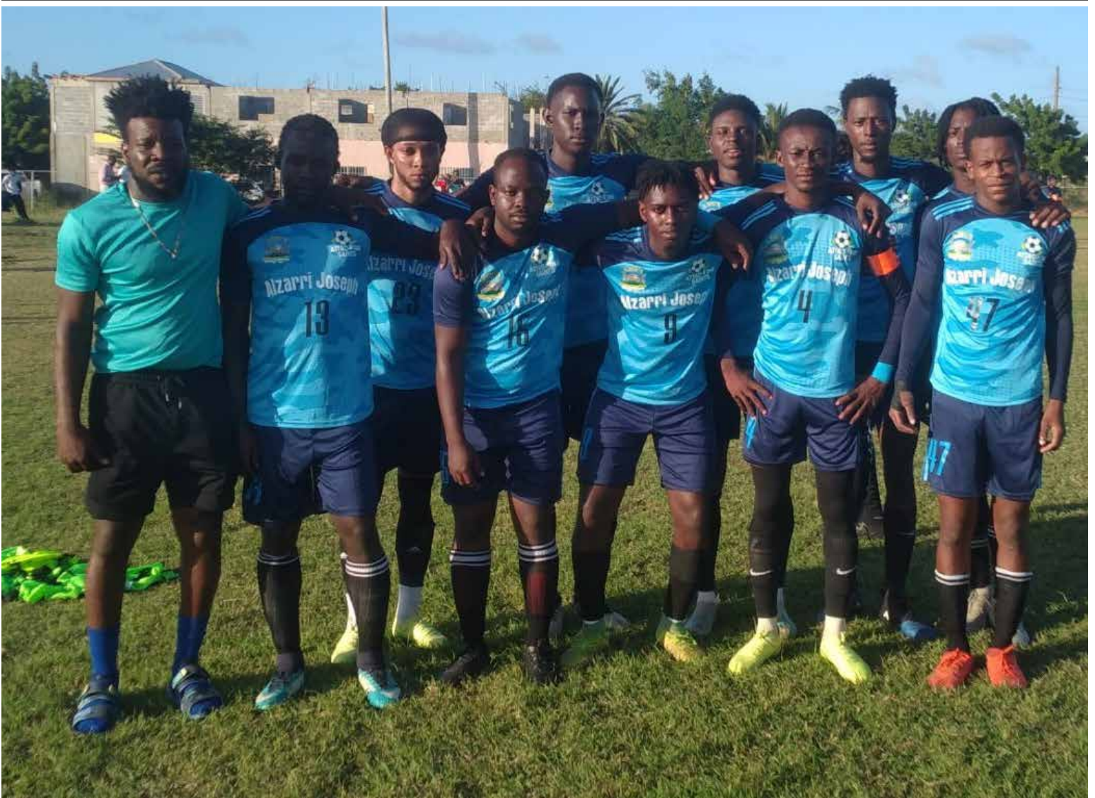
Players of the Attacking Saints football team. (File photo)