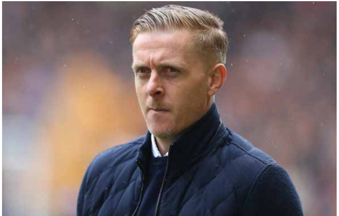
Coach Garry Monk

Monk, who accepted an invitation from President