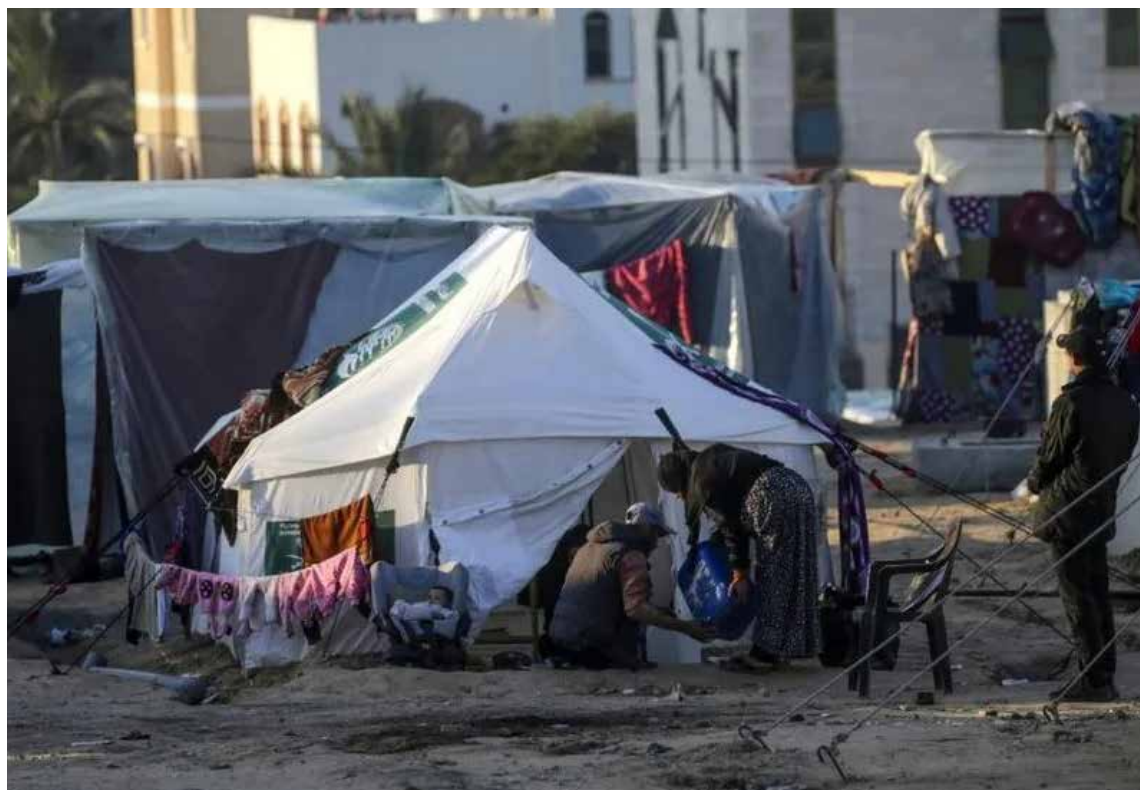
About 85% of Gaza’s population has been displaced.

The aid will then be taken to Gaza, to be delivered to civilians, while medicines are to reach Israeli captives.