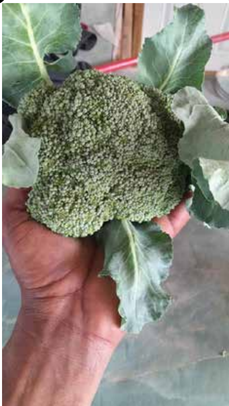
Sample of the broccoli being produced on farm part owned by PM Gaston Browne

During his visit to St. John’s, the Saudi ambassador also held discussions with Foreign Minister, E.P Chet Greene as well as visited the campus of the University of the West Indies at Five Islands. Saudi Arabia has approved US$80 million to finance the expansion of the university. Work on this will begin shortly.