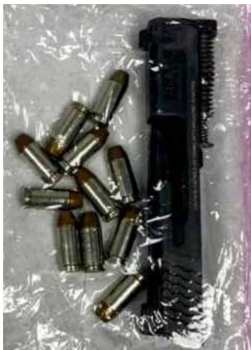
These bullets were part of the seizure at the port this week

A release from the police communications unit, STRATCOM said a firearm and several rounds of ammunition were seized at the Deep