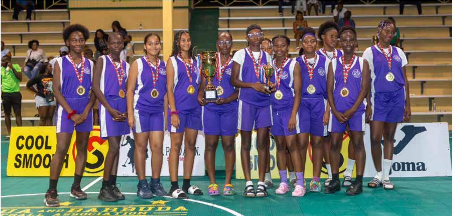
The All Saints Secondary School won back-to-back titles in the Senior Girls Division during the 2023 Cool and Smooth Inter-Schools Basketball Programme at the JSC Sports Complex on Sunday, April 9, 2023.