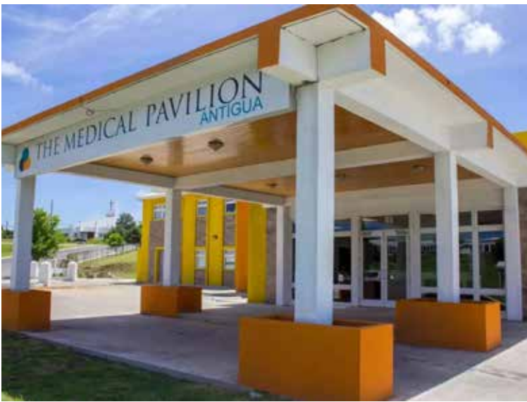
Eastern Caribbean Cancer Centre