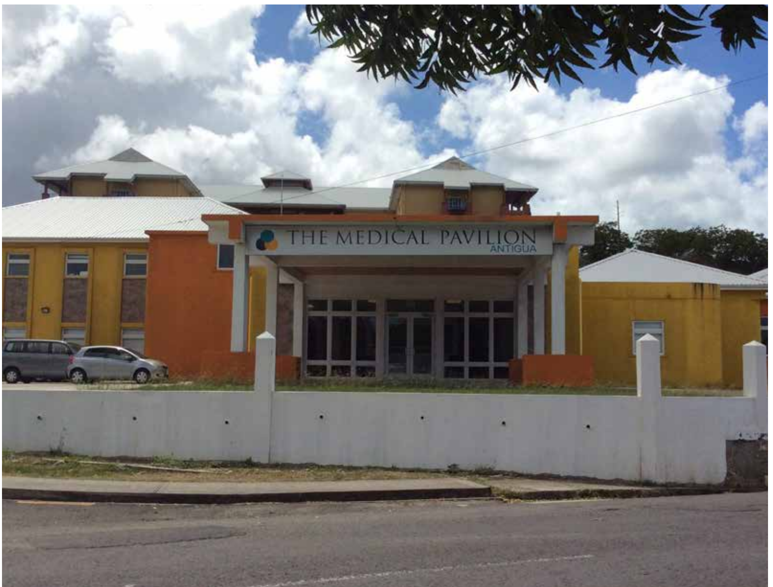
Preparations for re-opening the Cancer Centre are underway. Story on page 3.