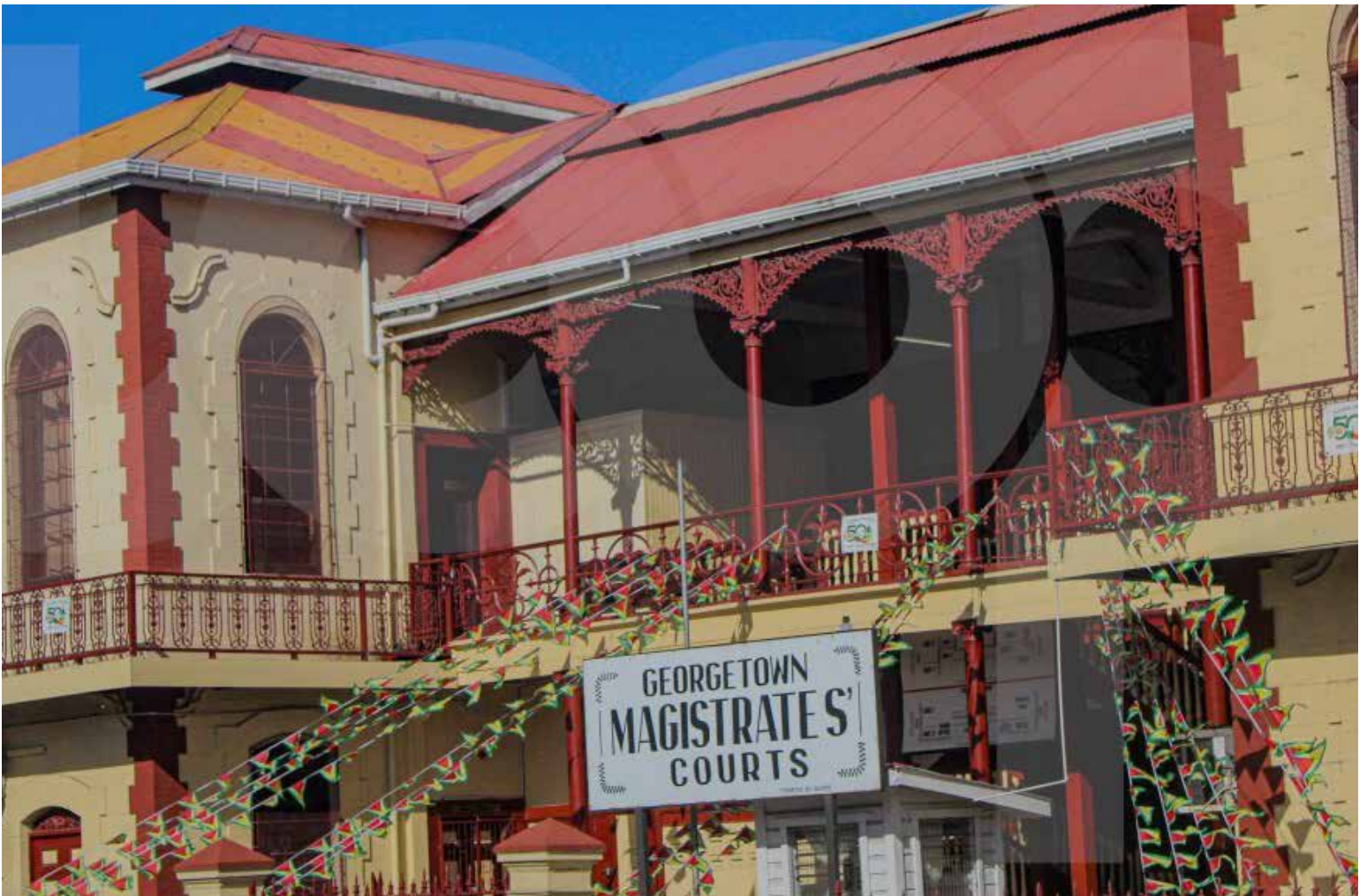
The Georgetown Magistrate Court.