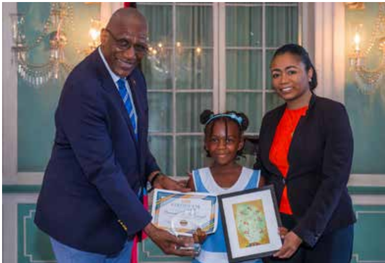
GG Sir Rodney Williams makes a presentation to the Christmas Card competition winner.