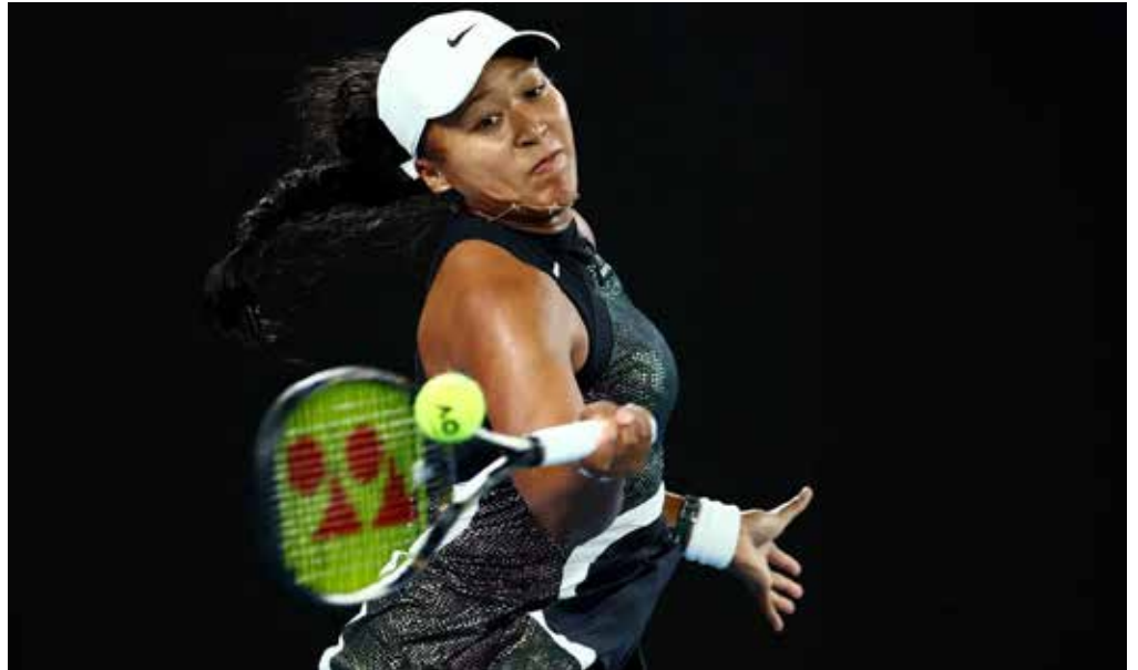
Naomi Osaka hits a forehand against Caroline Garcia in their first-round match at the Australian Open at Melbourne Park, Melbourne, Australia, January 15, 2024.