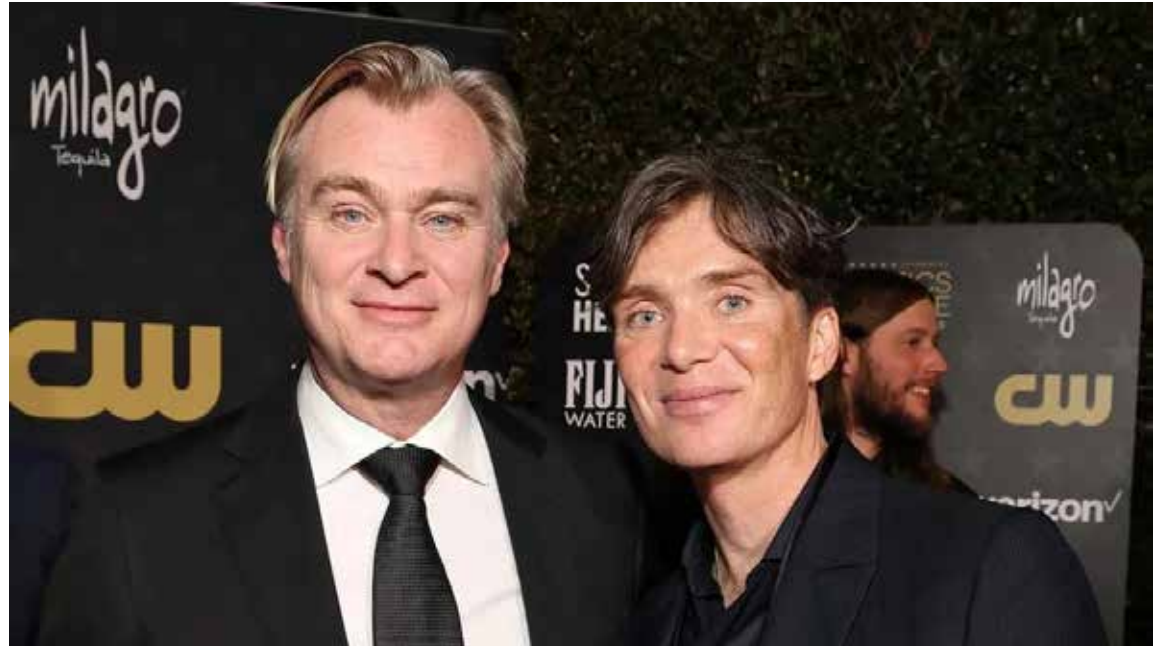
Nolan won best director but Murphy missed out on best actor.

"Receiving the SeeHer award for my contributions to more authentic portrayals of women and girls couldn't be more meaningful to me because I grew up as a first