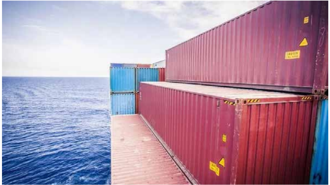
Container ship in the Red Sea (file image).

The Houthis have been attacking commercial ships in the Red Sea that the group says are linked to Israel, or bound for Israeli ports. It says the attacks are