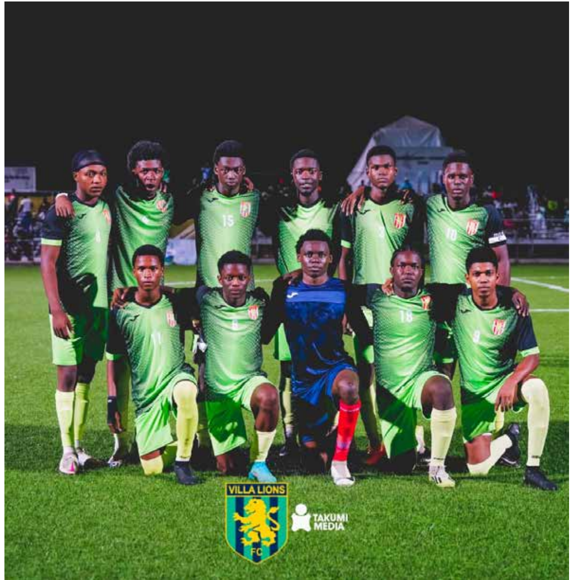
Players of the Villa Lions football team