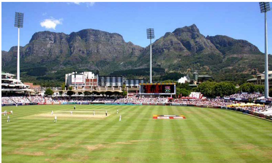
The Newland Cricket Ground in Cape Town, South Africa. said in an ICC statement.

"The pitch in Newlands was very difficult to bat on," match referee Chris Broad