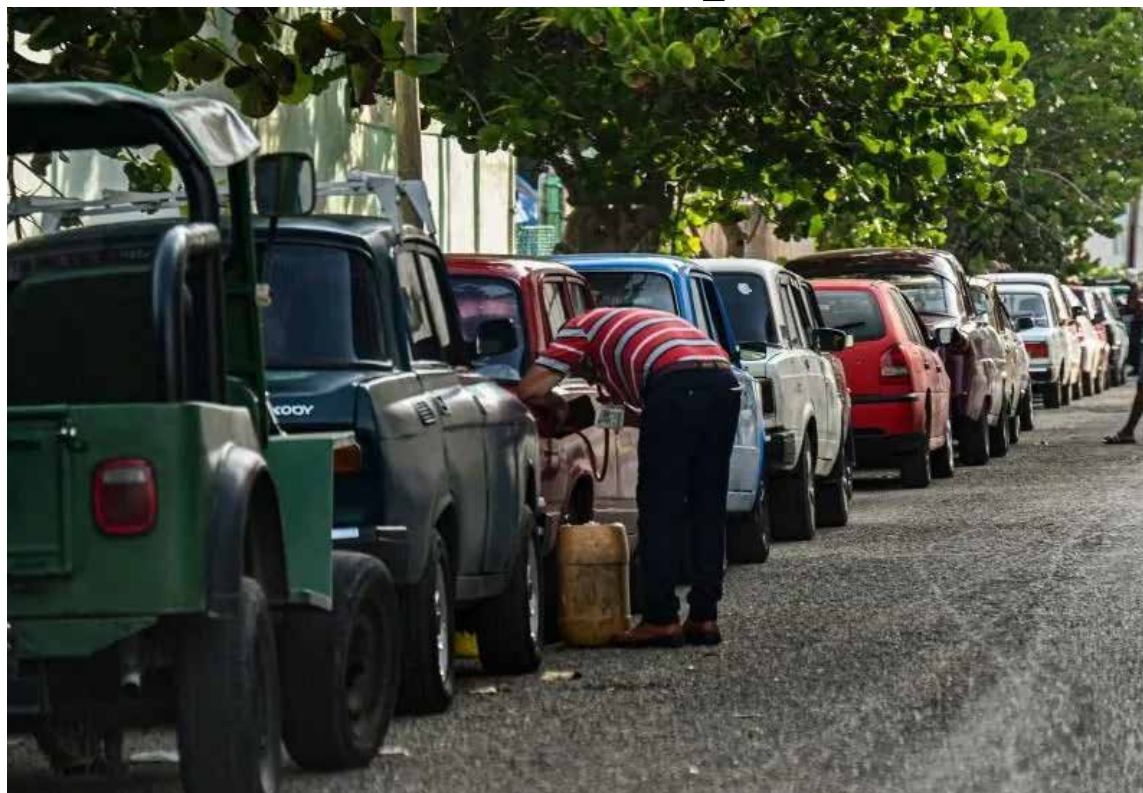
The cost of premium gasoline will rise from 30 to 156 pesos per litre from 1 February.

“These measures are aimed at reviving our econ-