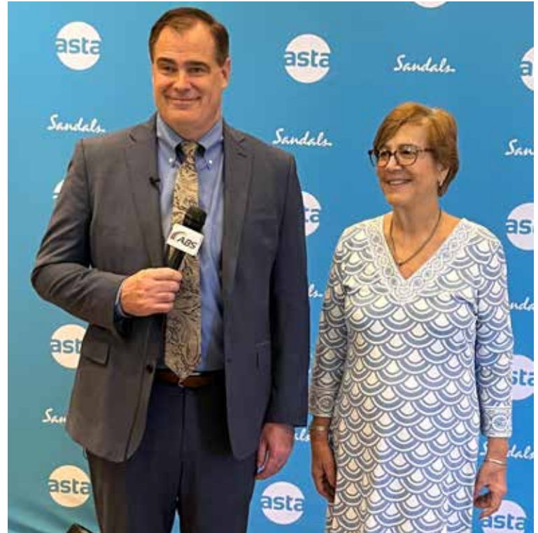
ASTA representatives. one hundred and twenty countries internationally. Sandals Antigua Grande Resort and Spa hosted the ASTA meeting on Monday and Tuesday.

It has membership in all 50 US states and in over