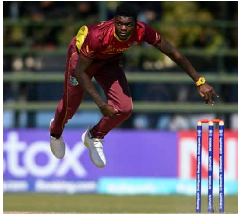
Antiguan and West Indies fast bowler Alzarri Joseph. (File photo)

"In this year's competition, the top players in the Leeward Islands were not playing for the St. Kitts Patriots. Rahkeem Cornwall represented the Barbados Royals, and Alzarri Joseph