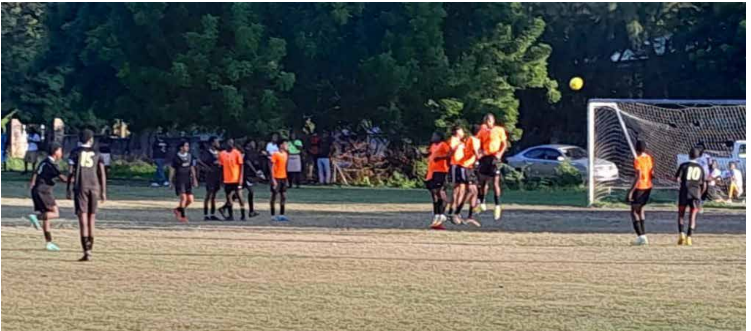
Antigua State College (orange jersey) defend against a free kick by Antigua Grammar School (black uniform) during their Under-20 Boys Division match at the PMS Playing Field on Wednesday, December 6, 2023.