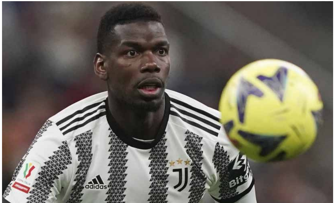
Juventus' Paul Pogba controls the ball during an Italian Cup soccer match between Internazionale and Juventus, at the Giuseppe Meazza San Siro Stadium, in Milan, Italy, April 26, 2023. Anti-doping prosecutors in Italy requested a four-year ban for Pogba on Thursday, Dec. 7, 2023.

the Serie A match but was on Juve's bench. Pogba has made no public comments on the case.