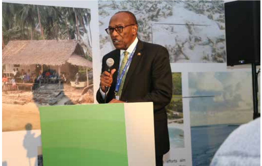
Sir Molwyn Joseph

“Embracing solar, wind and other cont’d on pg 7