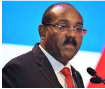
Prime Minister Gaston Browne shown its lasting friendship, coming to our government’s assistance at critical moments when no other states could.

“My government hopes that there will be a peaceful settlement in this long-standing matter. These two States are not just geographic neighbours. Guyana is our kith and kin, having a significant diaspora living in Antigua and Barbuda. Venezuela has