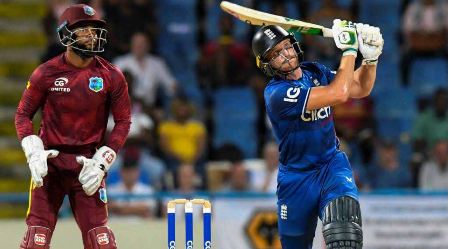
England's captain Jos Buttler, right, plays an attacking shot during the second CG United One-Day International against the West Indies at the Sir Vivian Richards Stadium in Antigua on Wednesday, December 6, 2023.