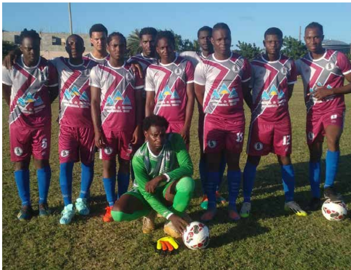
The English Harbour football team that beat Earthquake in their ABFA Second Division affair at the Fort Road Playing Field on Wednesday, December 6, 2023.