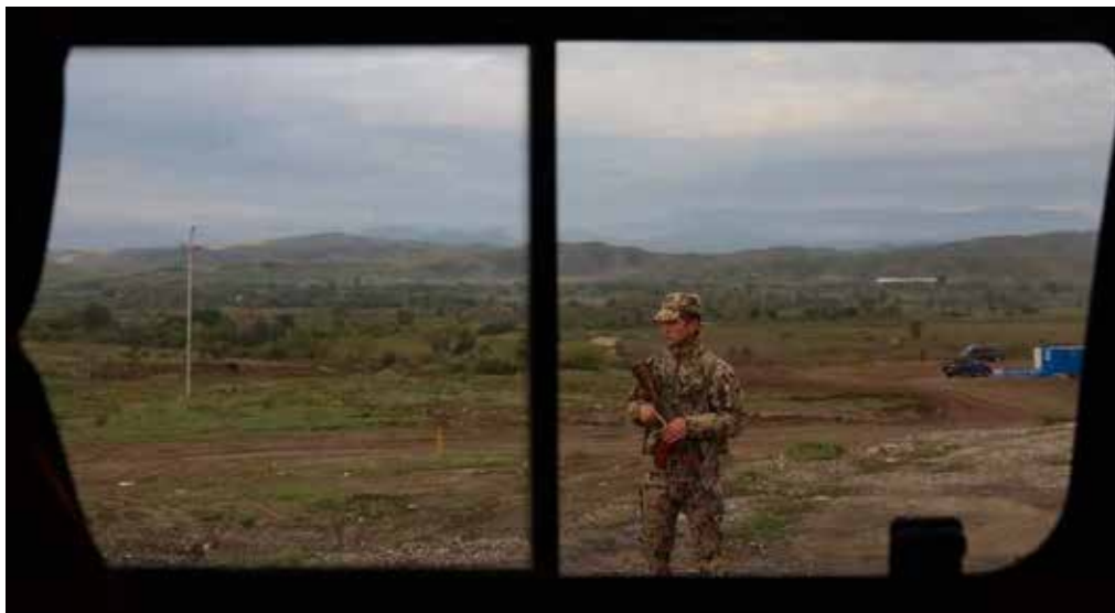
The two neighbours have been involved in a decades-long conflict over Nagorno-Karabakh.

Other moves include Armenia’s support of Azerbaijan’s bid to host the COP29 climate summit by withdrawing its own candidacy. Azerbaijan has