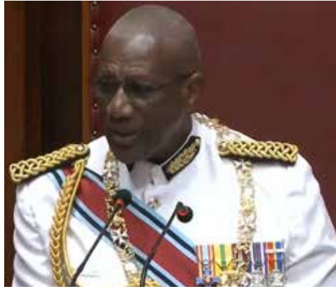
Governor General, Sir Rodney Williams

fold is yet to be revealed. However, it is believed that more information will be made public during next Friday’s budget presentation and when the budget debate is held. With oil consumption estimated at $400 million annually and the figure expected to increase, renewable energy will be the focus of the Gaston Browne administration.