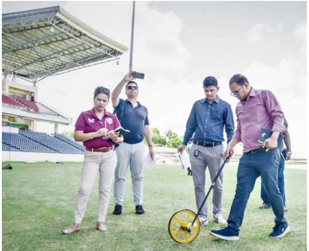
Representatives from the ICC and CWI delegation carrying out inspections at one of the host venues for the ICC Men's T20 World Cup 2024, the Sir Vivian Richards Stadium in Antigua, on November 30, 2023.

"This forms part of our overarching vision to host the biggest cricket carnival the world has ever seen and will help to reinforce the region's sta-