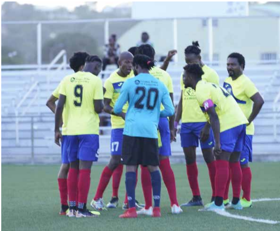
Players of the Greenbay Hoppers team in a huddle at the ABFA Technical Center. (File Photo)

By then, it appeared that Hoppers was on course for an easy victory, but Green City tuned the match into a tighter contest by producing a second-half fight back, which almost salvaged a draw and a share of the points.