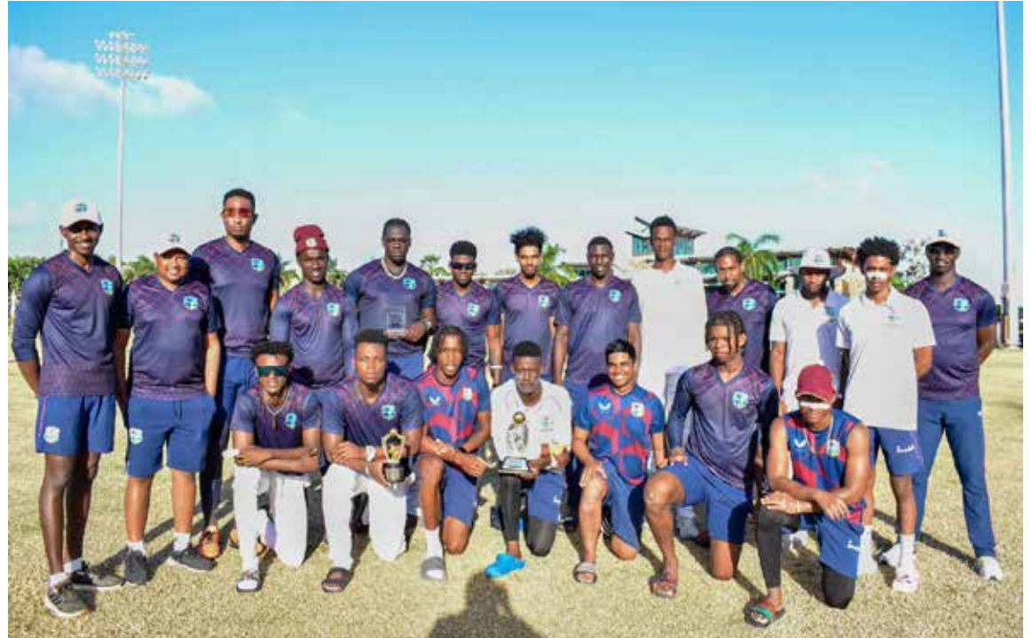
The West Indies Academy with their trophies after sweeping two-match series against Emerging Ireland at the Coolidge Cricket Ground here in Antigua on Monday, December 4, 2023.