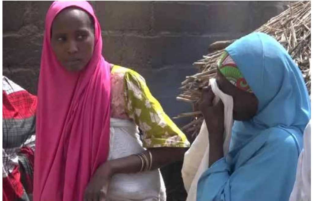
Villagers have lost many family members in the airstrike by the military.

Gen Lagbaja said that troops were carrying out aerial patrols when they observed a group of people and “wrongly analysed and misinterpreted their pattern of activities” to be similar to that of the bandits, before