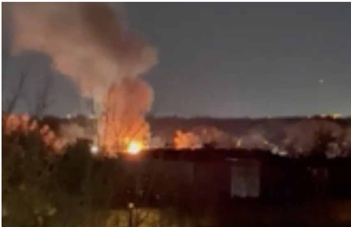
The fireball was seen across Arlington.