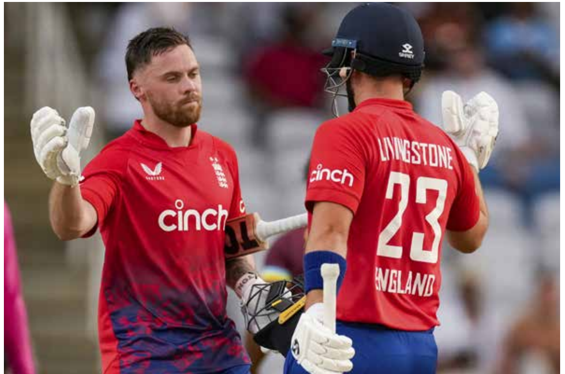
England's Phil Salt celebrates with Liam Livingstone scoring a century against West Indies during the fourth T20 cricket match at Brian Lara Stadium in Tarouba, Trinidad and Tobago, Tuesday, Dec. 19, 2023.

Salt also struck a belligerent 109 not out in the third