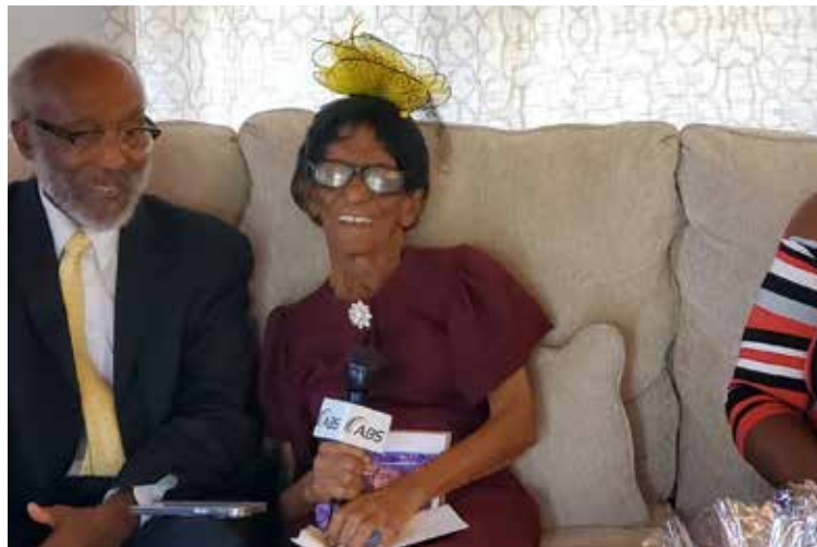
The nation's oldest citizen turned 106 on Wednesday chat.

Hodge is always willing to share with anyone the 'secret' to her longevity as she is always open for a good