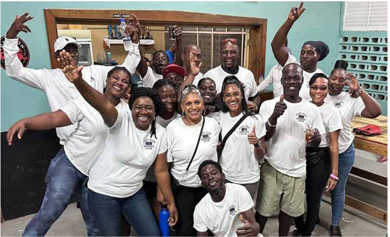
Players of the Full Clip A team celebrate after winning the Antigua and Barbuda National Domino Association's final three-hand competition of the year at the ABNDA headquarters in Ottos.