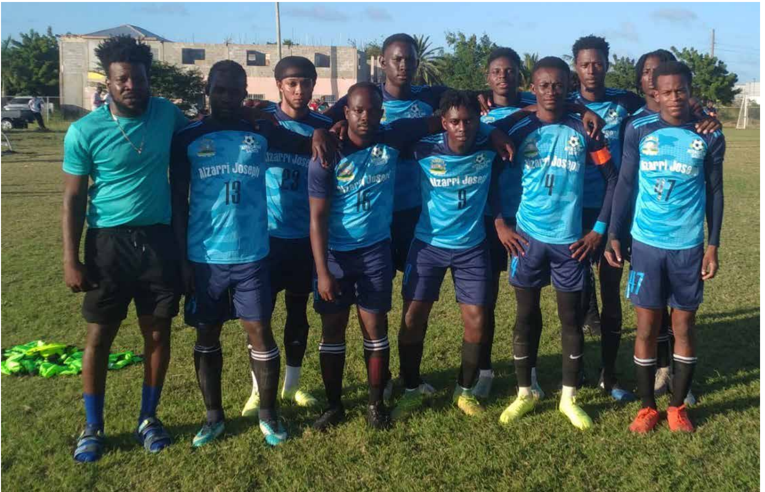
Players of the Attacking Saints football team. (File photo)