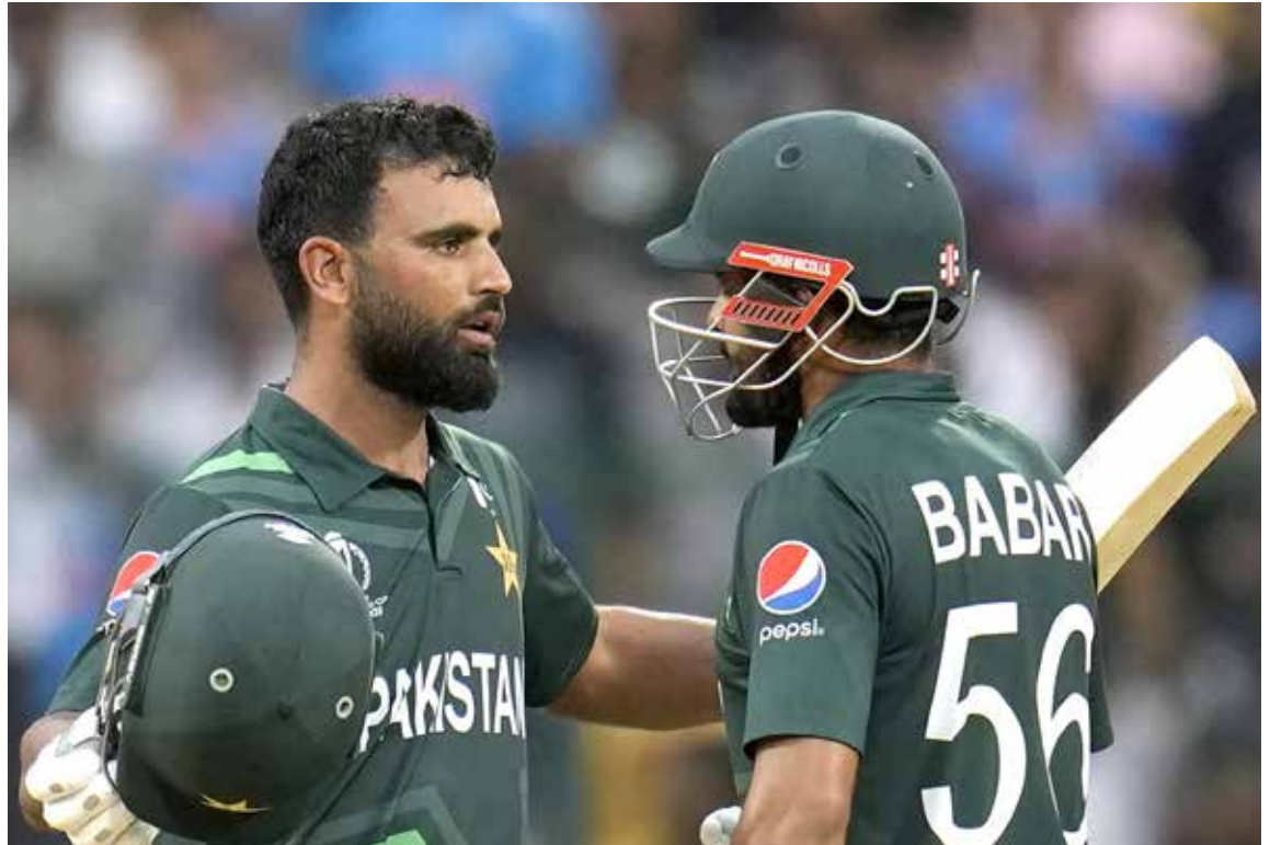
Pakistan's Fakhar Zaman celebrates his century with captain Babar Azam during the ICC Men's Cricket World Cup match between New Zealand and Pakistan in Bengaluru, India, Saturday, Nov. 4, 2023.

The board later gave him permission to play a limited