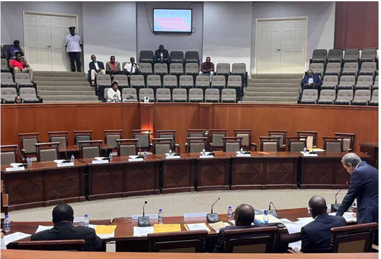
The parliamentary debate on the 2024 National Budget for Antigua and Barbuda started in the House of Representatives Tuesday morning...but with one notable feature, the absence of members on the opposition side of the chambers. Story on page 5.