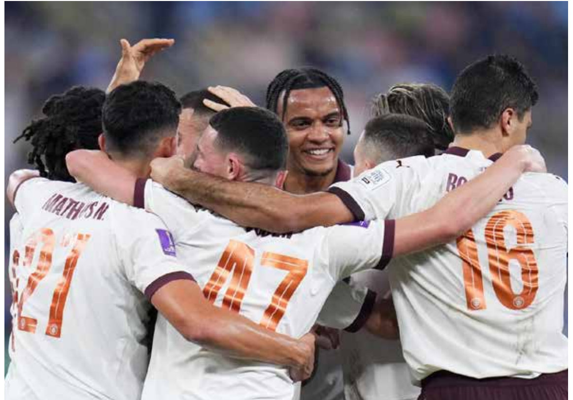
Manchester City players celebrate after Mateo Kovacic scored their second goal during the Soccer Club World Cup semifinal soccer match between Urawa Reds and Manchester City FC at King Abdullah Sports City Stadium in Jeddah, Saudi Arabia, Tuesday, Dec. 19, 2023.

City have suffered some domestic wobbles