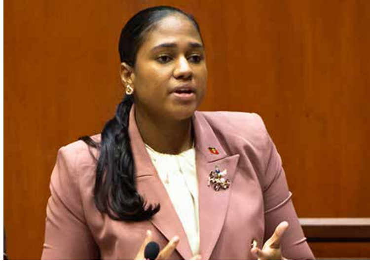
Housing Minister, Maria Bird-Browne

Minister Bird-Browne reported that the housing revolution is well on the way with 400 homes earmarked for Oliver’s that will feature a combination of homes constructed by the National