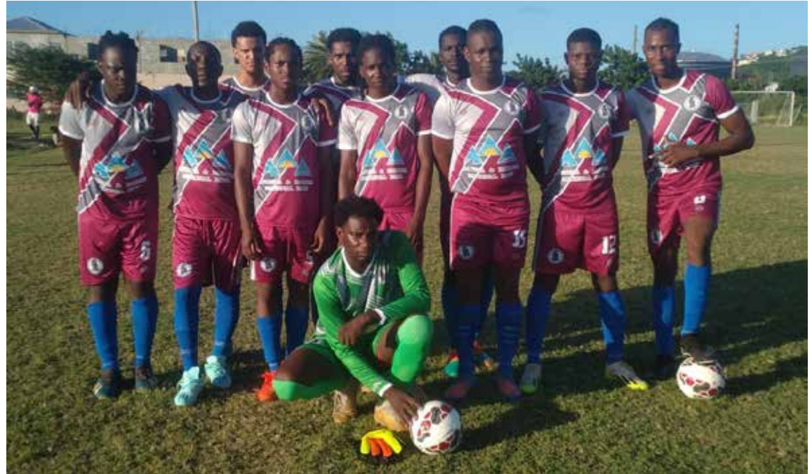
Players of the English Harbour football team. (File photo)

with conversions in the 4th and 30th minutes, and Jaquon Watts scored in the 12th minute to propel English Harbour to their third win in four matches.