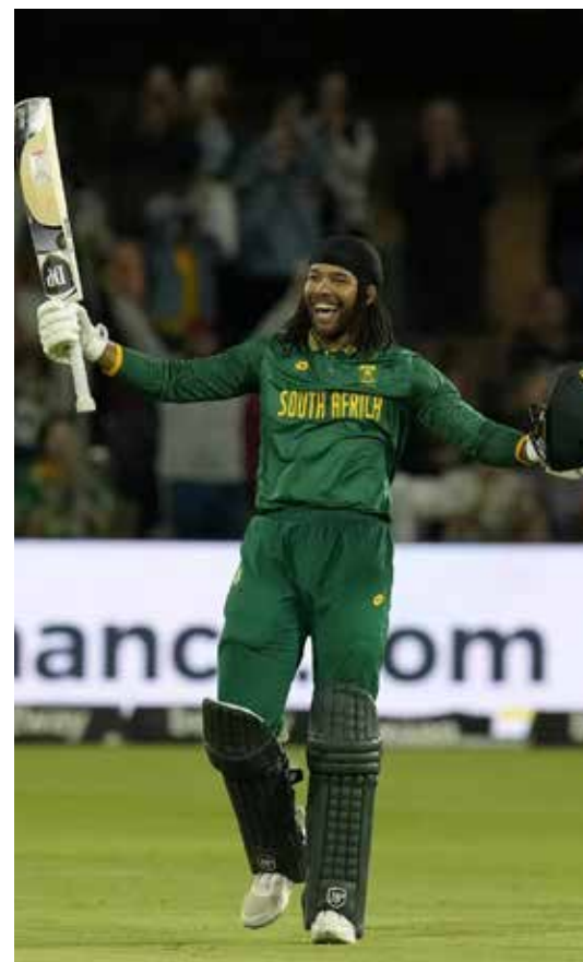
South Africa's Tony de Zorzi celebrates after scoring a 100 runs during the second One Day International cricket match between South Africa and India at the St George's Park in Gqeberha, South Africa, Tuesday, Dec. 19, 2023.

Both sides have rested key players with a two-match Test series to follow, starting in Pretoria on Dec. 26.