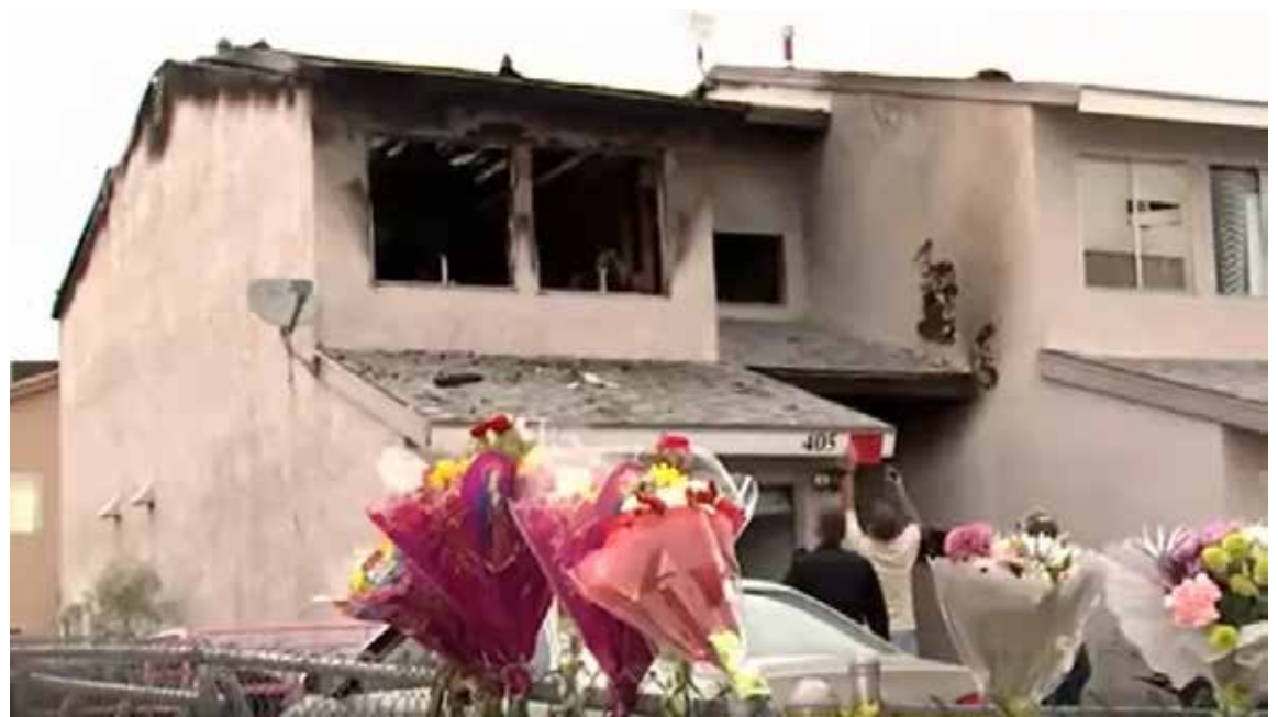
Five children died in the Arizona house fire - the oldest was only 13.

“The children’s father reported to investigators that he was gone for approx-