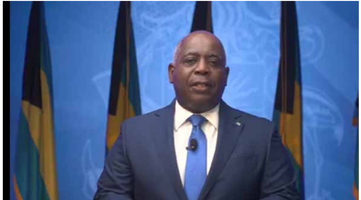
Bahamas Prime Minister Phillip Davis.

received information that some detainees suffered vision loss due to their detention in darkness," the report said, noting also recurrent complaints about detainees' inability to access medical care and the absence of treatment for drug-dependent people."